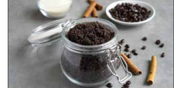
Stovetop Simmer Jars