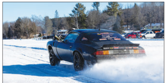
The Merrill Ice Drags kicked off their 2025 racing season with their "Test and Tune Day" on Saturday, Jan. 18, 2025.