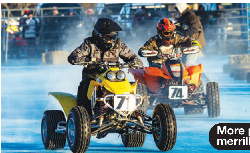
Some scenes from the Ultimate Ice Racing event held at the Merrill Fairgrounds this past Saturday, Jan. 4, 2025.