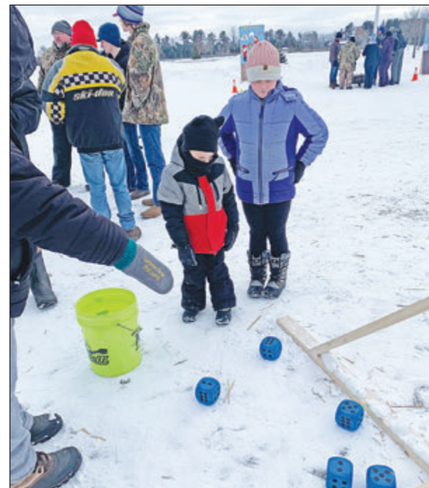
Children play one of the games with the help of a volunteer, at the 2024 January Jamboree. Submitted photo.