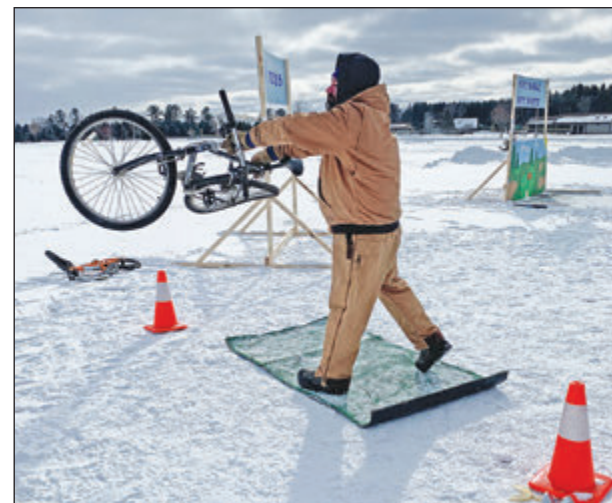
What kinds of skills are involved in tossing a bike? Submitted photo.