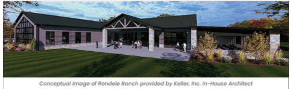
Conceptual Image of Rondele Ranch provided by Keller, Inc. In-House Architect

project is funded by Rondele Ranch and construction is being done by Keller, Inc. of Wausau, Wisconsin. No traffic impacts are expected as a result of the estimated year-long construction.