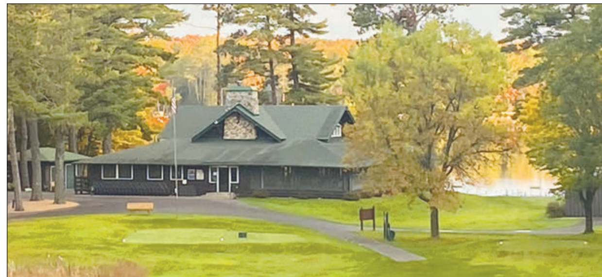
Plum Lake Golf Club offers a scenic and peaceful experience to all patrons.