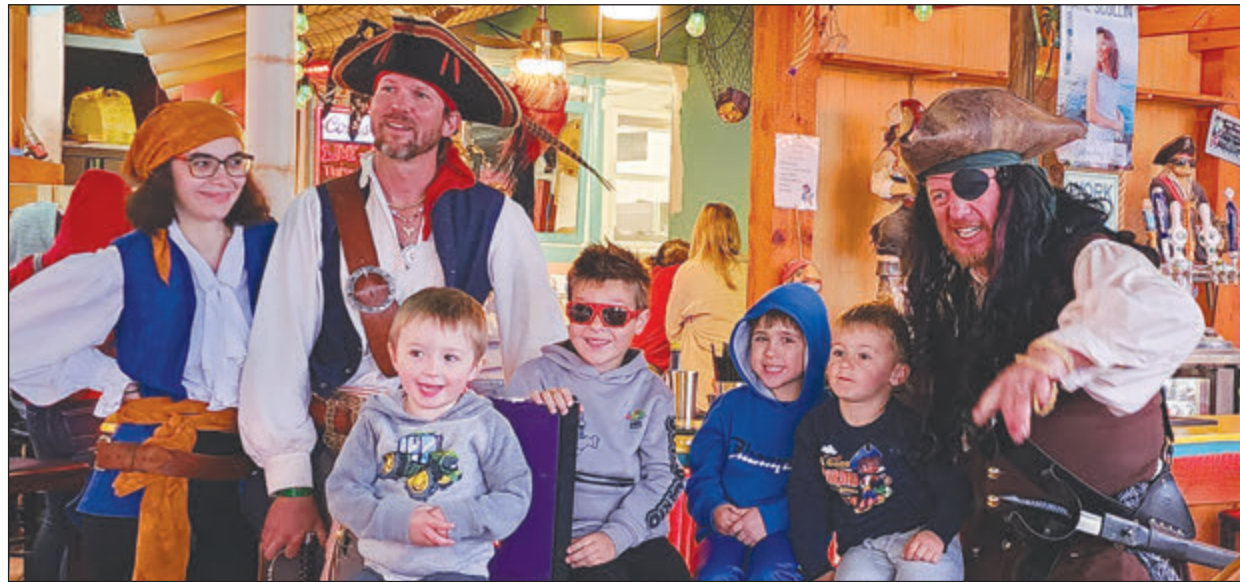
On-land adventures with pirates, ice cream and wood-fired pizza await youngsters and families alike at Pirate's Hideaway.

The lakeside tiki bar at Pirates Hideaway also offers a diverse and delicious range of tropical cocktails, craft beer and wine selections. It is quickly becoming a "must-check-out" destination when visiting Eagle River, but also provides a fun regular stop