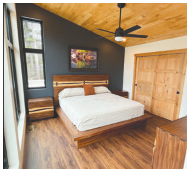
Cornerstone offers limitless options for customers to design their dream home.