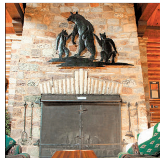
Classic, North-Woods-inspired suites await guests at the Gateway Lodge.

For more information on Gateway Lodge, call 715-547-3321 or visit gateway-lodge.com