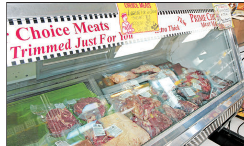
Customers at Prime Choice can select quality meats ranging from beef, pork, poultry and premium seafood.

CHECK US OUT ONLINE AT WWW.VCNEWSREVIEW.COM/SPECIAL/ VACATION_WEEK