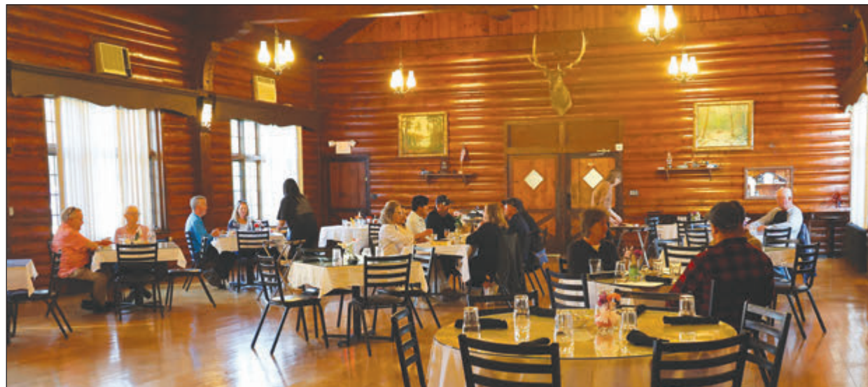
Gateway Lodge has a banquet facility that can accommodate up to 120 people for weddings, banquets, showers, anniversaries and birthdays.