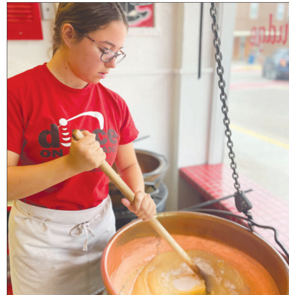
Patrons can enjoy the experience of watching employees make fudge at the front of the shop.