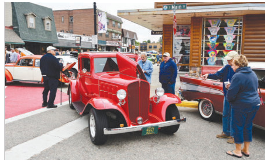
The Eagle River Car and Truck Show will take place in downtown Eagle River this weekend, Saturday, Aug. 24, from 9 a.m. to 3 p.m. Showgoers can view a variety of classic cars and trucks while also enjoying food and beverages available for sale.

Area chambers of commerce and organizations plan events as added attractions to the lakes and forests that already bring people to the North Woods. The activities scheduled range from craft fairs and antique shows to live music offerings. In addition to the events listed here, some weekly events are planned around the area as well, including water-ski shows, live music, and more. For information on things happening in a specific town, visit the corresponding chamber of commerce website. The following is a list of events and activities from tourism officials and other sources. Detailed stories on some of the events can be found in this publication.