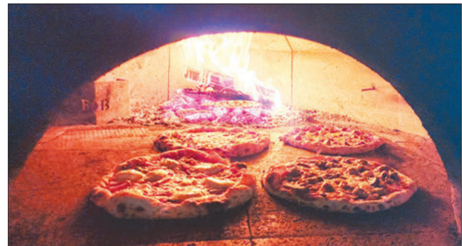
Enjoy fresh, handmade wood-fired pizzas alongside a drink or two from the lakeside tiki bar at Pirate's Hideaway.

For more information, visit eagleriverpirates.com or call 715-479-6756.