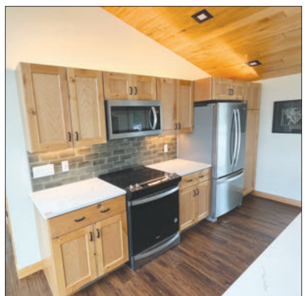
Cornerstone has seven different model homes available to tour for inspiration when building a new home.