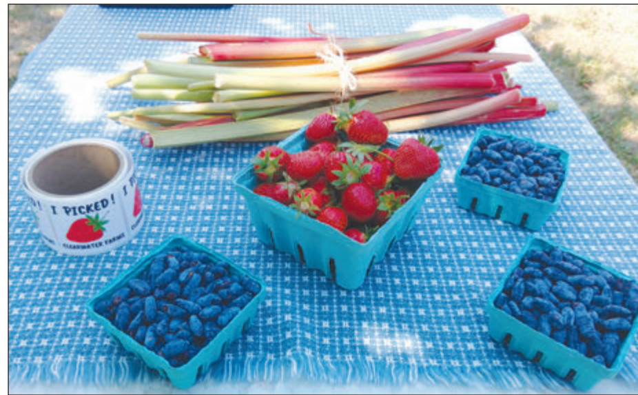
An array of fresh produce can be picked at Clearwater Farms, including rhubarb, strawberries, and honeyberries.