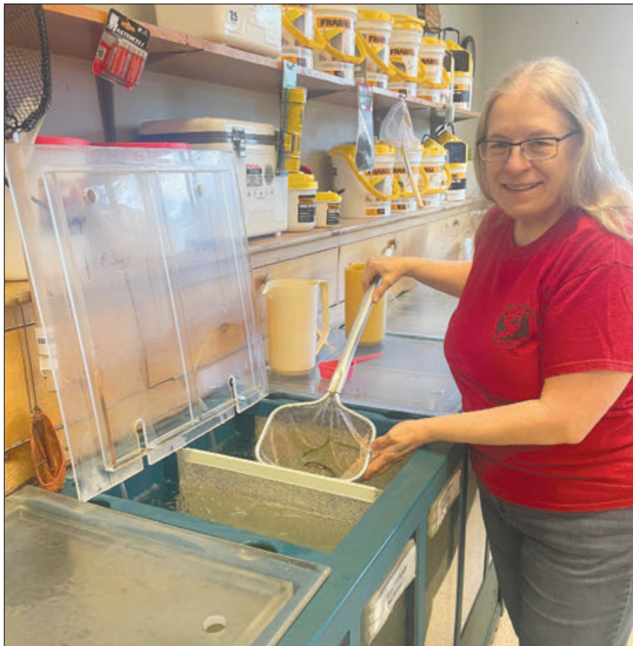
Tackle Box offers a wide variety of live bait for purchase.

For more information, call 715-547-3434, email info@tackbox.com , or visit tackbox.com .