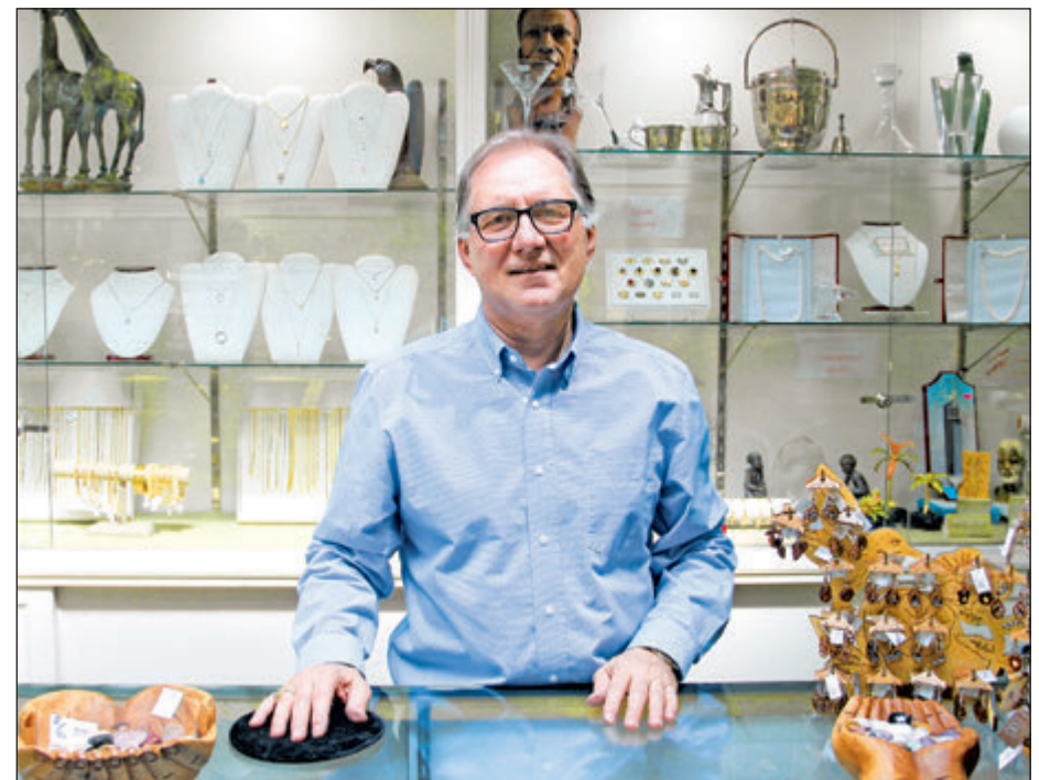
Lehner-Stephan Jewelers provides customers with a wide selection of unique, one-of-a-kind jewelry to choose from.