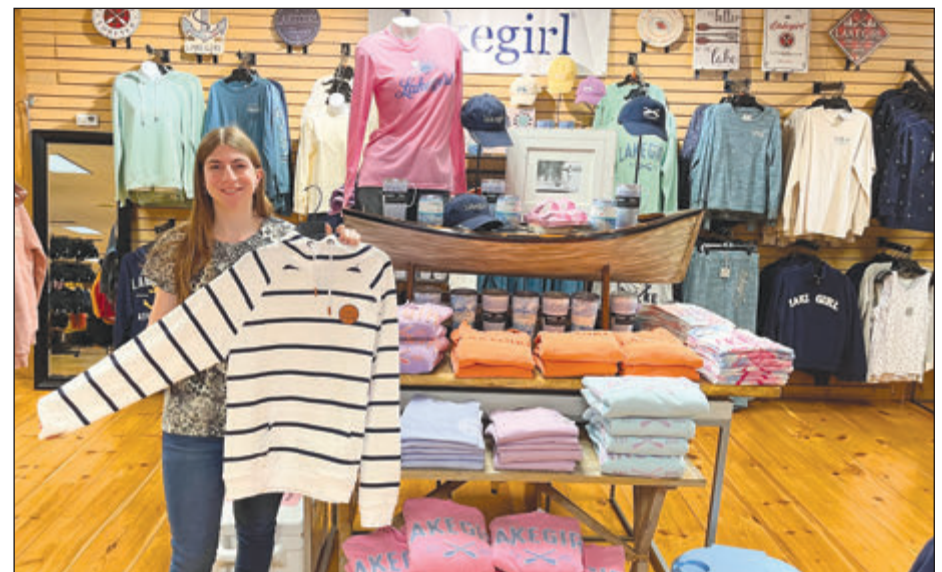
Popular brands such as Patagonia, Life is Good, Lakegirl, Carhartt, Brighton, Prana, Kuhl, Vera Bradley, Tentree and Vouri can be found at WalkAbout Apparel & Paddle.

For more information, call 715-479-6631, or email them at info@walkabout-paddle.net .