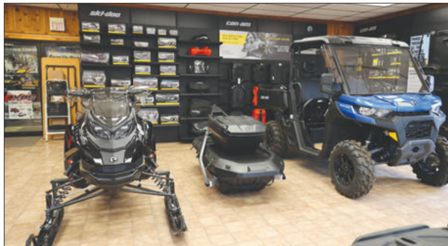
The dealership also has a newly renovated showroom that offers an extensive selection of clothing and sportswear like boots, helmets, goggles, gloves and bibs from brands such as Ski-Doo, Can-Am, and Klim.