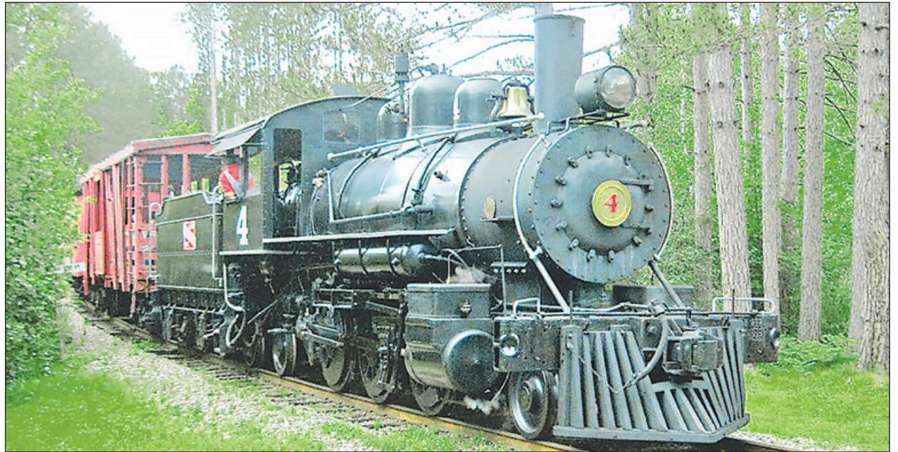
This year marks the 56th anniversary of the operation of the 1916 steam train carrying visitors to the Camp 5 Museum complex.