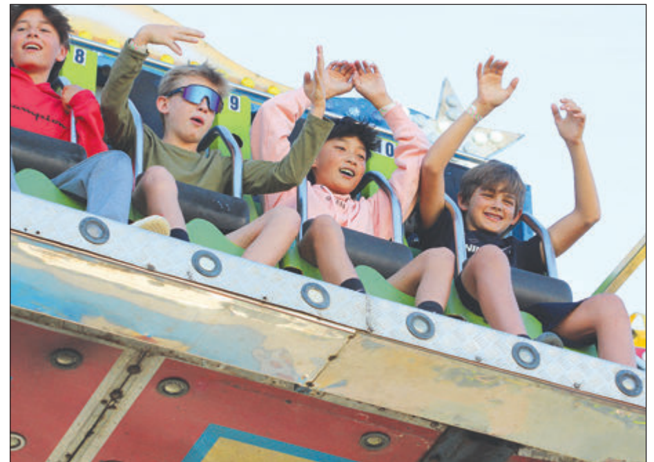
The Vilas County Fair is full of family fun and will be held Aug. 8-11 at the Vilas County Fair Grounds.

stage from 6 to 8 p.m. at the Music on Main Street live music event in downtown Boulder Junction. Guests are encouraged to bring their own seating.