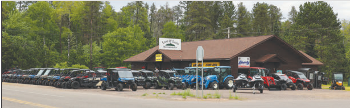
The Land O' Lakes Recreation Co. is a must-stop for anyone looking to take part in year-round outdoor recreation or take care of their little slice of heaven in the North Woods.

The Land O' Lakes Recreation Co. is a must-stop for anyone looking to take part in year-round outdoor recreation or take care of their little slice of heaven in the North Woods.