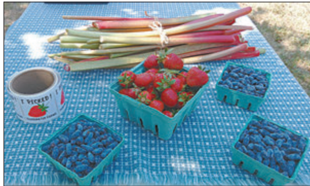
Strawberries, honeyberries and other fresh product can be hand-picked at Clearwater Farms.

“It’s unfortunate that that’s the case,” she said. “It can also be easier for farms to manage in terms