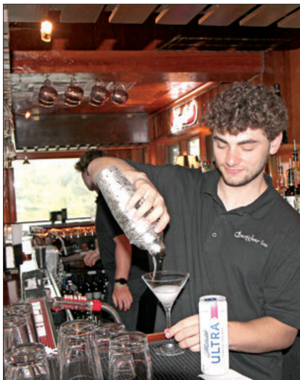
The dining- and bar area is staffed with enthusiastic employees, most of whom returned from last year, ready to greet patrons with a smile.

There is free Wi-Fi available throughout the entire resort, and guests also have access to Dollar Lake, a privately-owned lake off the Chain.