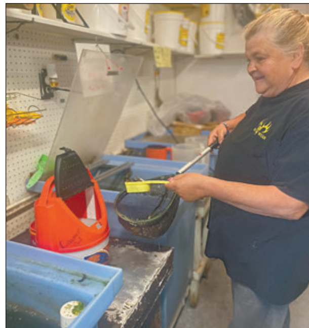
Various kinds of live bait can be purchased.

For more information call 715-546-3776 or visit Scottie's Bait and Tackle's Facebook page.