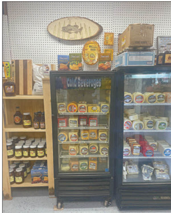
Over 40 different kinds of cheeses can be found, and purchased, as well as Amish jams, maple syrup and jerky.