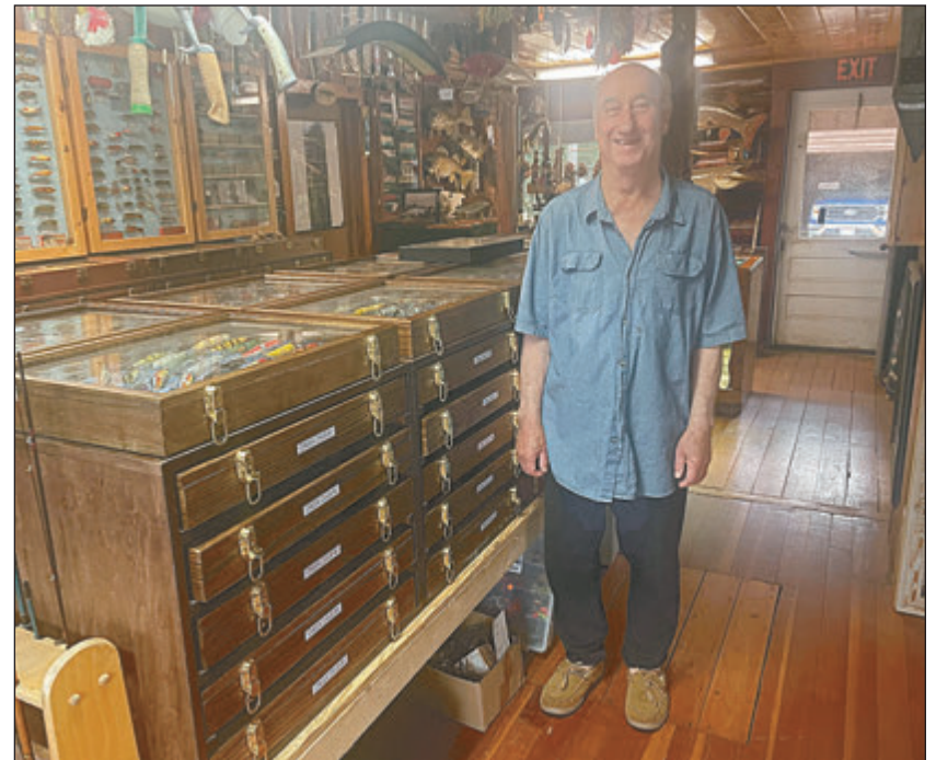
At Al’s Tall Pines Gallery, thousands of antique fishing lures, rods, reels and more can be found on every wall.

Also new for this year, the Muskie Lure Swap Board is returning. Patrons can swap two of their