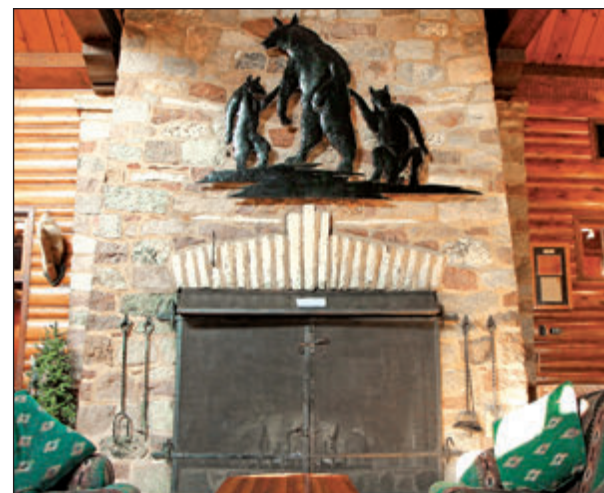
Trap shooting, golfing, waterfall chasing and skiing can all be enjoyed while staying at the Gateway Lodge.

An evening happy hour is available Tuesdays through Thursdays from 4 to 6 p.m. when guests