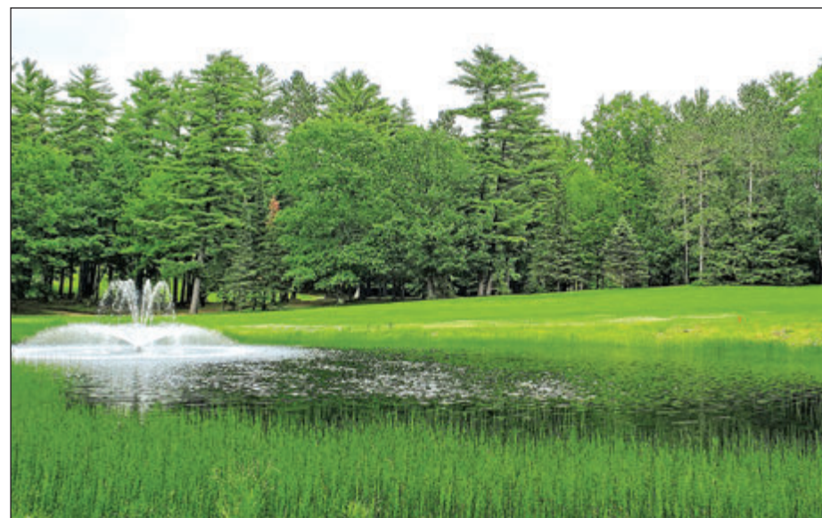
With scenic views, a challenging 18 hole track and active wildlife throughout the property, the Eagle River Golf Course will celebrate its 100th season in 2023, and staff can't wait for guests to get a glimpse of what the course has to offer.

Originally built as a nine-hole track prior to