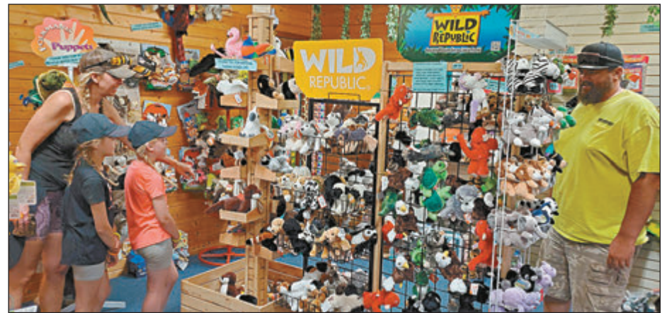
Located at the back of the store, Grandma's Toy Box offers a variety of creatures in their jungle of stuffed animals.

What Do You Meme, New Phone Who Dis, Camp, and the list goes on."