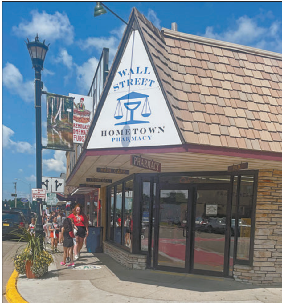
With an expansive prescription inventory, Hometown Pharmacy is ready to tackle almost any situation that arises.

cists have an emphasis on proactive health. They want to keep you healthy and prevent illness by dispensing products that keep you nutritionally fit and keep your body's defenses strong," said a Hometown Pharmacy spokesperson.