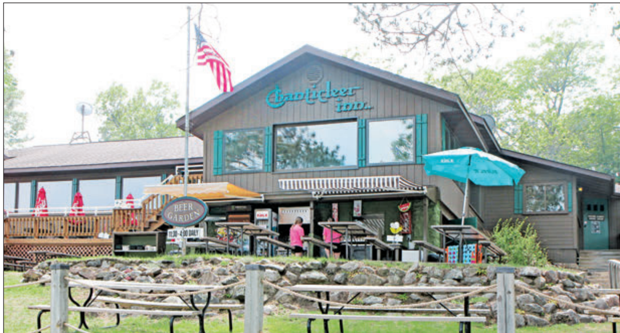
Chanticleer inn provides quality lodging and eats in the North Woods.