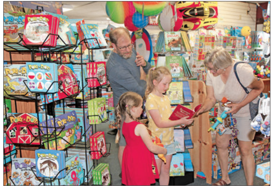
Grandma's Toybox has a collection of books, coloring pages and other indoor, rainy-day activities.