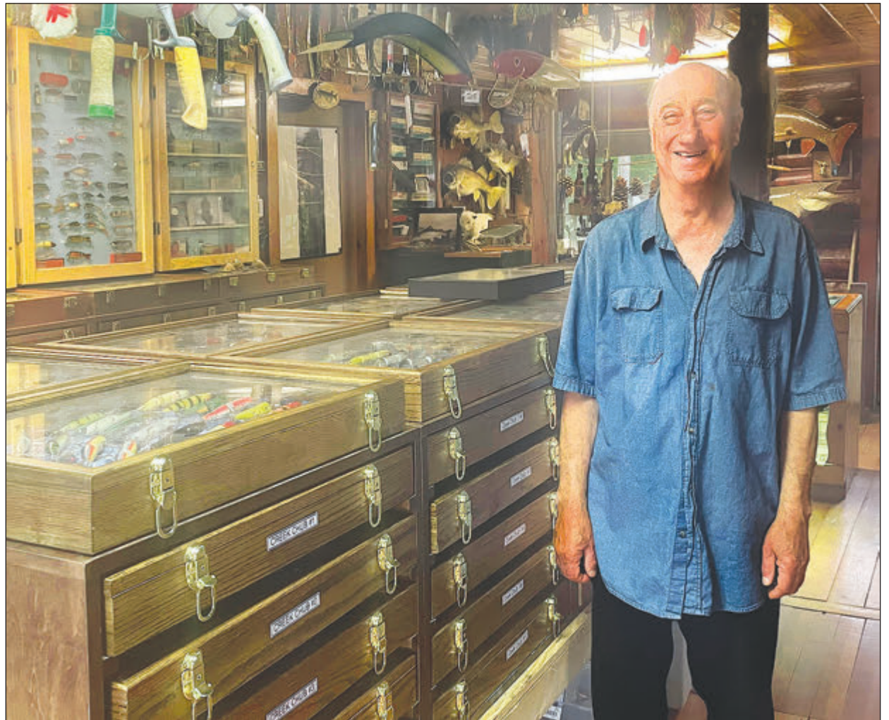
Tall Pines Gallery offers guests a unique experience, being like a museum where you can buy, sell, and appraise artifacts.

Not only does Tall Pines have a large selection of antiques, they also have "lots of modern muskie lures, in really good condition, being sold at reasonable