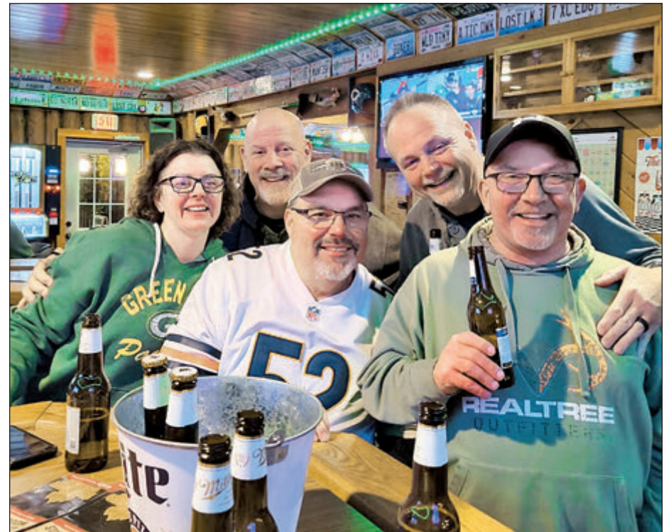
Whether you're cheering for the winning Green Bay Packers, or those Chicago Bears, you're always welcome at Timbers Bar & Grill in St. Germain.