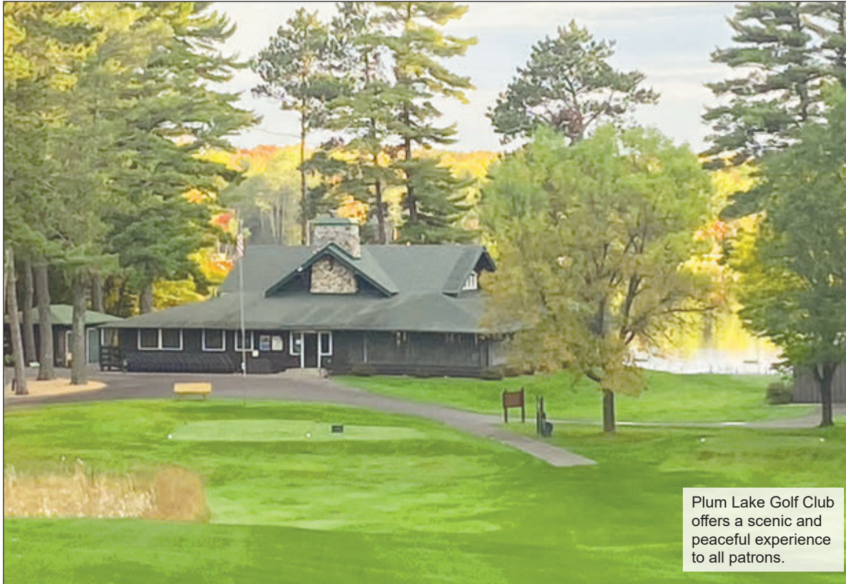
Plum Lake Golf Club offers a scenic and peaceful experience to all patrons.