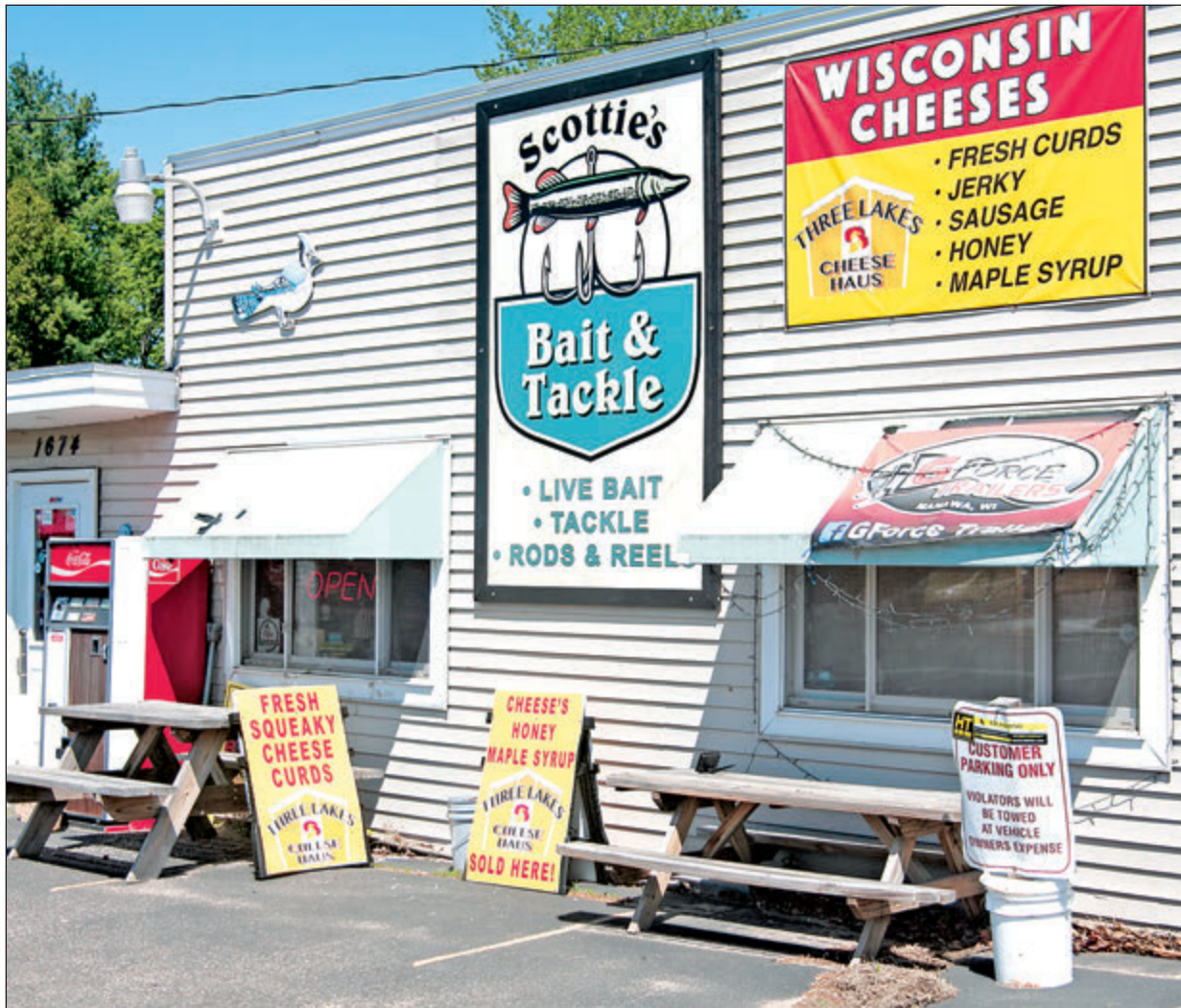
Filled with bait, tackle, rods, reels, assorted cheeses and other delicacies, Scottie's Bait and Tackle is a premeir destination for any angler as well as anyone looking for something to satisfy their summer cravings.