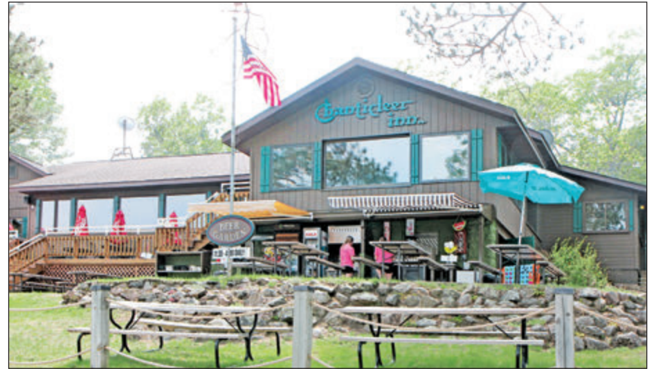
Right on the chain near Eagle River, The Chanticleer Inn has been a staple in the area to visitors and residents alike, offering lodging, food, drinks, and a friendly atmosphere year-round.

“It’s awesome to see the enthusiasm and the