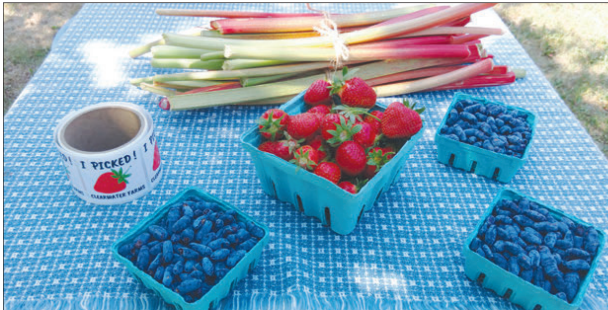
An array of fresh produce can be picked at Clearwater Farms, including rhubarb, strawberries, and honeyberries.