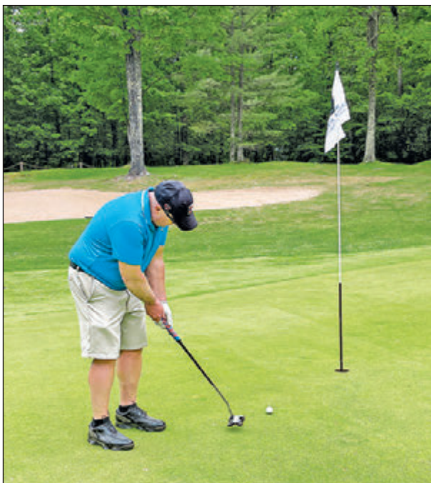
Patrons of all experience levels have the opportunity to have a great time at Eagle River Golf Course.

Those interested in obtaining more information about the golf course, or to book a tee time, can visit eagleriver-golfcourse.com , golfnow.com , the ERGC Facebook Page, or call 715-479-8111.