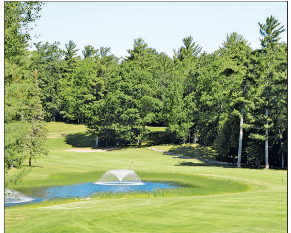
Eagle River Golf Course has a fun and challenging layout filled with beautiful landscapes and active wildlife.

Sable has been very pleased with the progress of the ERGC since he took over as the course professional in 2020. He added that dedication from Anderson