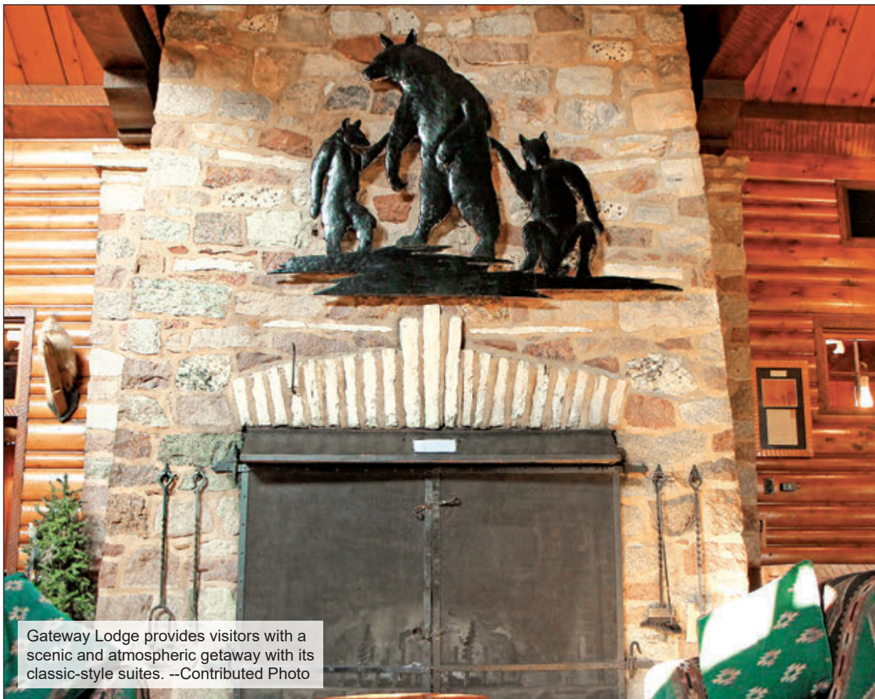
Gateway Lodge provides visitors with a scenic and atmospheric getaway with its classic-style suites.

For more information on Gateway Lodge, call 715-547-3321 or visit gateway-lodge.com