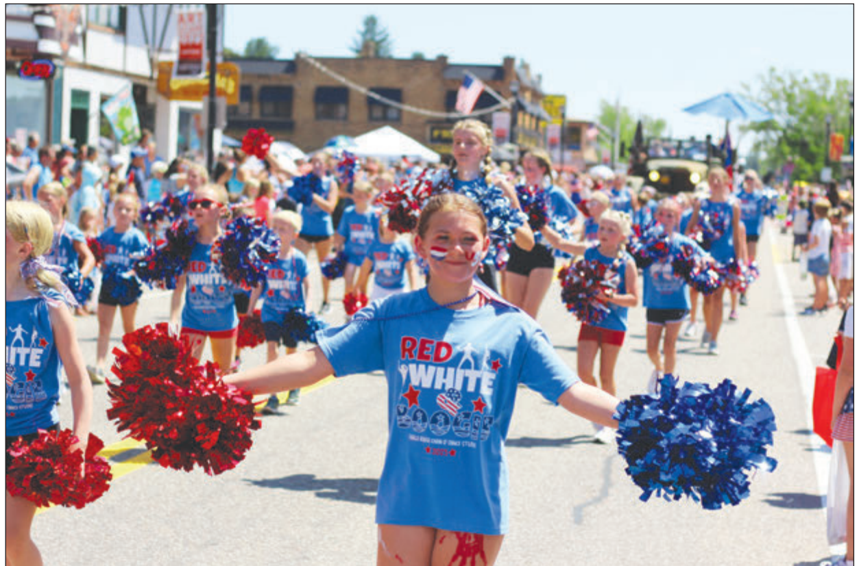
Numerous Fourth of July events are scheduled throughout the Eagle River Area, including parades, fireworks, markets, and "parties downtown."