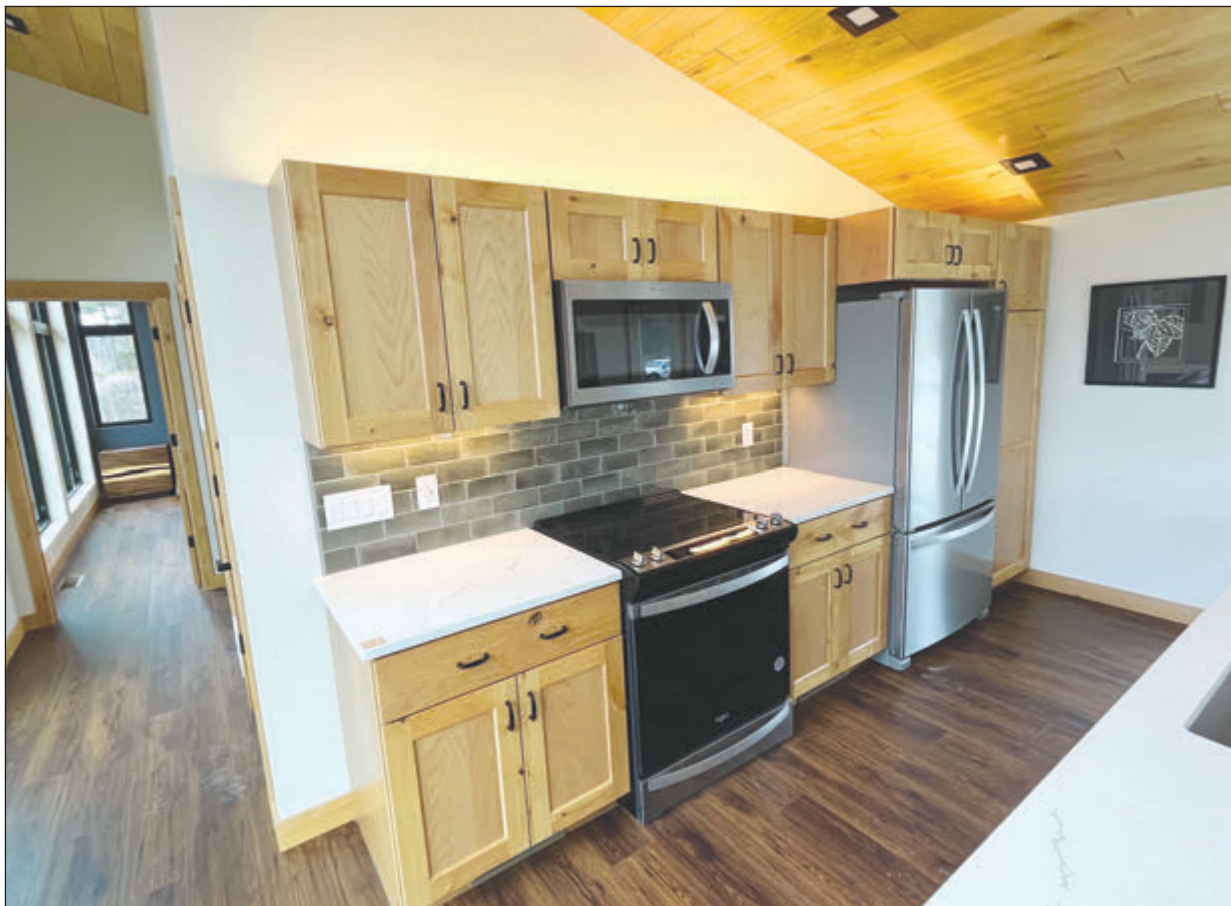
Cornerstone has seven different model homes available to tour for inspiration when building a new home.

"Internally, CornerStone has not only invested in improving our service team, we have also retrofitted and improved our manufacturing plants, along with