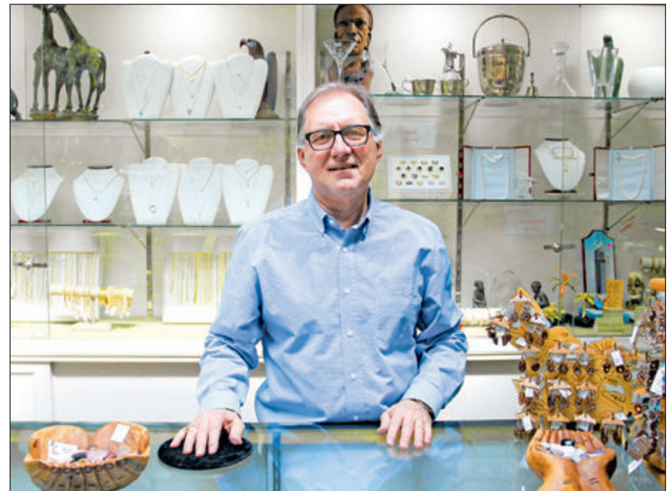
Lehner-Stephan Jewelers provides customers with a wide selection of unique, one-of-a-kind jewelry to choose from.