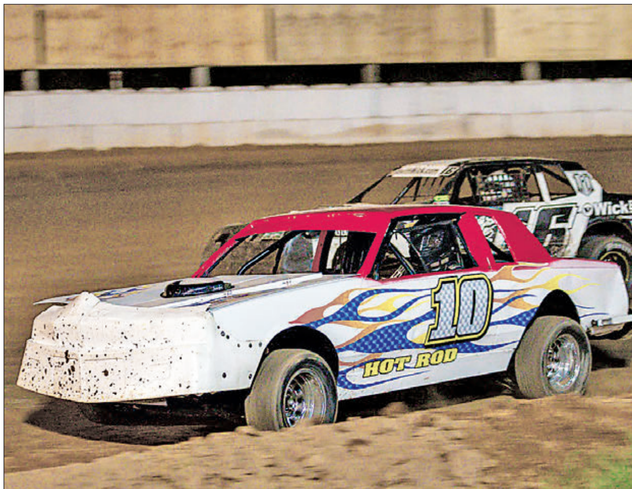
Visitors of the Eagle River Speedway can enjoy improvements made to the grandstands and the newly-added skywalk.

For more information, call the Eagle River Speedway at (715) 479-5208 or email zdroikseagleriver-speedway@gmail.com .