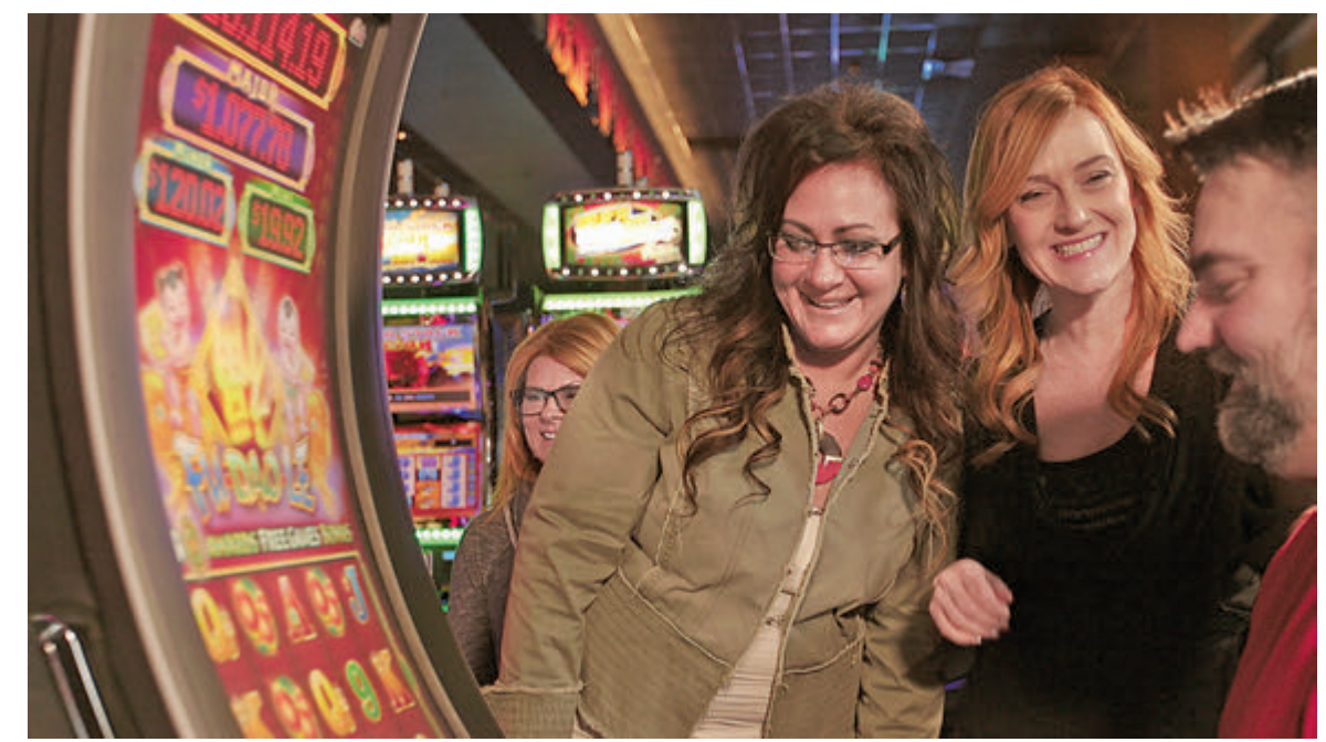
An assortment of events, food and fun can be found at Northern Waters Casino Resort.