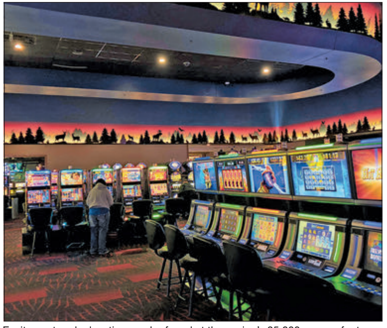
Excitement and relaxation can be found at the casino's 25,000-square-foot gaming floor with nearly 500 slot machines and table games.

Northern Waters Casino Resort will again be hosting a Big Buck Contest for deer hunters. From Nov. 15 through Nov. 30 hunters can weigh and register their buck at the LVD Plaza from 11 a.m. - 6 p.m. to be entered into the contest. Categories are the heaviest buck and the buck with the most points. Each category has a winning prize of $500. All participants who register their buck at the LVD Bar in the LVD Plaza in Watersmeet will receive $20 in Free Play to use at the casino. Winners will be determined and announced on Dec. 1 at 8 a.m. Hot Dog Daze is also something new this fall at the casino. Every Wednesday patrons can start earning points at 8 a.m., and after earning just 10 points they will be