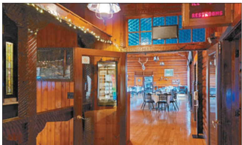
The historic and peaceful setting inside Gateway Lodge makes for a calm, easy-going atmosphere that is perfect for those looking to get away.

For more information, call 715-547-3321 or visit gateway-lodge.com