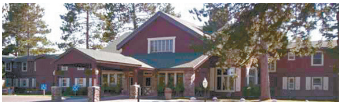
People have been visiting the Gateway Lodge for over 80 years for food, lodging and recreation.