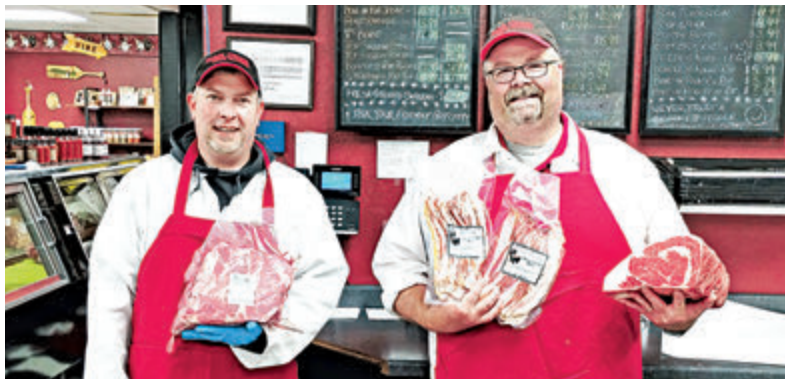
The selection of meats, cheeses, sausage, seafood and more at Prime Choice Meat Market in Eagle River are endless.

"Always be on the watch for new items we've added," continued