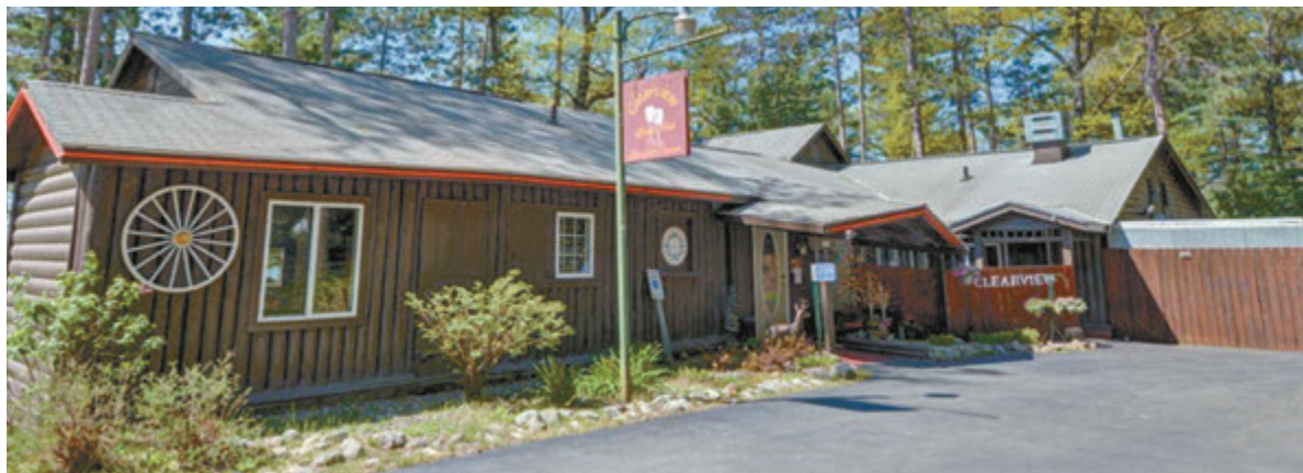
Clearview Supper Club is situated along the north shore of Big St. Germain Lake which makes for a most perfect and historic Wisconsin supper club setting.