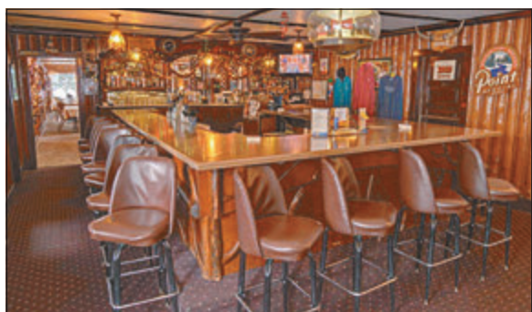
While it might seem like you're stepping back in time, the bar at Clearview Supper Club offers some of the most prominent and traditional drinks in the area.

For more information, call 715-542-3474, or see Clearview's full menu in the North Woods Trader Dining Guide at vcnewsreview.com .