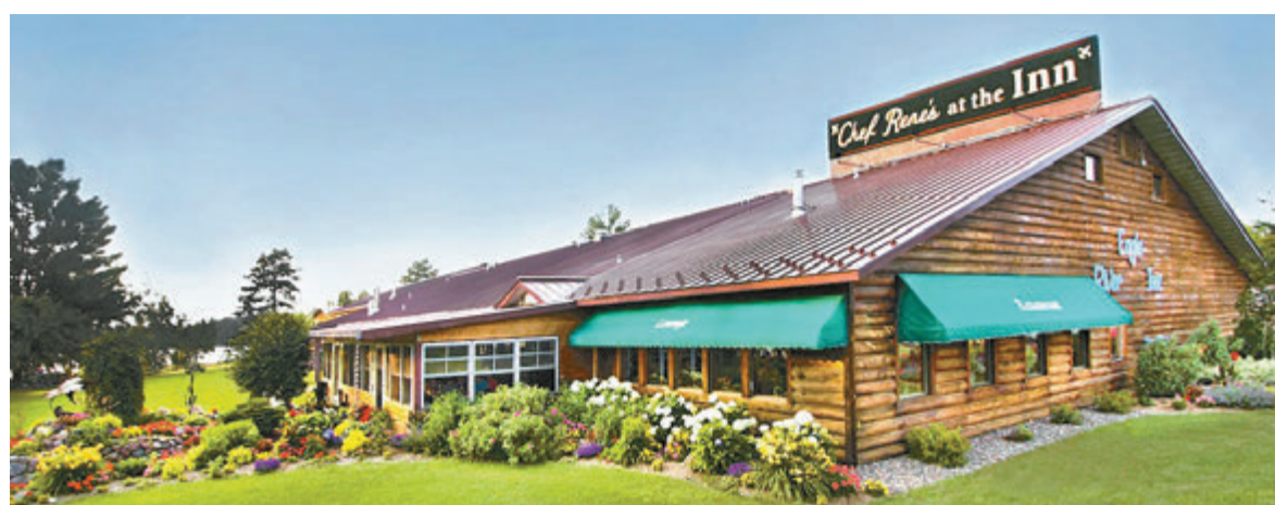
Chef Rene's At Eagle River is located conveniently along Hwy 70 West just outside of Eagle River.