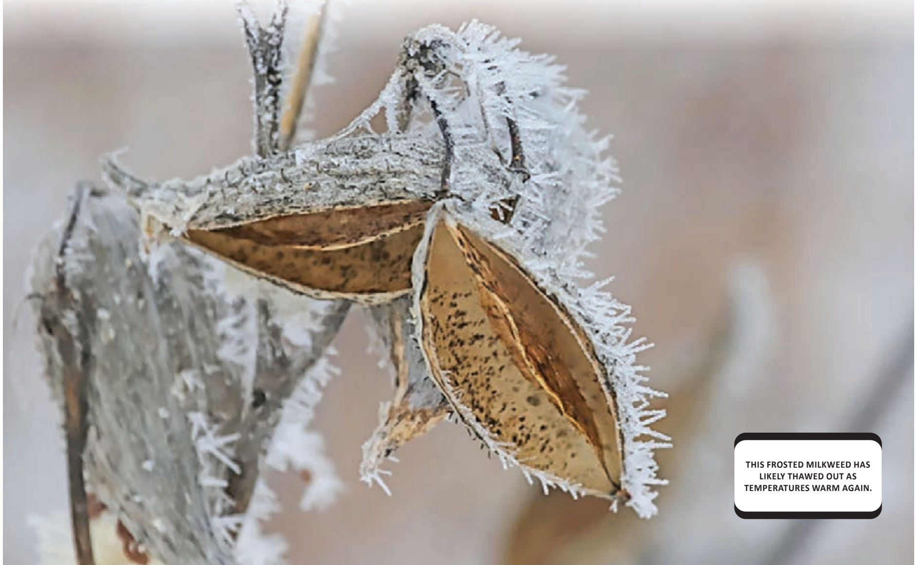
THIS FROSTED MILKWEED HAS LIKELY THAWED OUT AS TEMPERATURES WARM AGAIN.