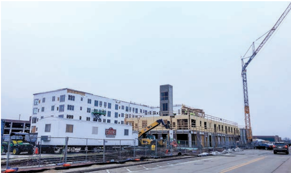
The Foundry on Third project, on the site of the former Wausau Center mall, as it looked Monday morning.

revealed that T. Wall was soliciting additional investors, signaling the finances weren't working out.