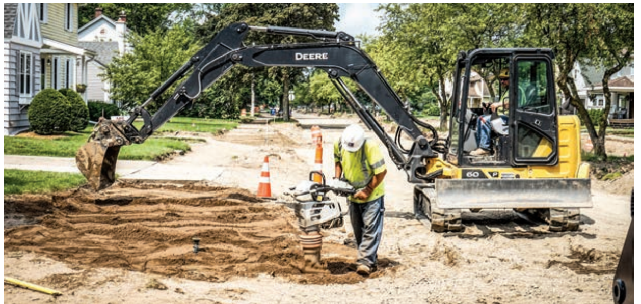
A construction worker works at Eau Claire Boulevard on the city's southeast side. Many residents on that street had their lead lines replaced as the boulevard was reconstructed.