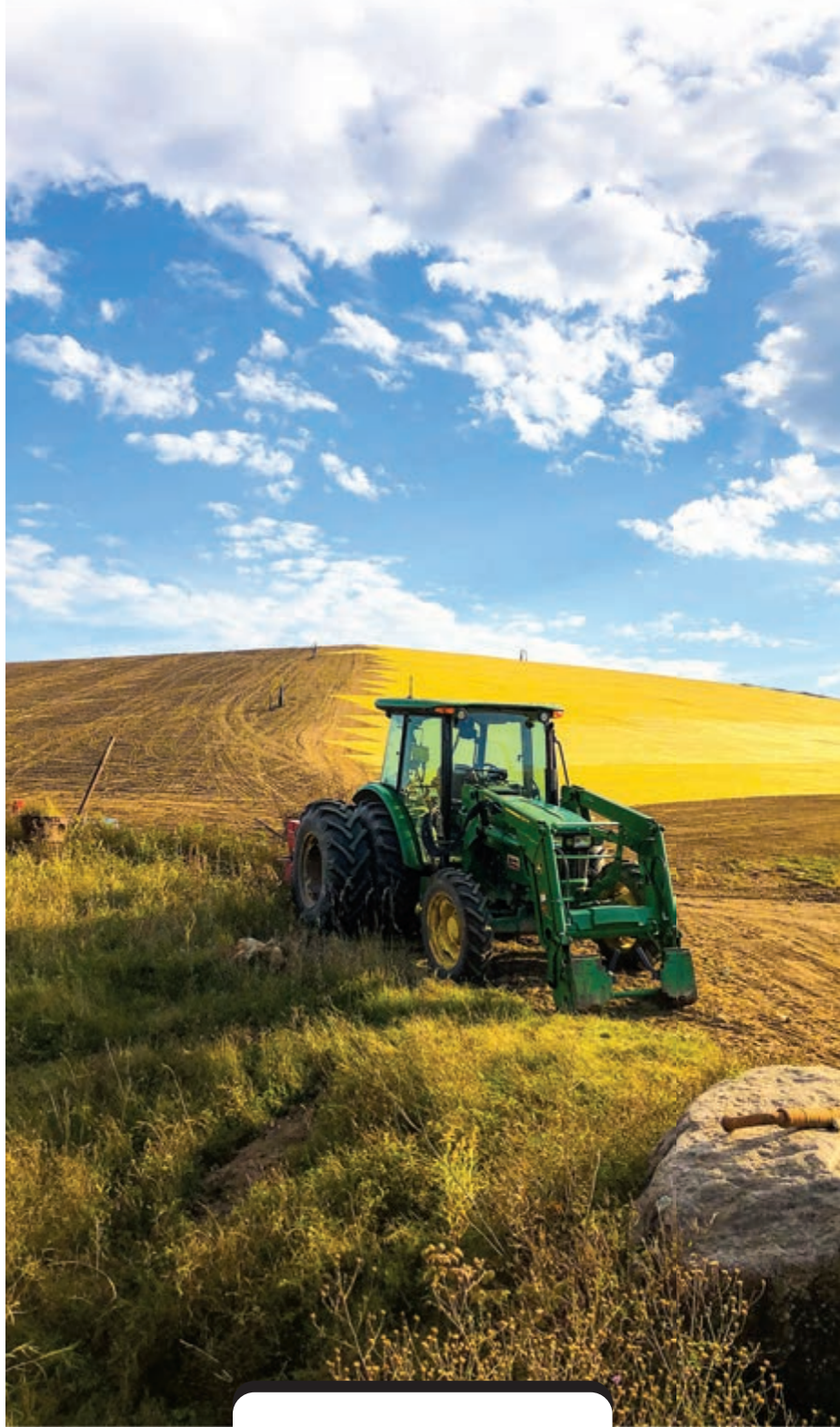
EVEN A LANDFILL CAN BE SCENIC.