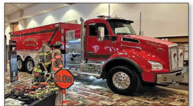
A new Tender for the Corning Fire Department was placed into service at the end of March 2024. This truck was purchased with funds obtained from a generous donation from a local family foundation and the remaining funds provided by the Town of Corning.