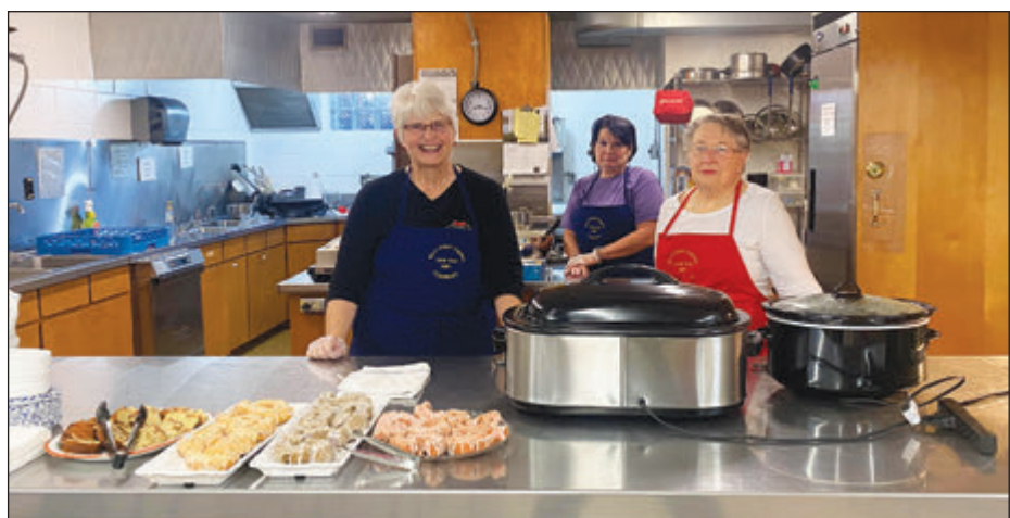
Volunteers serve up a hearty celebratory breakfast in Tomahawk. Submitted photo.