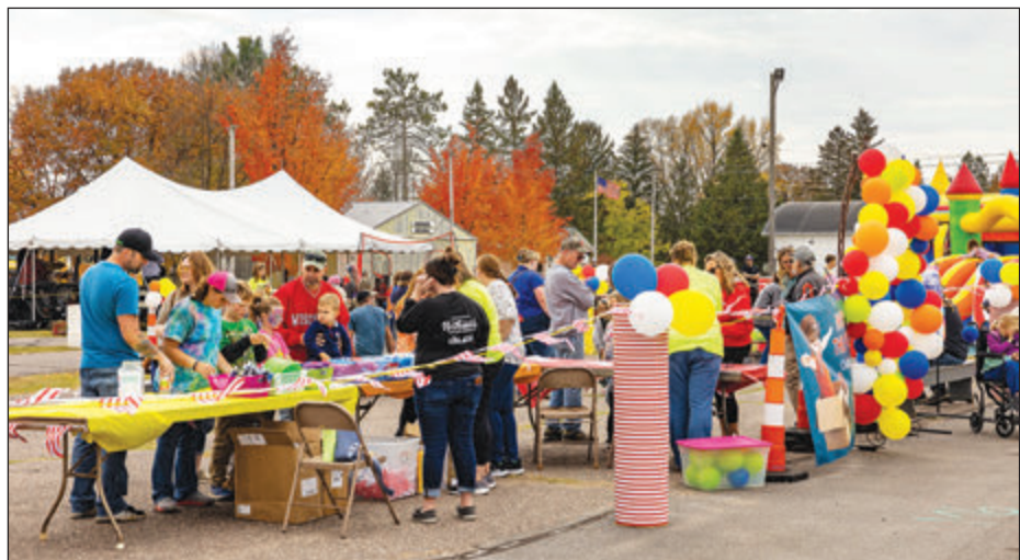
The St. John Old-fashioned Carnival was a great success at the Merrill Fairgrounds, and proceeds will be used to help build a new, expanded childcare facility in Merrill.