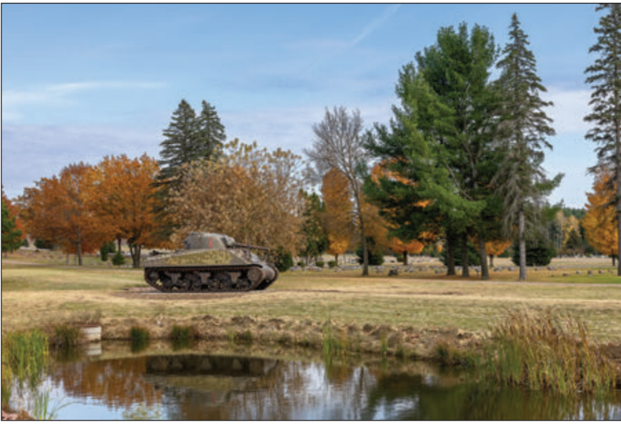
The Sherman Tank in its new home. Set against the fall foliage and reflected in the pond, it will be a great addition to the other military memorabilia featured at the Northwoods Veterans Post.