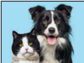
Someone's waiting for you... in classifieds

FRITZ BARN PAINTING rusty Roofs, Metal Buildings Free Est. 608-221-3510 920-821-6311