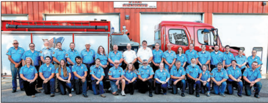
Hamburg Volunteer Fire Department.

Emergency: 911 • Non-Emergency: 715.443.3709