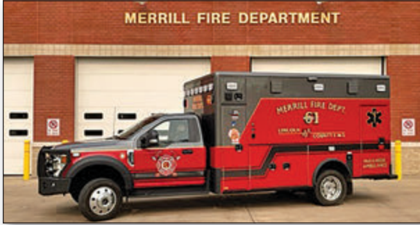
MFD took delivery of a new ambulance (Med-61) in March 2024.

Emergency: 911 • Non-Emergency: 715.536.2233