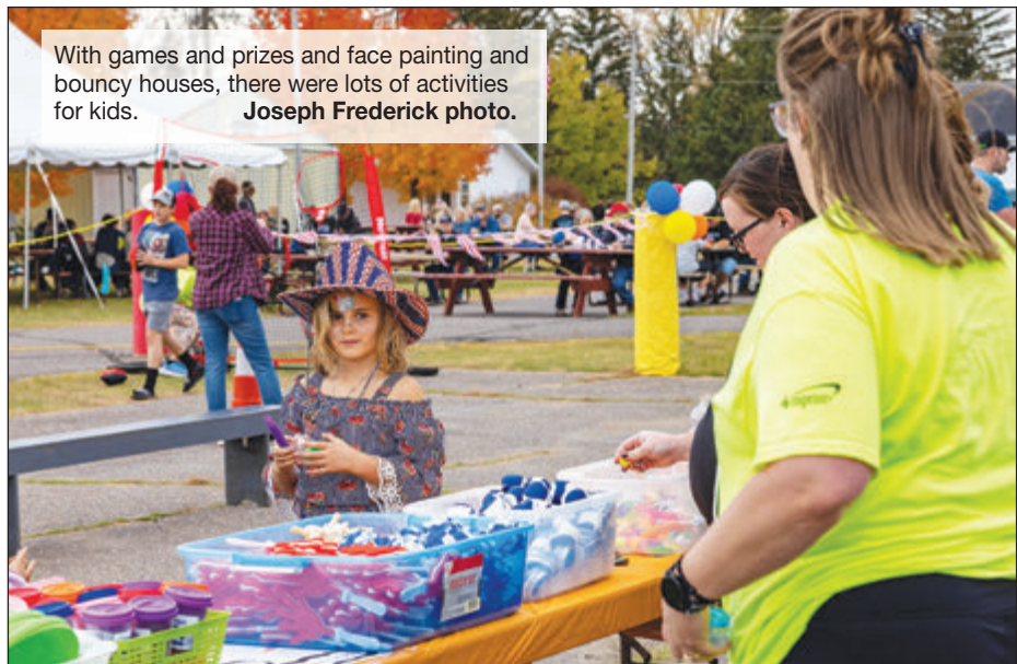
With games and prizes and face painting and bouncy houses, there were lots of activities for kids.