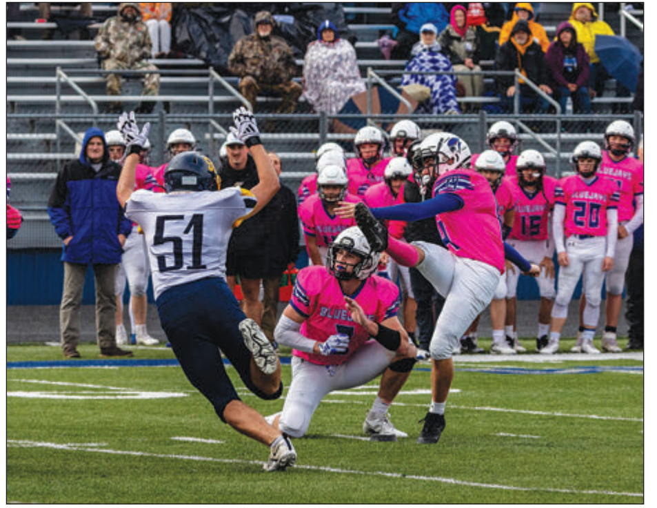
Now that's a kick!