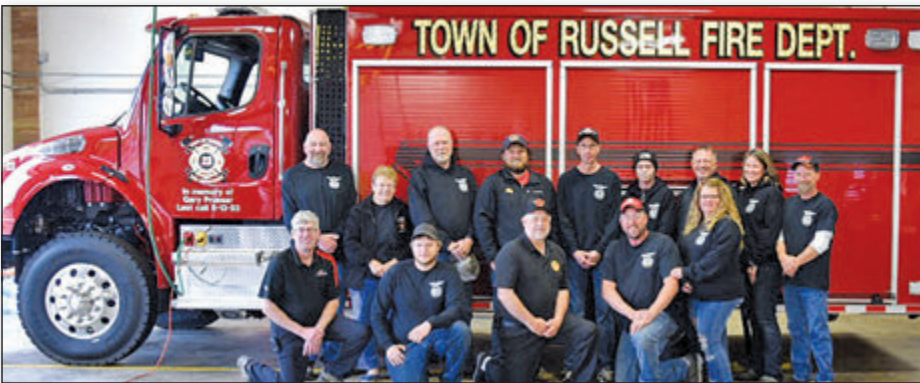
The Town of Russell Fire Department poses with their newest addition, Engine 4-23.

N5369 State Highway 17, Gleason, WI 54435