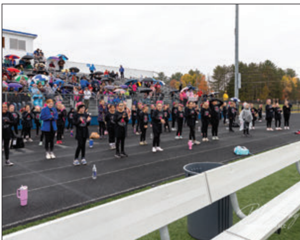
Young dancers and possible future Dance Team members helped cheer at the game, an annual Merrill tradition at one special game per year.