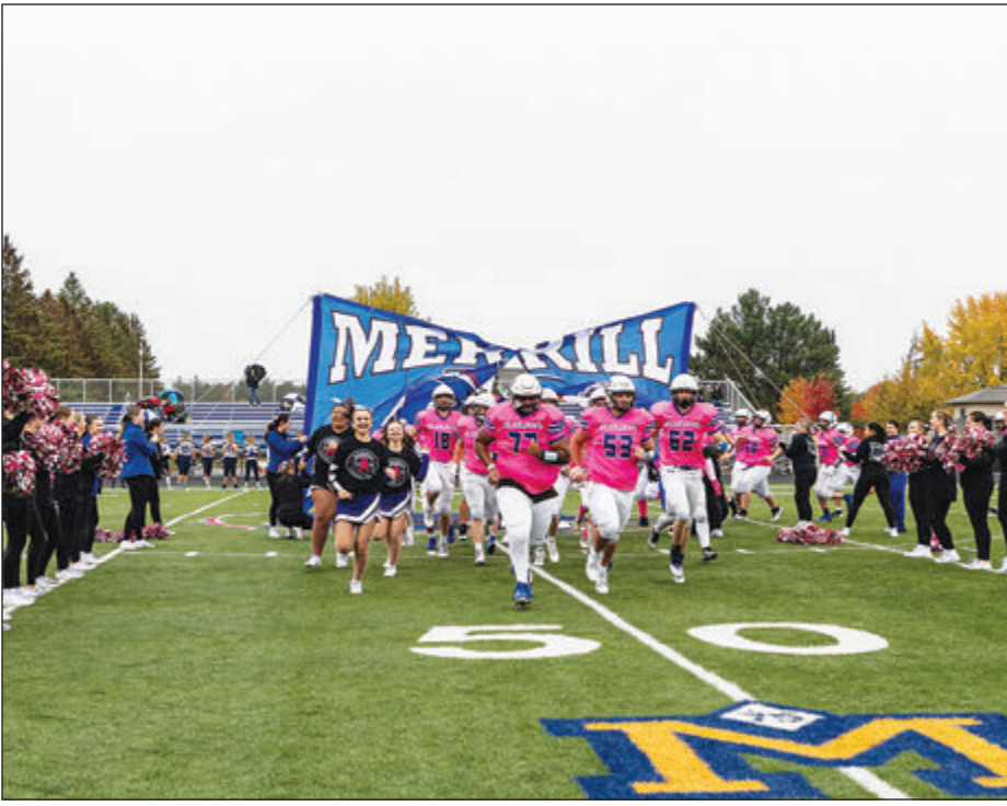
The Merrill Bluejays Varsity Football Players and Dance Team make an entrance, with the football players in special pink jerseys for breast cancer awareness.