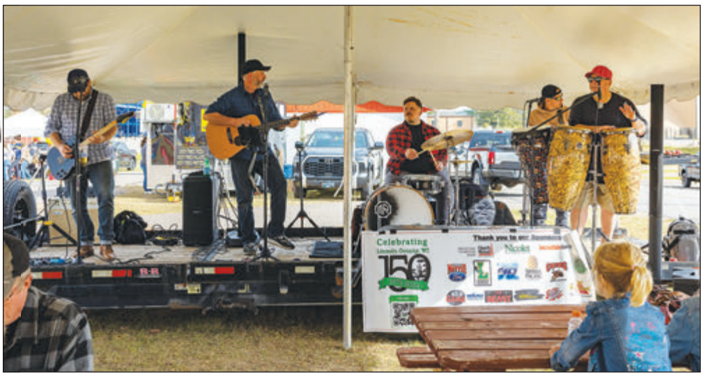
Live music under the tent helped set the stage for a celebration. And with food trucks on site, it was a great place to grab a beer, eat, relax, and enjoy everything Lincoln County's 150th birthday celebration in Merrill had to offer.