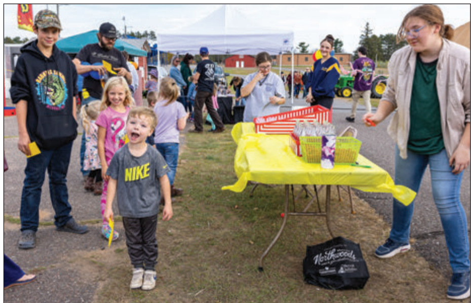
Lots of fun and excitement playing the carnival games.