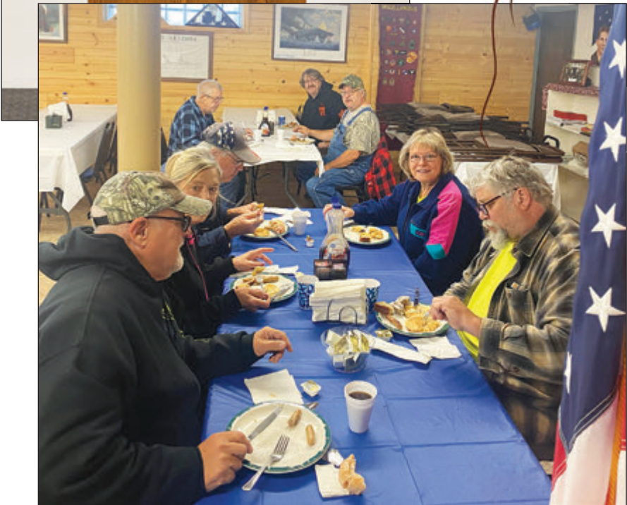
History loving diners enjoy breakfast in Tomahawk to kick off Lincoln County's Sesquicentennial Celebration! Submitted photo.