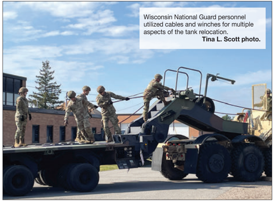
Wisconsin National Guard personnel utilized cables and winches for multiple aspects of the tank relocation.

Author of "Reflections" a new book now available on Amazon.