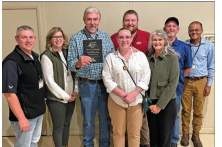
2024 Legacy Award: Weinbrenner Shoe Company for 88 years of serving Merrill.