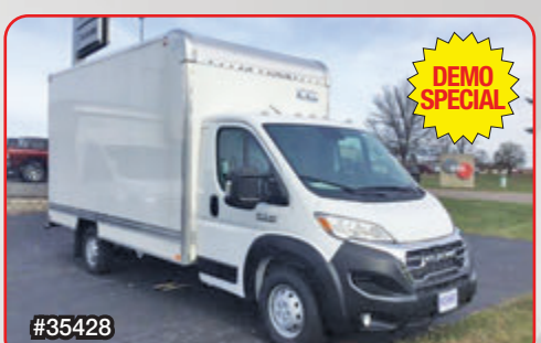
2023 Promaster Box Van Sale Price $45,360*