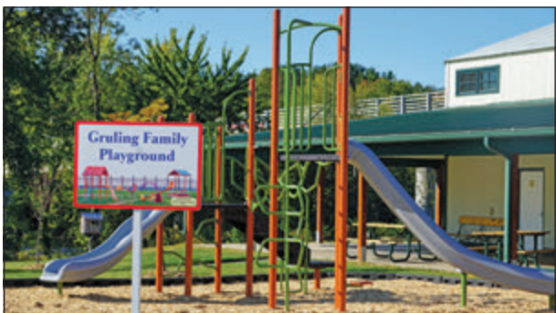
The new small playground provides little ones with something to do during events held at the Agra Pavilion and when families visit the River Bend Trail or Rotary Park in Merrill.

City representatives, the Gruling family, and the Merrill Area Chamber of Commerce all gathered for a celebratory ribbon cutting.