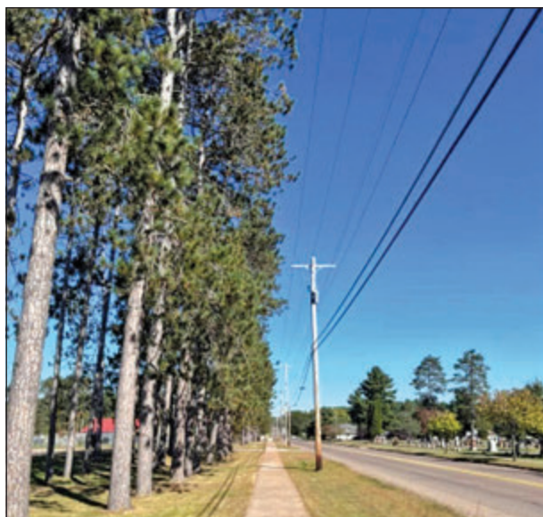
A view of the pine trees along the east side of the Merrill Fairgrounds taken from the sidewalk facing north. (The red roof of the Lincoln County Humane Society is just visible through the trees on the left.)