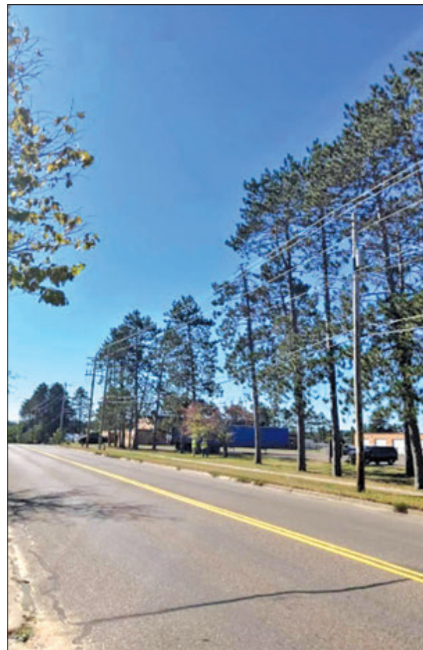
A view of the towering red pines along Memorial Dr., taken facing southwest. Just one of the trees falling or snapping off could take out the power lines.