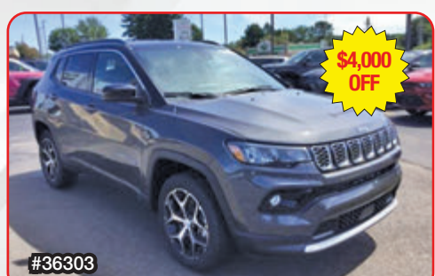
2024 Jeep Compass Limited Sale Price $31,935*