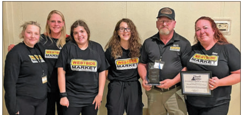
2024 Hometown Business of the Year: Westside Market and Easy Wash Laundromat.