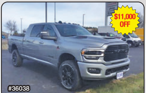
2024 RAM 2500 Laramie Mega Cab Sale Price $79,590*

*Plus tax, title, license, and service fees.