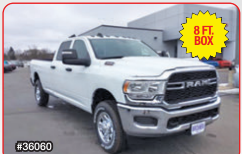
2024 RAM 3500 Tradesman Crew Cab Sale Price $49,860*