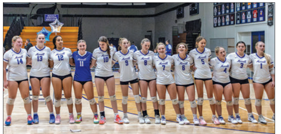
The entire team sings Hail to the Blue with the crowd after the game.