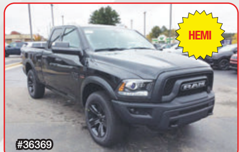
2024 RAM 1500 Quad Cab Sale Price $49,995*