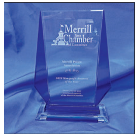
2024 Non-profit Business of the Year: Merrill Police Association.