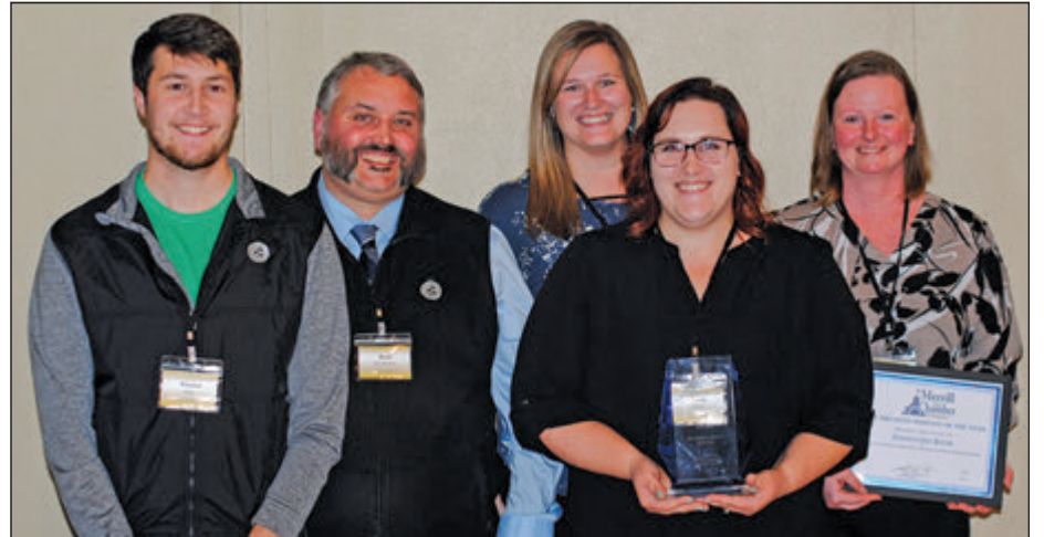
2024 Mid-Size Business of the Year: Associated Bank.

For more information about the Merrill Chamber of Commerce, go to merrillchamber.org or call 715.536.9474.