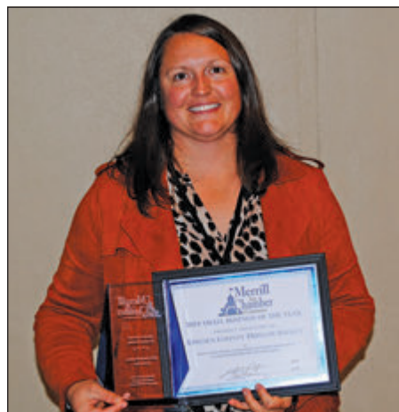
2024 Small Business of the Year: Lincoln County Humane Society.