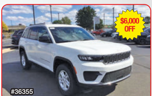
2024 Jeep Grand Cherokee Laredo Sale Price $38,620*