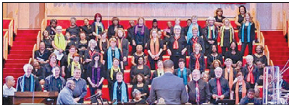
The Gossellers at Trinity UCC in Chicago.

Members of The Gossellers come together from across the state of Wisconsin to spread the good news through music and to build relationships between churches and communities. The Wisconsin Gossellers is a