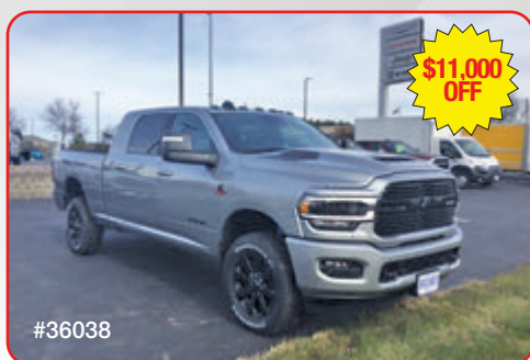
2024 RAM 2500 MEGA Cab