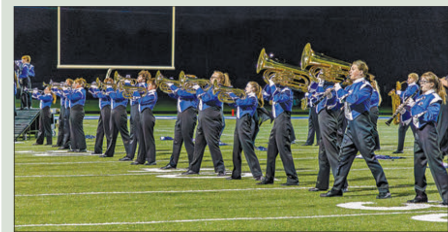
The Merrill Marching Jays put on a performance at the Merrill-Mosinee football game.

Box Score Merrill @ DC Everest DC Everest won in 3 sets: 12-25, 16-25, 22-25