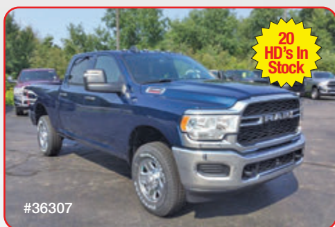
2024 RAM 2500 Crew Cab