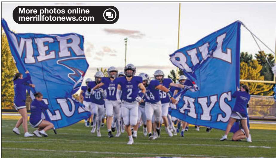
The Merrill Bluejays Varsity Football Team makes their entrance onto the field.