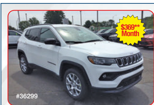
2024 Jeep Compass Latitude LUX