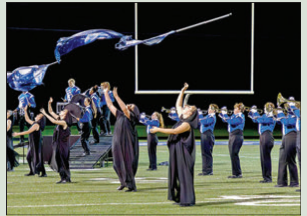
Flags twirl, swirl, and spin, even flying through the air during the color guard and band performance.