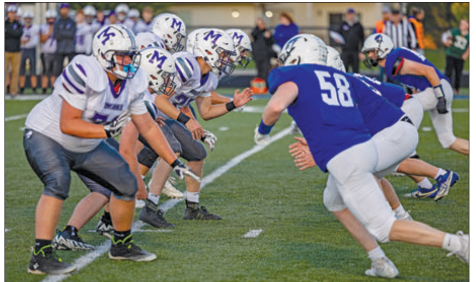
Mosinee vs. Merrill: Game on!