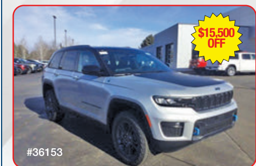
2024 Jeep Grand Cherokee 4xe