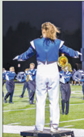
Directing the band.