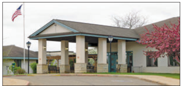
Pine Crest Nursing Home in Merrill.