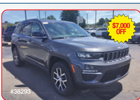
2024 Jeep Grand Cherokee Limited