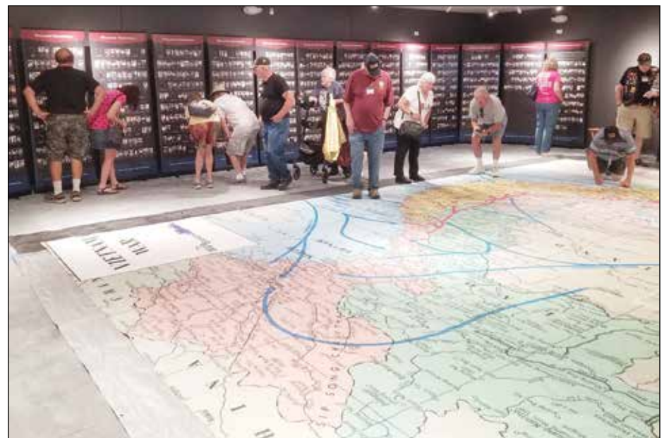
The Highground's Big Map was available for veterans to sign as veterans and visitors view the "Wisconsin Remembers: A Face for Every Name" banner exhibit.