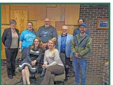
Graduating Class of Spring 2024 ETP Program