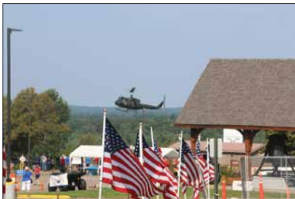
Veterans, their significant others and visitors look to the sky as the UH-1H Huey descends for their landing near the Meditation Garden.