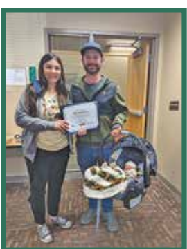
Northwoods Home Assurance LLC

To learn more about the Entrepreneurship Training Course, plan to attend the free Exploring Entrepreneurship Workshops scheduled in February: Tuesday, September 17, 2024 @ 5:30 pm Grant Funding for Langlade County Residents is made possible by The Suick Family Foundation!!