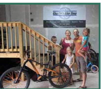
Charlie's Bike Shop

Funded in part through a cooperative agreement with the U.S. Small Business Administration. Reasonable accommodations for persons with disabilities will be made if requested at least two weeks in advance. Contact the SBDC at UW-Stevens Point at 715-346-3838.