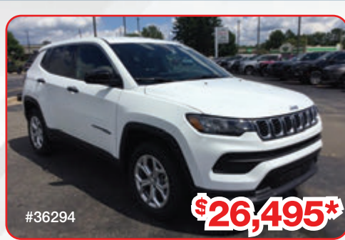
2024 Jeep Compass Sport 4x4 • 32 MPG HWY

In Need of Custom Plaining, Sanding, or siding? Also, for sale car siding bring sample we can match it. Reasonable Delivery & Installation available! RIVERS EDGE TRIMMING & MOULDINGS. Call 715-613-8701 Mention PDS and receive a 2% discount.