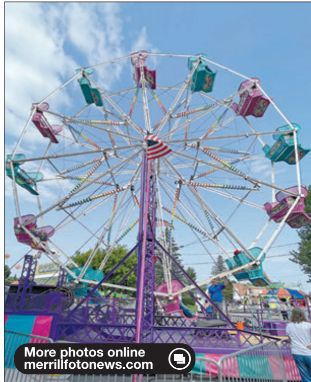
Billed as the Athens World Fair, this year's fair was the 119th Athens Fair held in Athens, Wis. - A four day event of activities, music, food, rides, and exhibits.