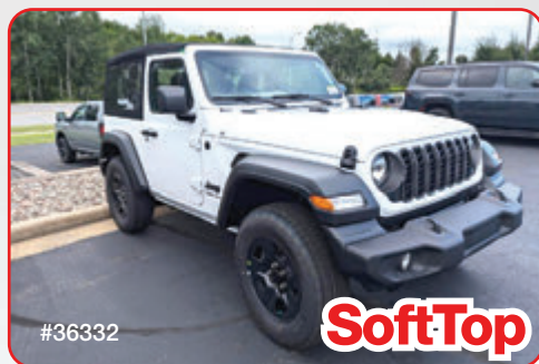
2024 Jeep Wrangler Sport Sale Price $29,890*