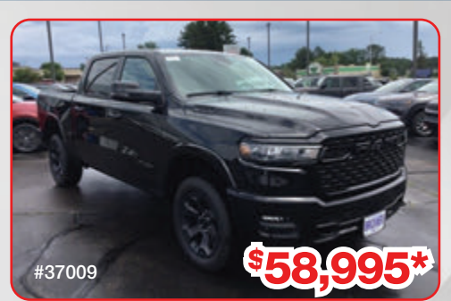
2025 RAM 1500 Crew Cab • New 420hp Hurricane Engine