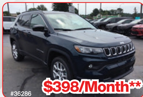
2024 Jeep Compass Latitude Lux 4x4 Sale Price $29,085**