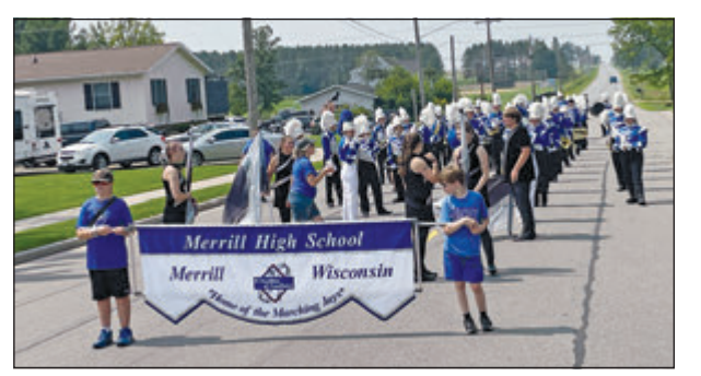
The Athens Fair Parade is a highlight of the four-day fair each year. Here, the Merrill High School Marching Jays get organized at the edge of town, preparing to take part in the annual parade. Nothing like having more Bluejays in town! [Both Athens High School and Merrill High School have the bluejay as their mascot.]