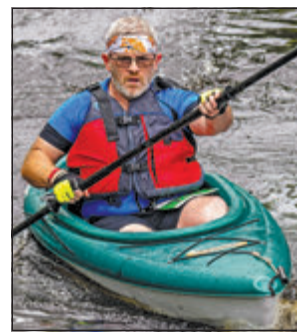
A racer paddles his kayak during the first leg of the paddling triathlon on the Prairie River.