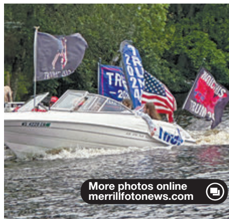
More photos online merrillfotonews.com