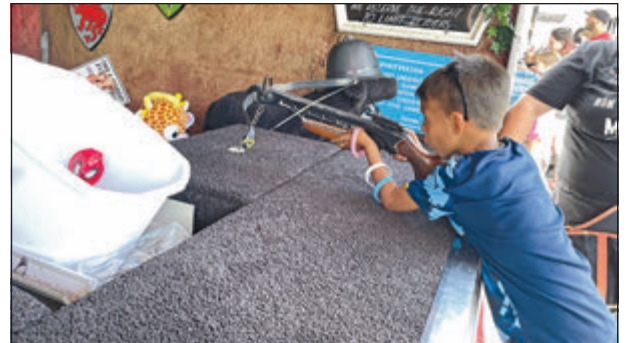
Running from Aug. 15-18, fair attendees could tour the animal barns, enjoy carnival rides, or play games like this five-year-old who was taking aim at a target.