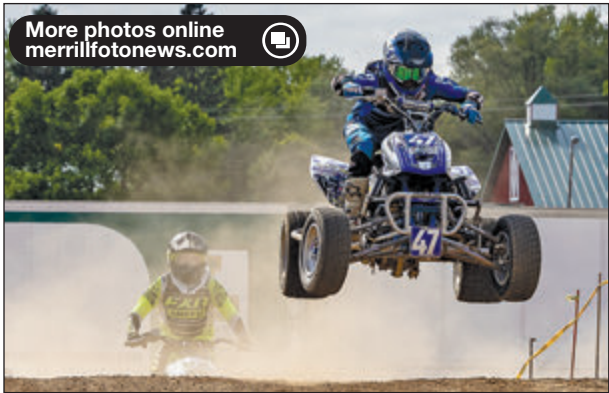
Now that's a jump!