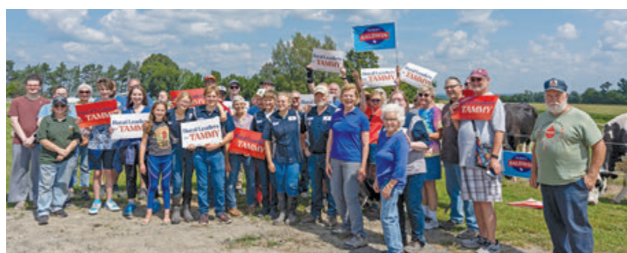
Lincoln County supporters join Tammy Baldwin for her "Rural Leaders for Tammy" coalition and Rural Wisconsin Tour launch at Breitenmoser Family Farms.