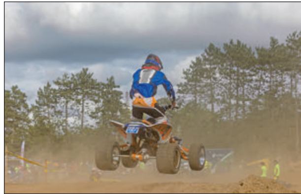
Kicking up dust!