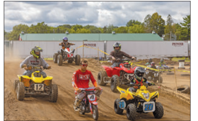
Racers on a variety of dirt racing machines take a lap.