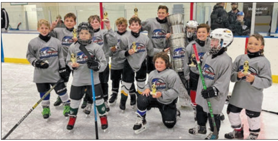
Squirt Division (8-10 years old) Youth Summer Classic Champions.