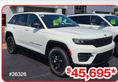
2024 Jeep Grand Cherokee L Limited • 6200 lb Towing Package