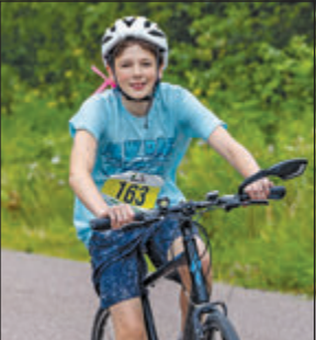
A bicyclist competes during the cycling portion of the Black Squirrel Scurry triathlon.

The Black Squirrel Scurry is a fun triathlon event for charity, considered a "paddling triathlon." The race