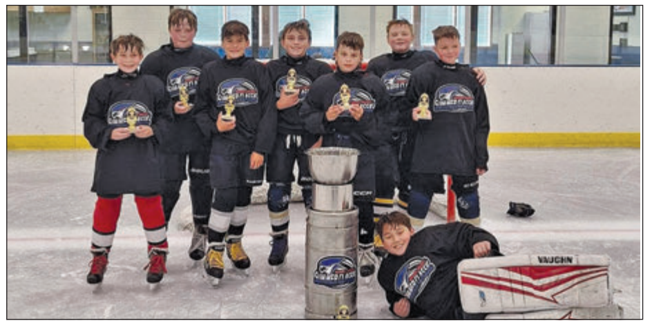
Peewee Division (11-12 years old) Youth Summer Classic Champions.