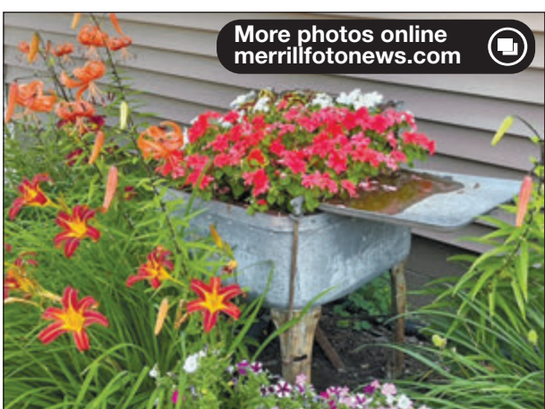
Perennial lilies surround a vintage washtub filled with colorful plantings.

a.m. to get the track ready and stay until the entire day is finished. The track was ready for practice around 12:30 p.m. and the races were scheduled to start at 2:30 p.m. More photos are available on our website and also at the Northern Wisconsin Dirt Track Racing Facebook page.