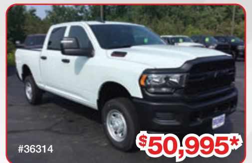
2024 RAM 2500 Crew Cab • 6.4 L HEMI V-8

*Plus tax, title, license and service fee. ** 39 month/39,000 mile lease to qualified credit.