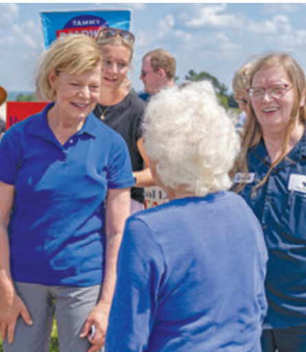
Tammy Baldwin chats with Lincoln County supporters at her "Rural Leaders for Tammy" coalition and Rural Wisconsin Tour launch at Breitenmoser Family Farms.

"Wisconsin is a proud rural state known for its world-class agriculture and the best workers in the world," Baldwin said. "I know our farmers and rural communities always have our backs, which is why I promise I'm going to have their backs in Washington. Because when our rural communities thrive, Wisconsin thrives."