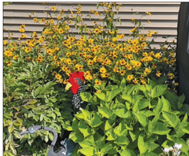
Metal birds peek out from beneath a variety of flowering plants.