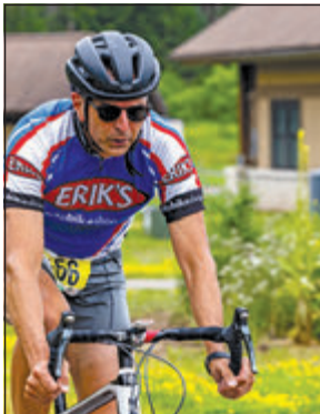
The bicycling portion of the race took racers through and past Council Grounds State Park.

includes 2 miles paddling kayaks on the Prairie River, a 17.5 mile bike ride featuring the River Bend Trail out to the countryside of Lincoln County, and a 5k trail run through the Merrill Area Rec Complex and Council Grounds State Park.