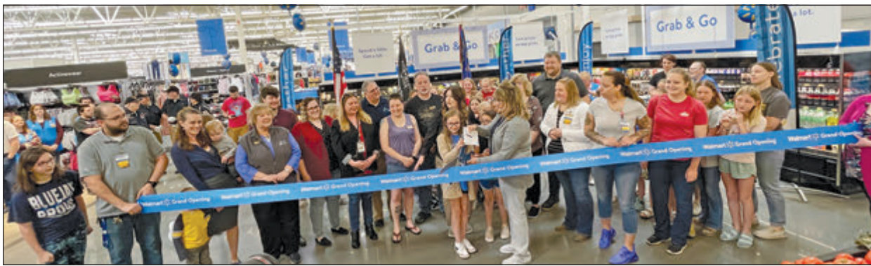
A ribbon cutting at the grand reopening of Walmart after their spring 2024 renovation incorporated a crowd.