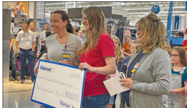
Representatives from the Lincoln County Humane Society accept a $1,000 donation from Walmart.