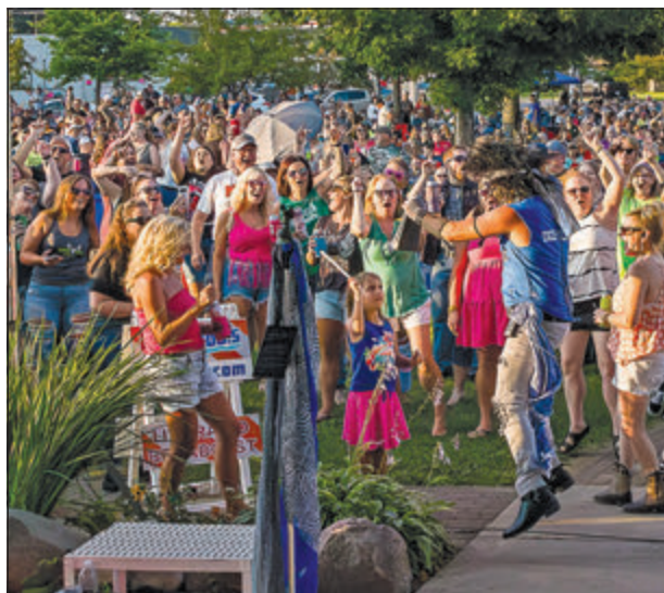
Band members get out into the crowd!