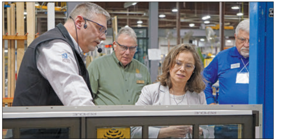
Ball explains the features of one of Sierra Pacific's windows during the tour.