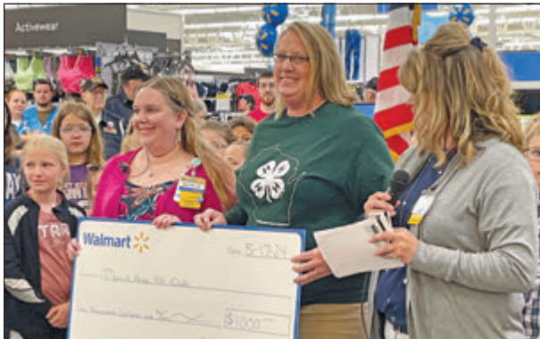
Representatives from Merrill area 4-H clubs accept a $1,000 donation from Walmart.