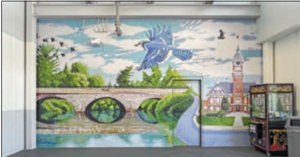
A beautiful mural representing some of Merrill's landmarks was painted in the entrance to the Merrill Walmart as a part of their spring 2024 renovation project.

To submit news items for possible publication in the Business News & Tidbits column, submit short releases (no longer than 200 words) to tscott@mmlocal.com.