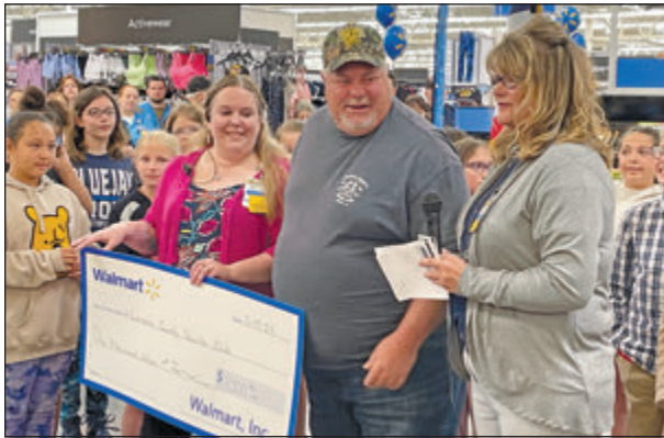
Representatives from the Lincoln County Sports Club prepare to accept a $1,000 donation from Walmart.