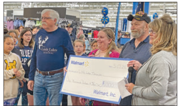
Representatives from Little Lakes Memories accept a $1,000 donation from Walmart.