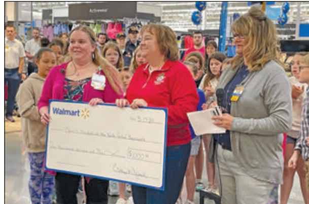
The Merrill area Boy Scouts also received a $1,000 donation from Walmart.