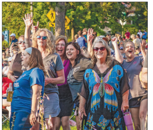
Merrill's girls gone wild for the Glam Band ...