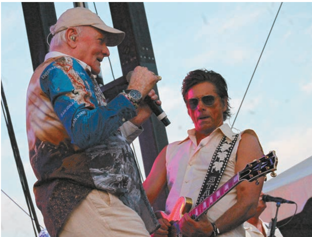
▲ The Beach Boys appeared on stage at Capital Credit Union Park in Green Bay on July 11 with guests, Dave Mason and John Stamos, for the 79-stop The Beach Boys' Endless Summer Gold tour.

Christmas time, we would literally rehearse our Christmas songs in the living room, and then the aunts and uncles and all the kids and friends would literally go around our neighborhood and Christmas carol. So it was always about music with the Wilsons and Loves."