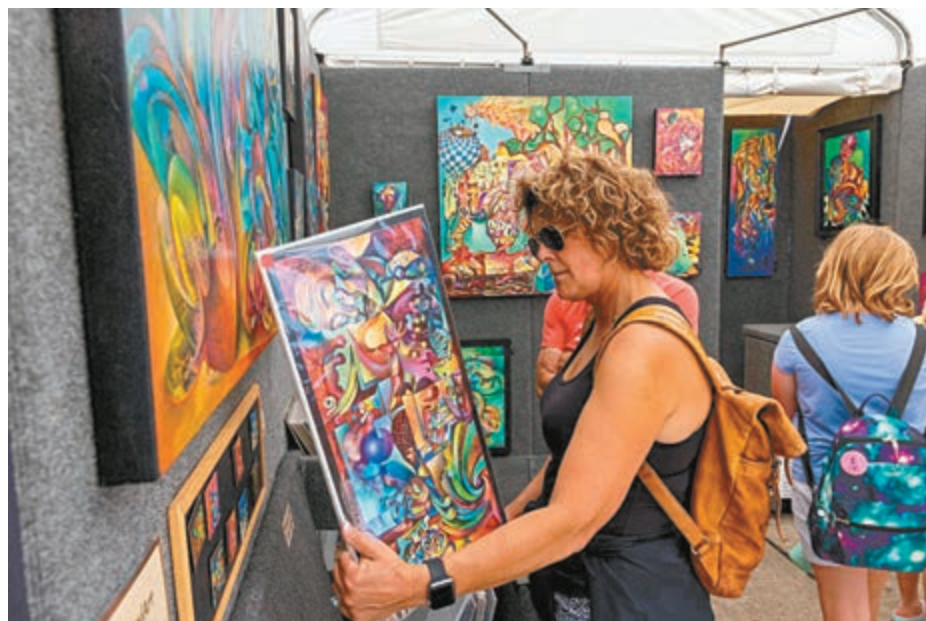
▲ The Art Fair, presented by TDS Fiber, will feature over 100 local, regional, and national artists showcasing their artwork and offering attendees a unique opportunity to explore and purchase their creations. From paintings to sculptures, photography to mixed media, the artists' creativity and talent are sure to captivate visitors. Submitted photos