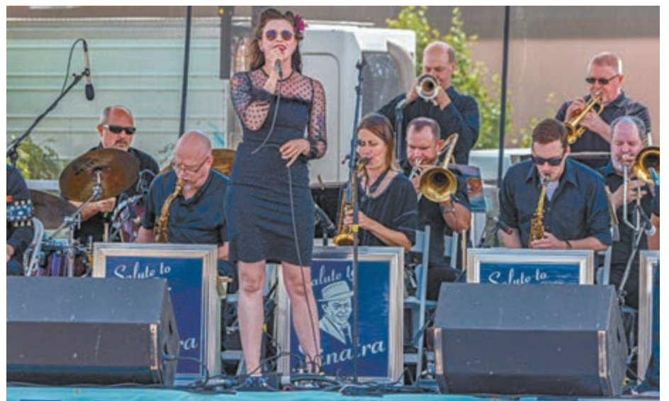
▲ ArtFest Green Bay will feature an impressive lineup of musicians and performers across three stages. The Main Stage acts include headliners Hip Pocket, and The Salute to Sinatra Big Band. The Side Stage, sponsored by Capital Credit Union, will feature a variety of talented local musicians and the Ho-Chunk Performing Arts Stage will feature music, dance, storytelling, theatre and will showcase a Ho-Chunk Drum and Dance Troupe.