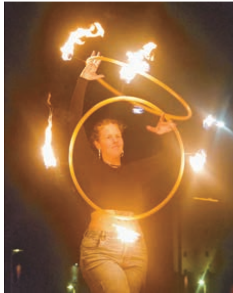
▲ As the sun started to set on July 12, the International Jugglers Association (IJA) began to set the stage for Fire Night, an annual tradition of the organization held this year at Leicht Memorial Park.