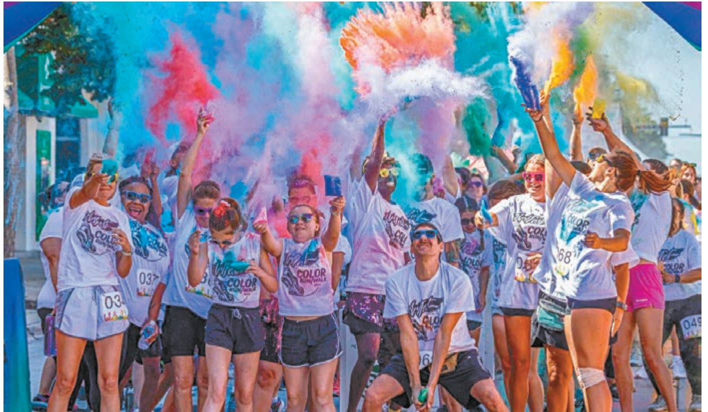
▲ The ArtFest Color Run will take place on Saturday, July 20, at 9:30 a.m. in front of Hotel Northland. Participants will embark on a 2.5-mile route through the vibrant streets of Downtown and along the Fox River. Runners and walkers will be showered in a rainbow of powdered colors. Interested individuals are encouraged to register now.

For more information and a schedule of events, visit downtowngreenbay.com/artfest . CP