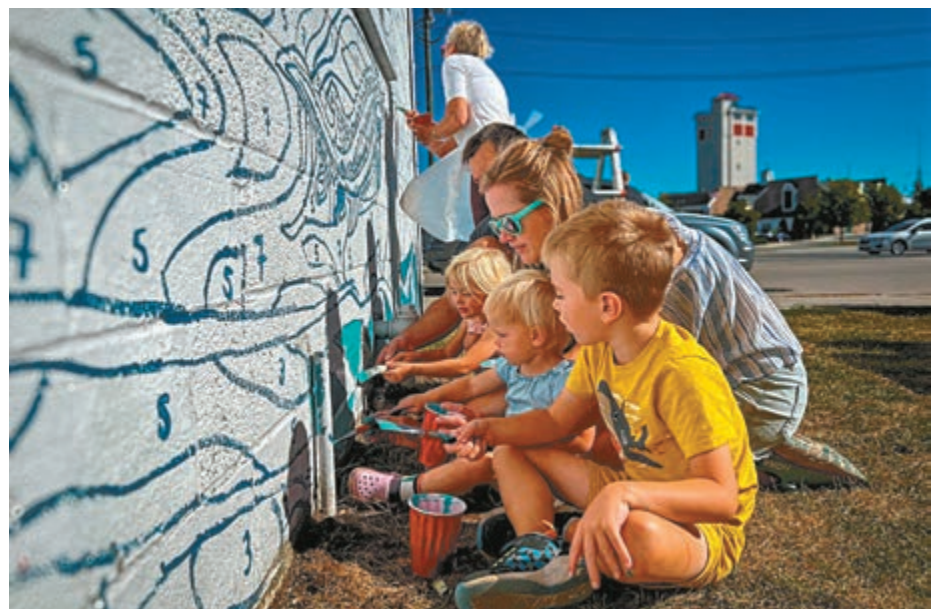
▲ Each year ArtFest will add to the vibrancy of Downtown with a Community Art Project. This year, a large paint-by-number mural will honor the Ho-Chunk Nation, featuring the river and feathers that represent the 12 Ho-Chunk Clans. The mural will be under the Dousman Street Bridge, and painting will begin at 9 a.m. on Saturday, July 20, and continue through the weekend.