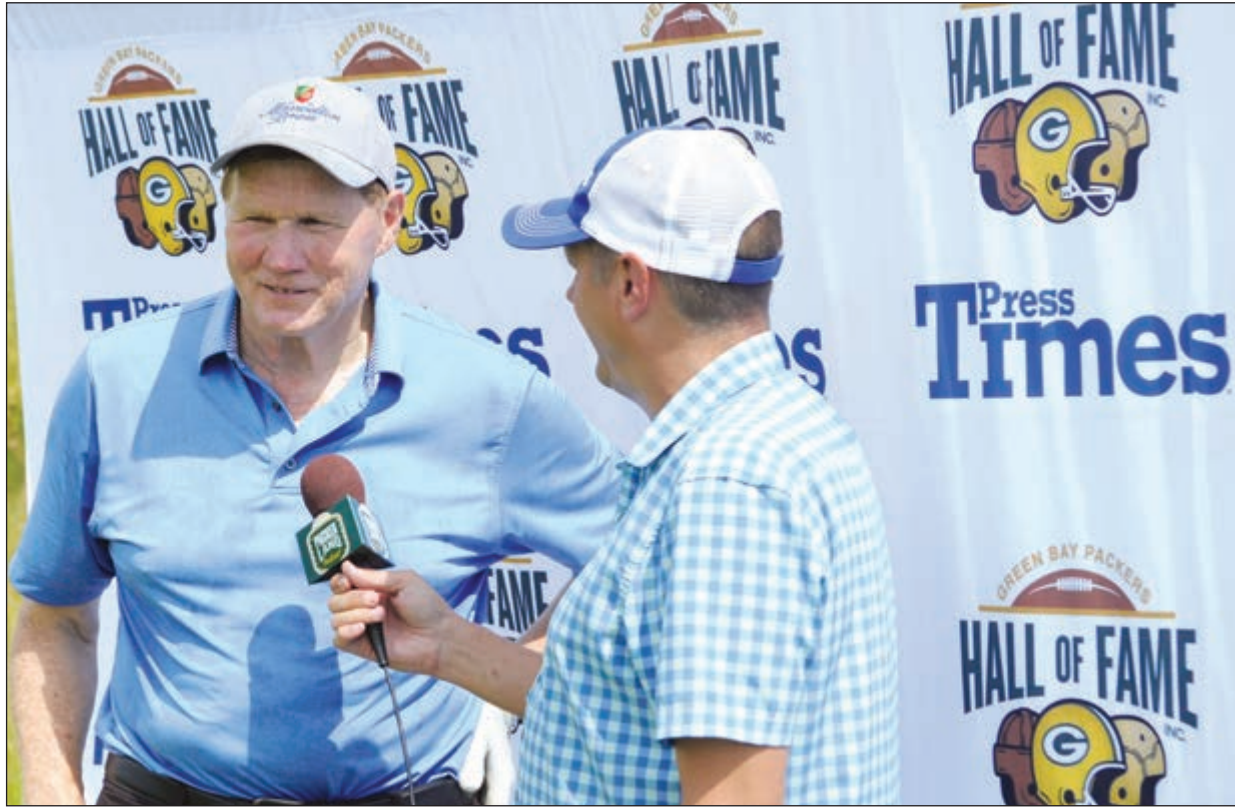
Green Bay Packers President/CEO Mark Murphy took to the course in part of the 2024 HOF Golf Classic. Murphy said he is looking forward to his last year as an active member of the Packers organization.

As he prepares to pass the baton, Murphy assured Packers fans that they will be in good hands following