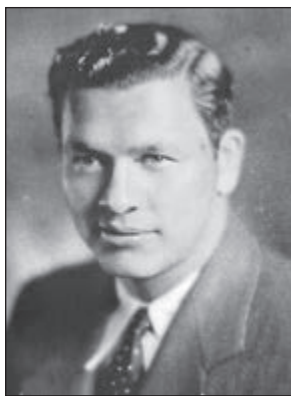
Curly Lambeau poses for a 1931 promotional photo.

In the 26 league seasons that Lambeau ran Rockne's system, his left halfback, right halfback and quarter-