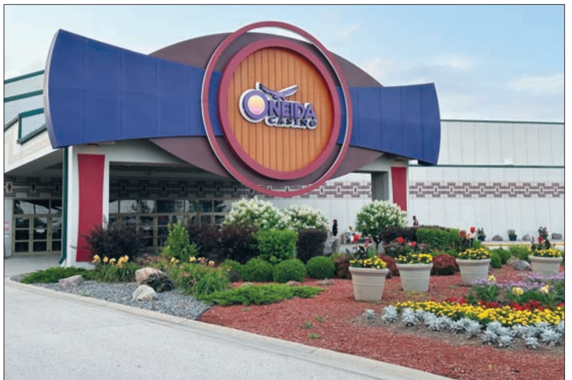
What began as a small bingo operation held in a local gymnasium has grown into a multi-location gaming entertainment business that includes slots, table games, poker, sports betting, dining and hotel.

Specializing in Alzheimer's & Dementia Care, as well as Assisted Living