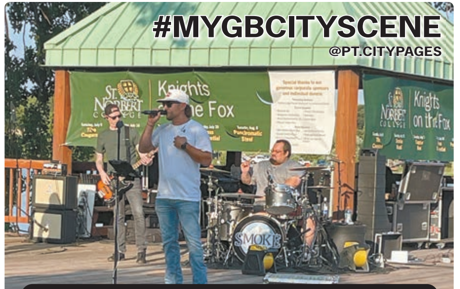
ABOVE: SMOKE ROAD PERFORMED LAST TUESDAY, JULY 16, AT ST. NORBERT’S KNIGHTS ON THE FOX CONCERT SERIES. BELOW: DANI MAUS PERFORMED LAST WEEK AT CAPITAL CREDIT UNION PARK AHEAD OF THE BEACH BOYS CONCERT.

“The Curious Planet” furthers Eliasson’s ambition to promote a greater awareness of the way we engage with and interpret the world. CP