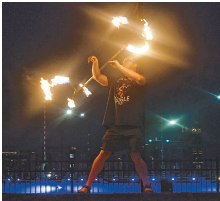
▲ Once the sun had gone down, the only light to be seen in Leicht Park was the orange, red and blue hues cast by the flames as the jugglers began their routines.

There was no end to the excitement and tricks the participants had, spinning their props around their bodies, holding them in