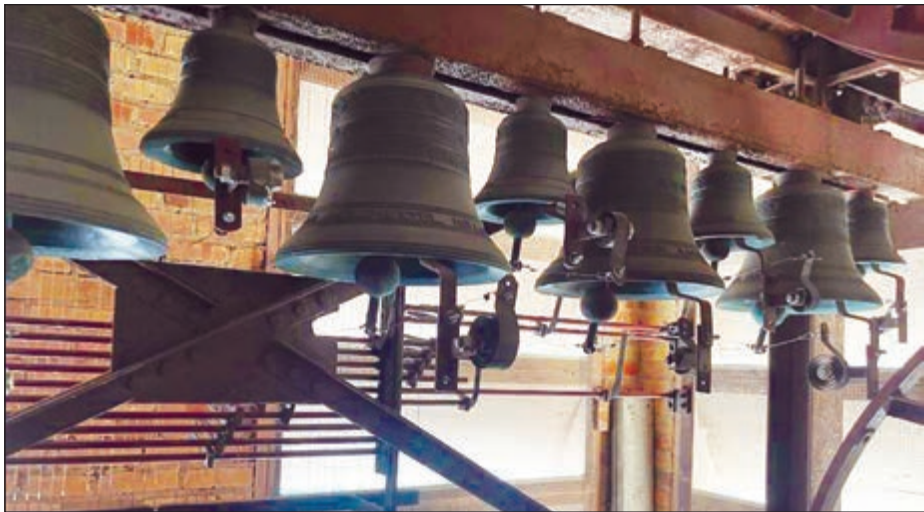
The bells are inside of the tallest part of the church, with 47 bells in total. Each of the bells gives off their own unique sound to create the songs.