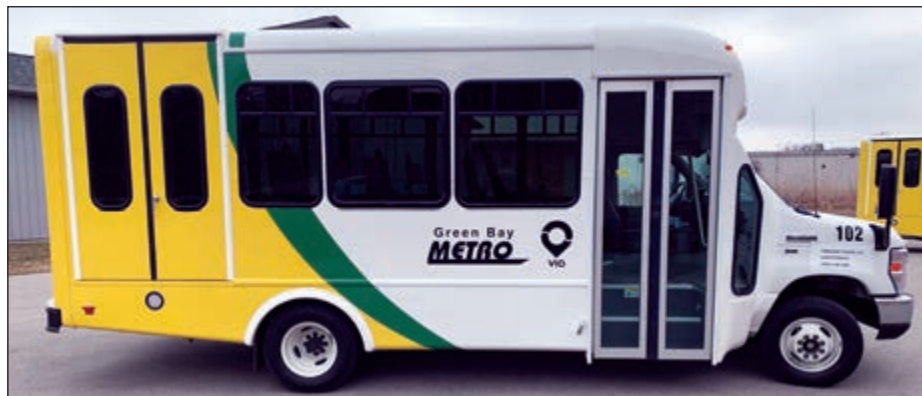
The city of Green Bay Transit System will receive $3,112,663 to replace diesel-powered buses with battery electric buses and charging equipment, improving safety and decreasing greenhouse gas emissions.

"High-quality public transportation helps re-