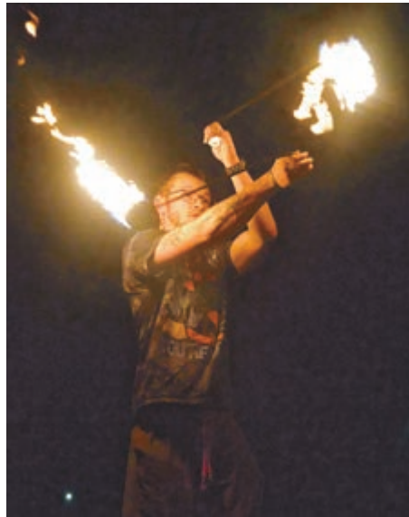
▲ Like a normal juggling routine, participants in Friday night's event came prepared with equipment including hula hoops, fans and more, but with the added element and challenge of fire.

their mouths and even juggling with their feet.