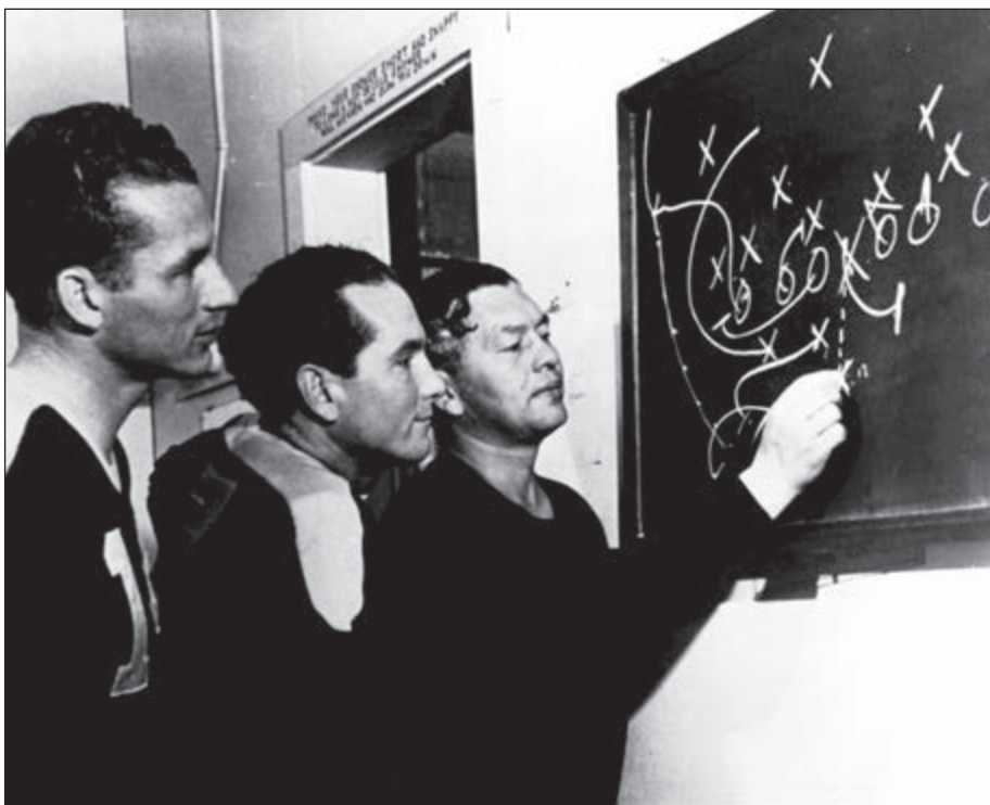
Curly Lambeau draws out a play for his team.

Even with rules making it difficult to implement