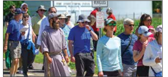
More than 500 faithful, both young and old, and from all the surrounding deanery parishes, joined the Marshfield portion of the National Eucharistic Pilgrimage. Visitors from as far away as Florida and Ohio also attended.