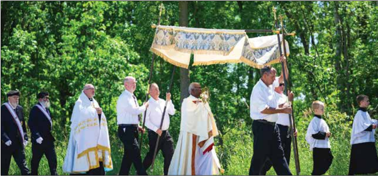
A canopy held by four men sheltered the Eucharist, as priests and deacons from all the deanery parishes took turns processing with the Eucharist.