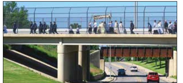
Flag bearers, Knights of Columbus members and servers holding lighted candles, a cross and incense thuribles, filled out the lead of the procession, seen here along the Peach Ave. overpass.