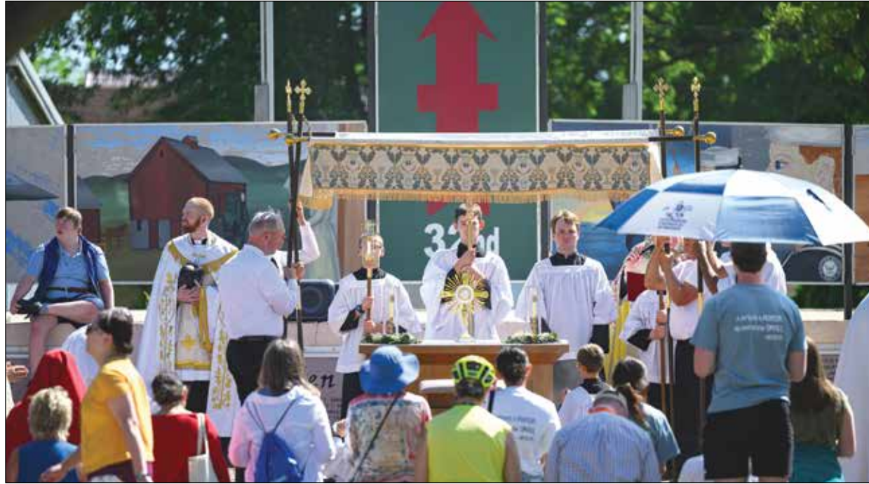
The procession paused at various altar stops along the way. Here, special prayers for our military and especially for our fallen service men and women were offered next to the Veteran's memorial near the public library.