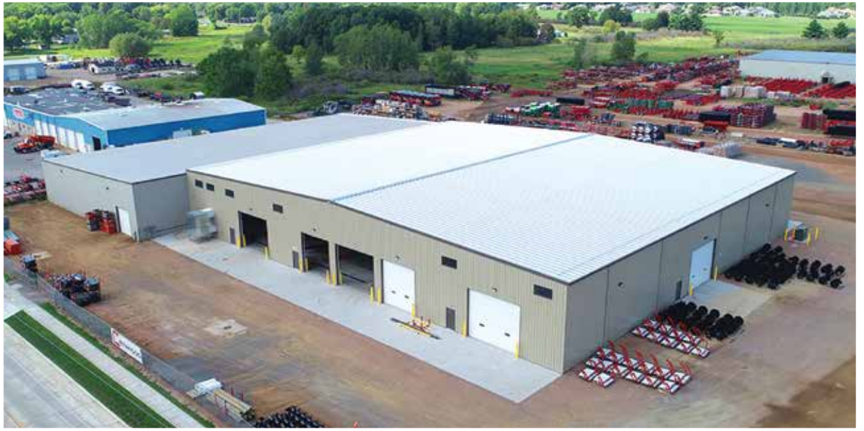
H&S Manufacturing's new 38,000 square-foot assembly building in Marshfield accommodates multiple assembly lines with supplemental automation.

that we would be moving the bulk of the Clintonville manufacturing equipment to Marshfield, and we are in the process of doing that as we speak," Harthorn added. "We have shut down a few machines and the equipment mover is coming in here in a couple of weeks to start the equipment