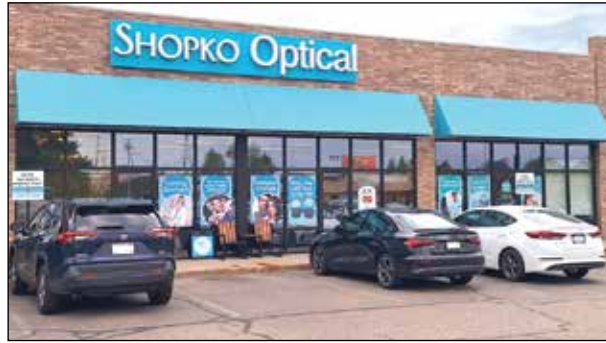
Marshfield's Shopko Optical, 717 S. Central Ave., is included among the stores being acquired by The Fielmann Group, a German family business started in 1972.

More information on the transaction and US strategy will be provided during Fielmann Group's Annual General Meeting on July 11.