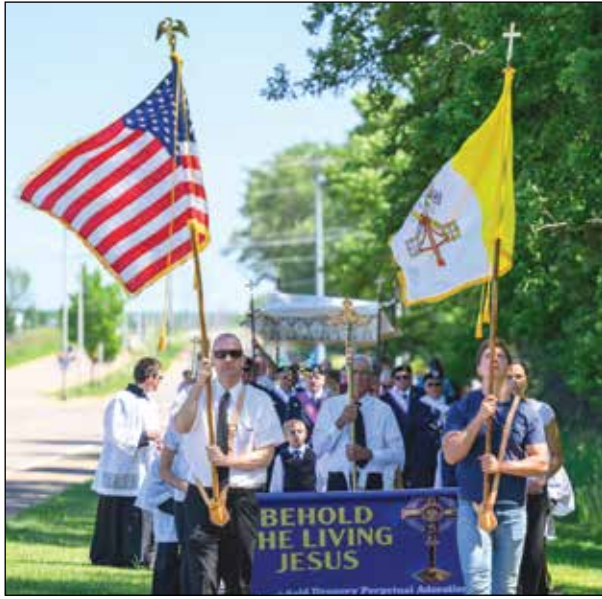
The National Eucharistic Pilgrimage processed along Veterans Parkway June 10, from the Park and Ride off Heritage Drive to St. John the Baptist Catholic Parish.