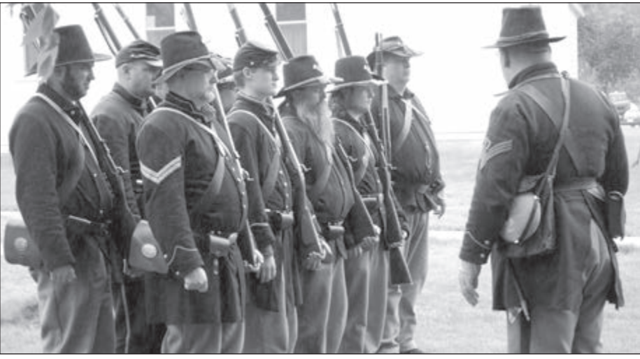
Union soldiers assemble at New London's Heritage Historical Village during a Civil War reenactment. A weekend of history and demonstrations will be on display at the village June 22-23 in New London. File Photo