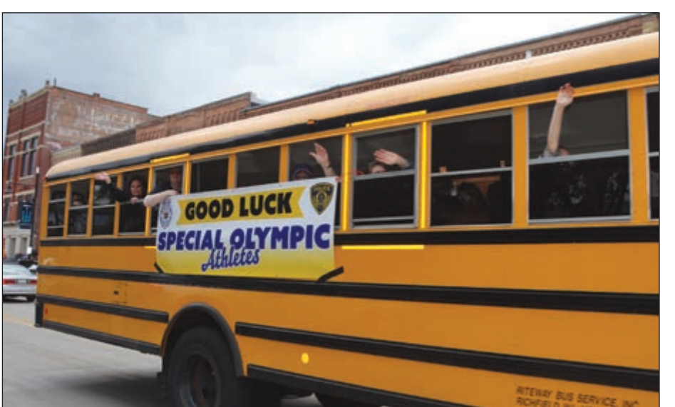
Waupaca athletes competing in the Special Olympics Summer Games received a police escort downtown and up Fulton Street on Thursday, June 6. The Games were held at UW-Whitewater.