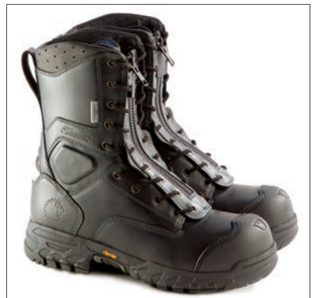
Waupaca firefighters can now wear these wildland boots thanks to a grant from Firehouse Subs Public Safety Foundation.

For the past 18 years, charitable donations have been the driving force be-