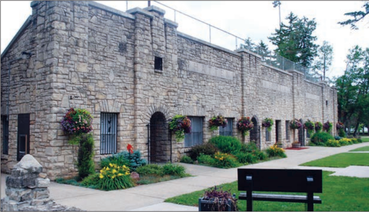
Hatten Stadium in New London dates back to 1935. The project was part of President Franklin D. Roosevelt's New Deal Work Progress Administration to provide employment to Americans during the Great Depression.