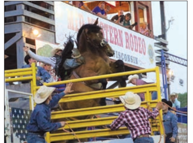
The Manawa rodeo is slated for the July 4 weekend.

St. Peter Lutheran (WELS) 312 W. Main St., Weyauwega Services 4:00 pm Saturday, 9:00 am on Sunday. (920)867-3169, www.splwega.net