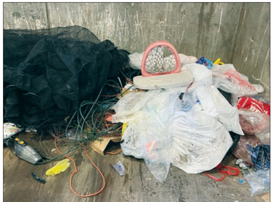
A pile of unrecyclable materials pulled from the Portage County Solid Waste recycling facility on the afternoon of May 30. The pile includes appliances, plastic films and bags, bagged materials, yard debris, toys, a snow fence and a large net.

Readers can learn more about the group at mikeheil123.wixsite.com/web-site .