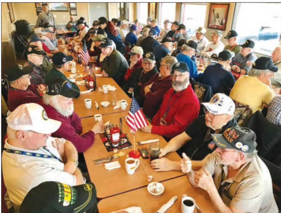
Every week, area veterans meet at a Denny's in Rothschild.

The Sisters of St. Joseph of the Third Order of St. Francis, founded in 1901 in Stevens Point, is a Franciscan community of about 130 sisters and associates. The members serve in diverse ministries across the United States, Puerto Rico and Peru.