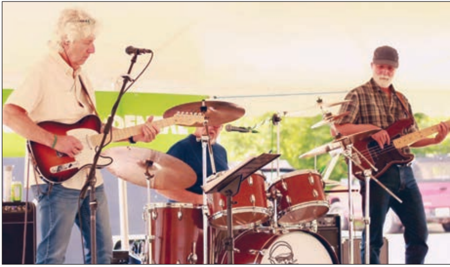
Gray Catz will perform Saturday, June 15, during Heritage Days at Heritage Park in Plover.