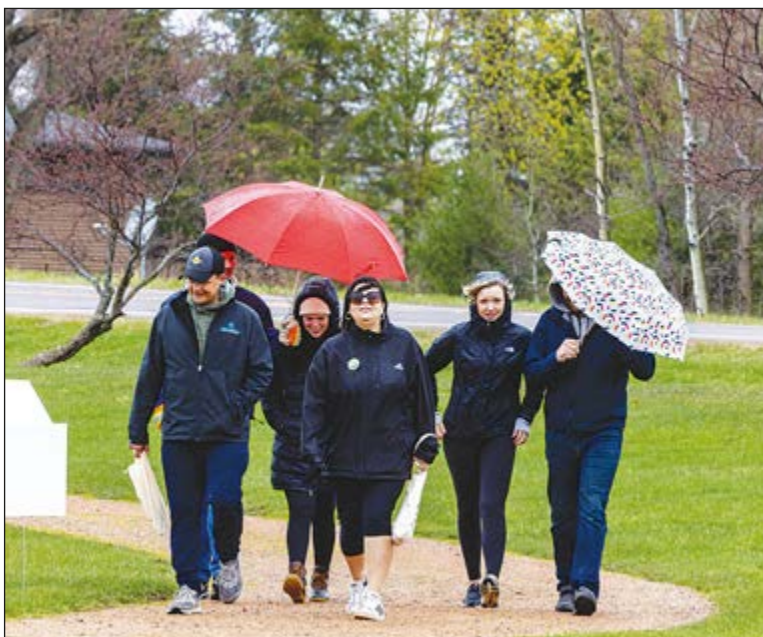
Walkers turned out to take part in the Raise Your Voice Walk despite the damp weather.

The event was hosted by Merrill's Raise Your Voice Club, a student-run organization at Merrill High School, and sponsored by Aspirus and the National Alliance for Mental Illness (NAMI) Northwoods. Raise Your Voice Club exists to help raise awareness of mental health, advocate for change, share resources, and support others.