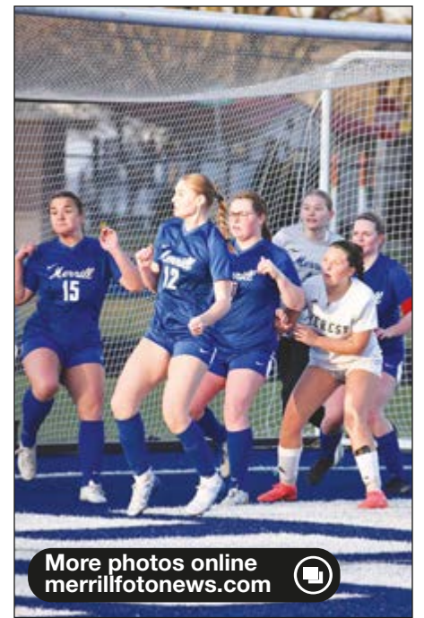
More photos online merrillfotonews.com