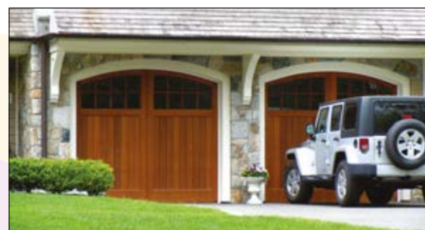
Updated garage doors add curb appeal and provide a strong return on homeowners' investment at resale.

buyers like the idea of low emissivity (low-E) windows, which can cut energy bills by a significant amount over time. The Office of Energy Efficiency & Renewable Energy estimates that heat gain and heat loss through windows is responsible for between 25 and 30 percent of residential heating and cooling energy use, so sellers who can tell buyers they have new low-E windows can emphasize those savings in home listings. The "2022 Cost vs. Value Report" indicates that homeowners recoup roughly two-thirds of their investment in new windows at resale.