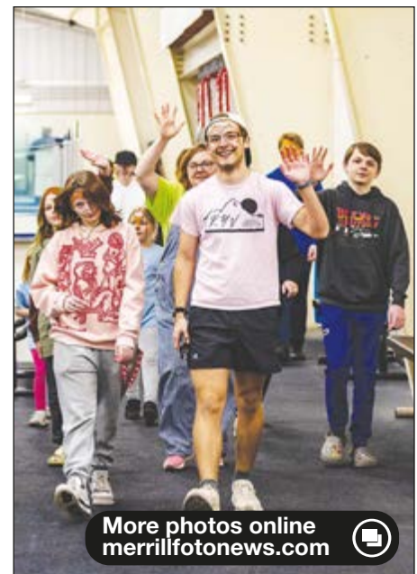
Students came out to support Raise Your Voice.