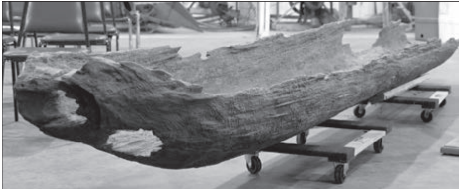
The Iola Historical Society has a Native American dugout canoe on display.