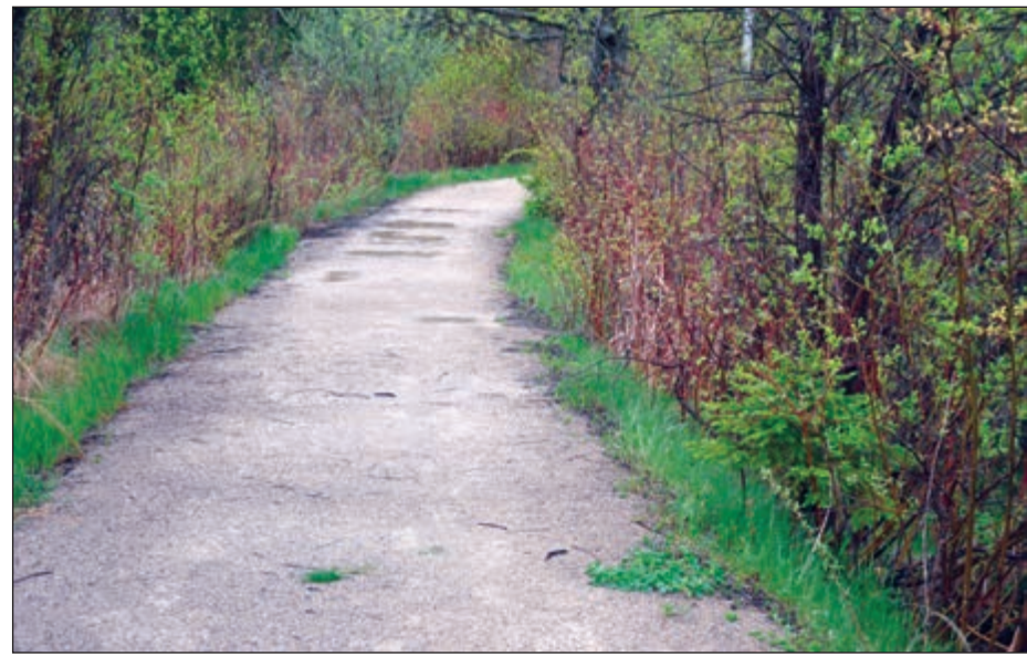
The Dike Trail was recently repaved and repaired with help from the Friends of Hartman Creek State Park. It was almost closed for good because of sinkholes and craters.

The Chain Exploration Center is located at N1360 Silver Lake Drive, off of State Highway 54, west of Waupaca.