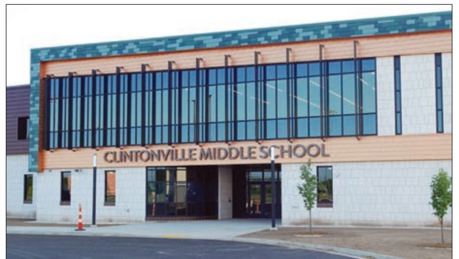
Clintonville Middle School