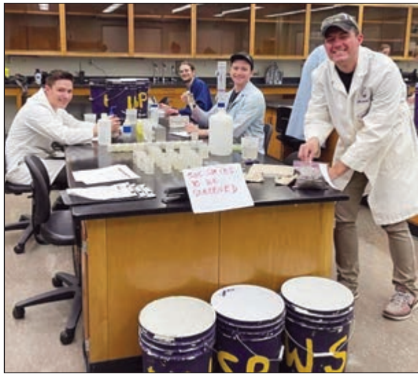
Students in an urban soils course will screen local soil samples as part of a free soil testing event at UW-Stevens Point on Saturday, May 11.

Educational presentations and hands-on learning opportunities on topics such as composting, gardening, tree planting, soil maps, groundwater, erosion and phytoremediation will occur while participants await their results. The soilSHOP event is organized and run by students in an urban soils