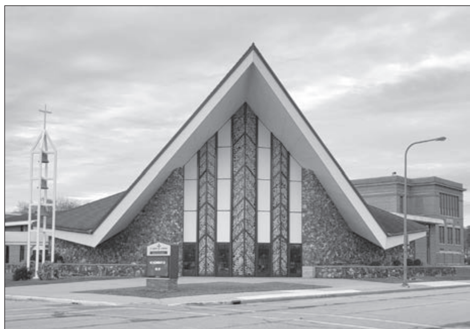
St. Martin Lutheran Church in Clintonville is celebrating its 150th anniversary this year. Its current building was constructed in 1968.

dinner will be held Saturday, Oct. 19, at Northwinds Banquet Hall in Marion.