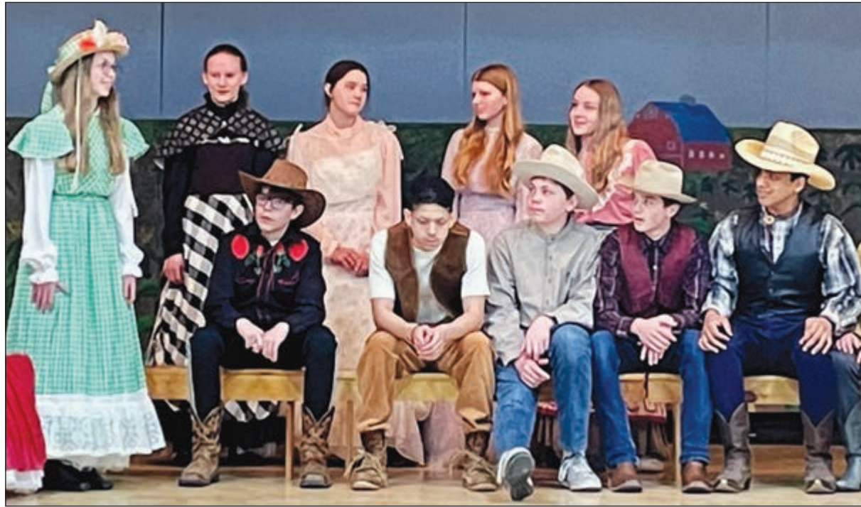
Students at St. Martin's Lutheran School will perform "Oklahoma!" Thursday and Friday, April 18 and 19.