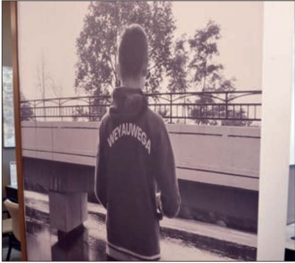
Premier Bank added a hometown touch with wall murals featuring Weyauwega scenes.

The most eye-catching of the renovation are two black-and-white wall murals.