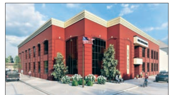
The New London Public Library plans an open house at its future site in the former First State Bank building.