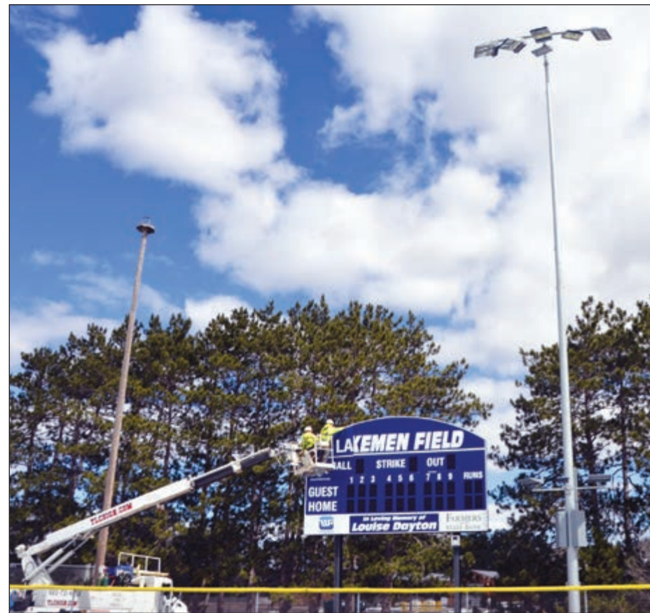
The new lights have been installed at Community First Lakemen Field. The first big home game where the lights will be turned on will be Friday, June 14.