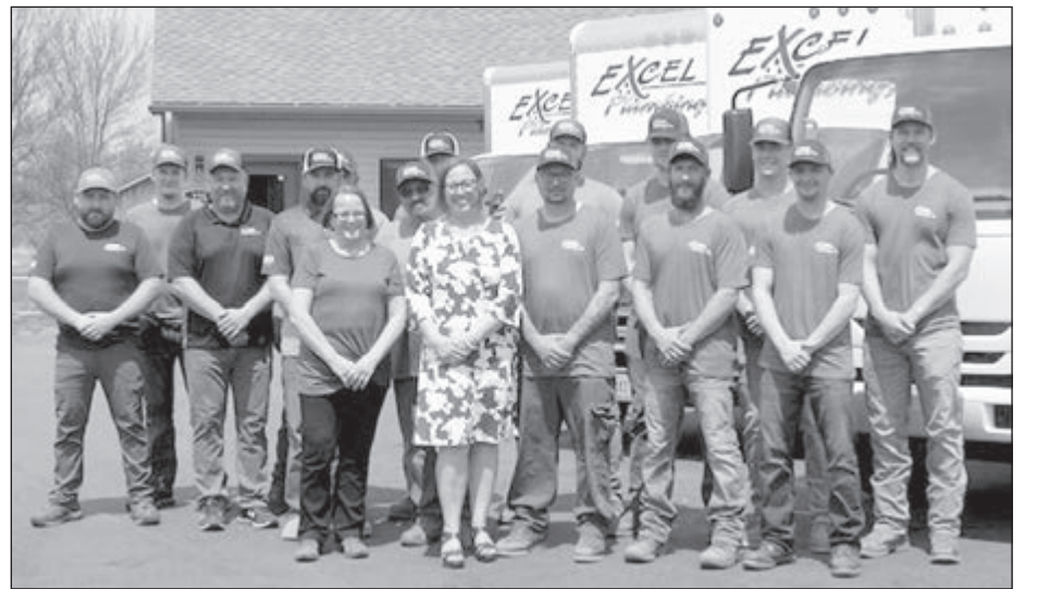
Members of the team at Excel Plumbing in Stevens Point. The company is celebrating its 20th anniversary.