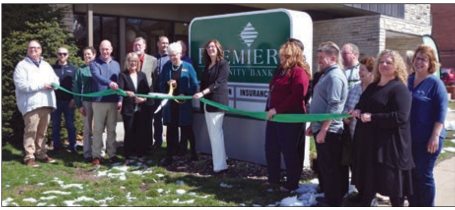
Premier Bank and Hutchinson Insurance held an open house showcasing their new interior remodeling work. Both companies have a shared front entrance.