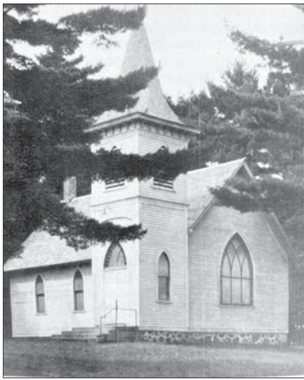
The Hope United Church of Christ, nicknamed "The Church in the Pines," as it looked in 1932. The church will celebrate its 150th anniversary on Sunday, May 19.

They adapted the name "Die Reformirte Hofnungs