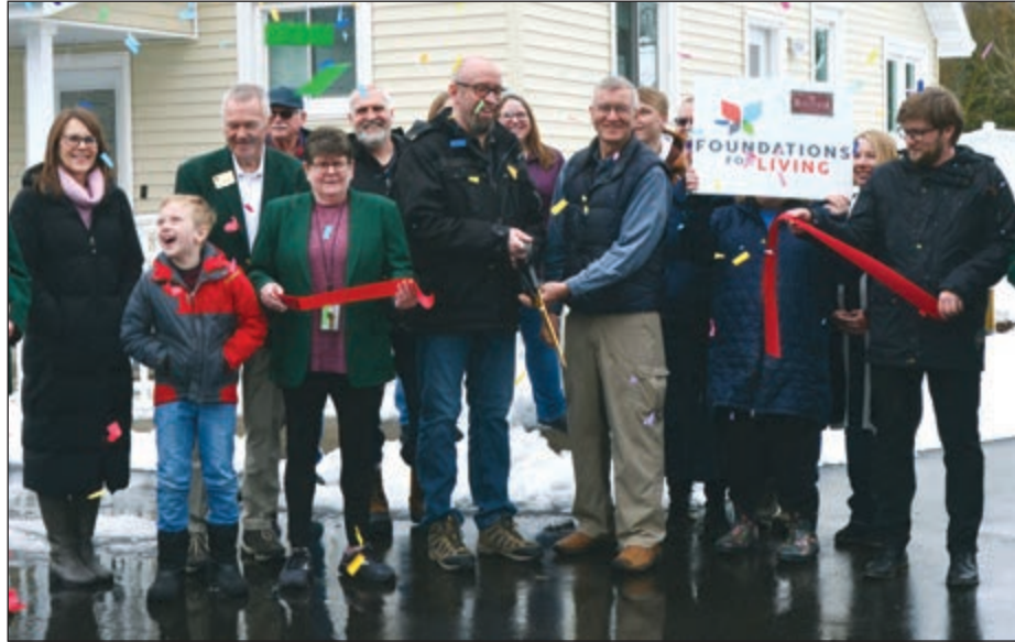
Waupaca Chamber of Commerce ambassadors, Foundations for Living staffers, supporters and volunteers gathered for the ribbon-cutting ceremony for the Middleton House.

He pointed out that it’s a brand-new house. The