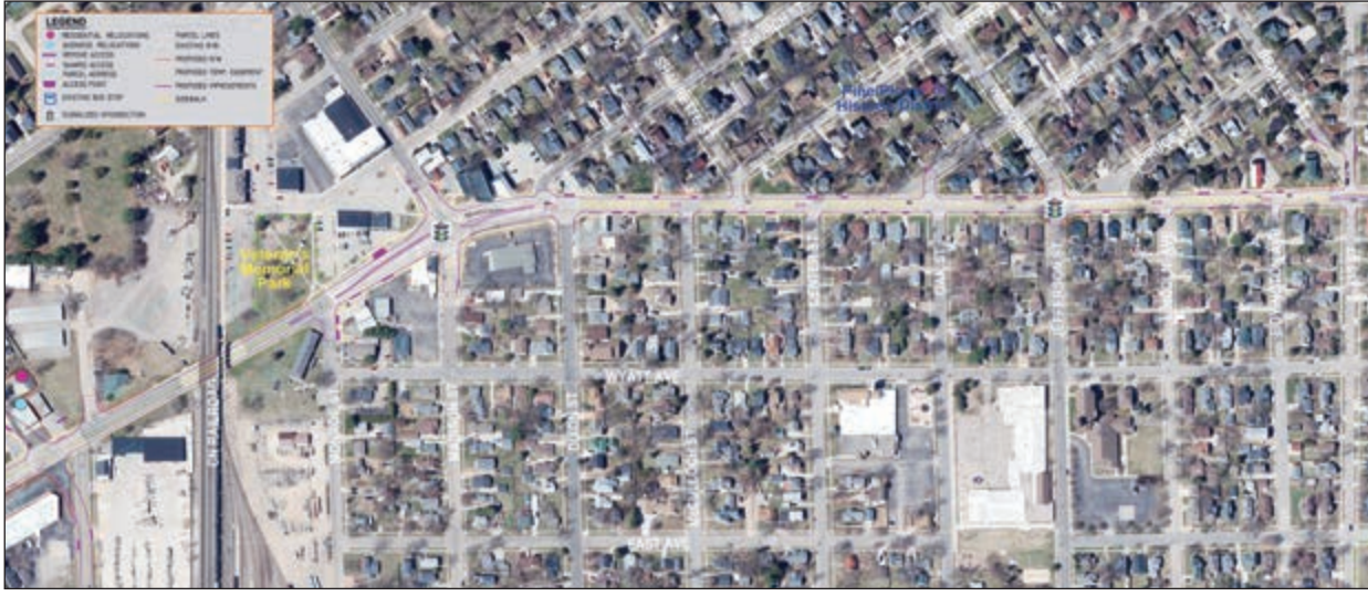
A section of the Business 51 design plans that were on display at an April 2 open house. The design is about 30% complete.