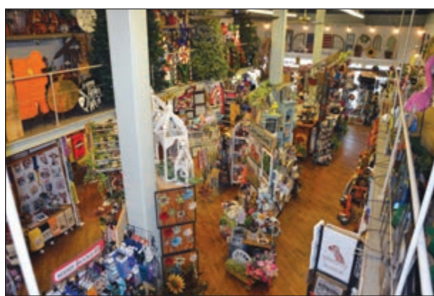
At Market 920, artists, crafters and other vendors can rent a spot within the enormous building to sell their items.