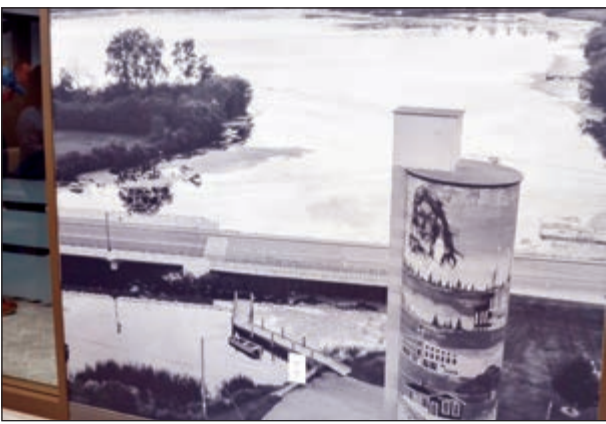
Besides the wall murals, the community room has black and white photos featuring historical scenes in Weyauwega.

One is of a boy wearing a hooded sweatshirt that says Weyauwega on the back. He is standing on a park bench and casting fishing line into the water near the Mill Street bridge.