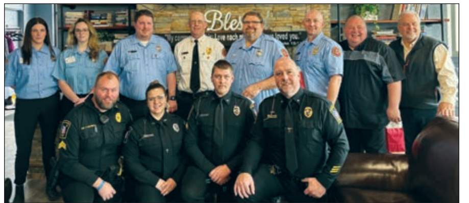
The Refinery Church in Weyauwega recognized the mayor, police and firefighters for their community service in a special ceremony on March 24.