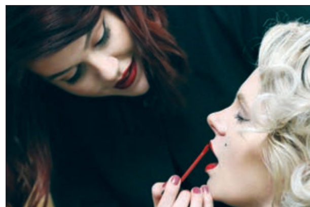
Nicolet College Cosmetology students will style models with the theme "Night at the Movies" for the annual Student Hair Show.