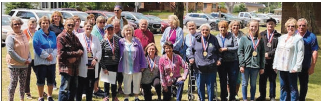
Pictured are the TCTS volunteers who make the grant program possible.