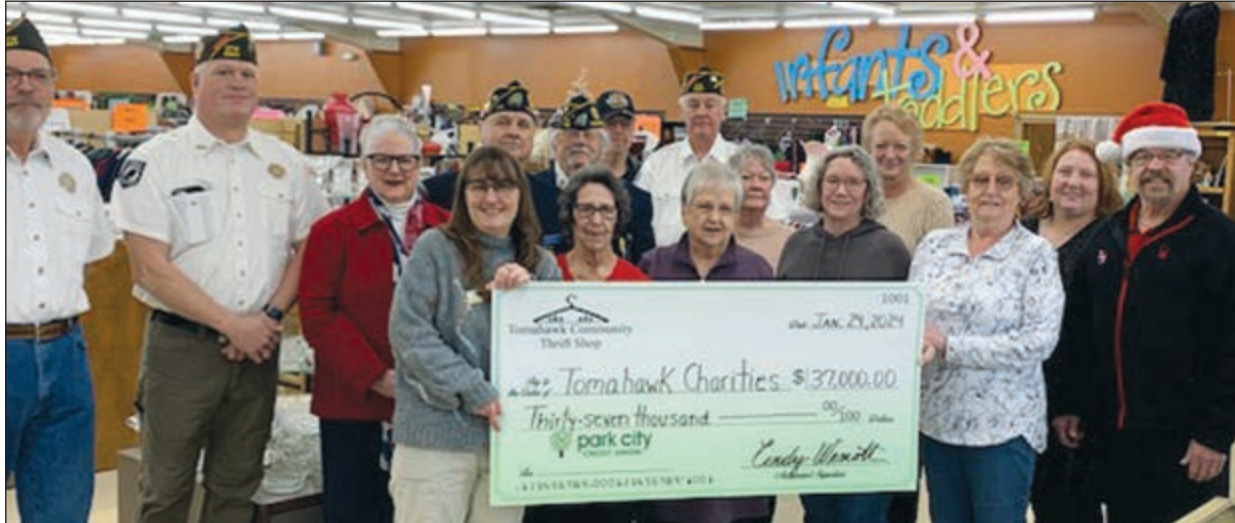
Pictured are individuals representing groups recently awarded TCTS grants.

Contributions were made to the following organizations: Tomahawk Area Interfaith Volunteers (TAIV), for ride program costs; VFW Post 2687, for a kitchen exhaust system; the Salvation Army of Tomahawk's Happy Kids Backpack Program, for food costs; American Legion baseball, for various expenses; American Legion Post 93, for its building renovation project;