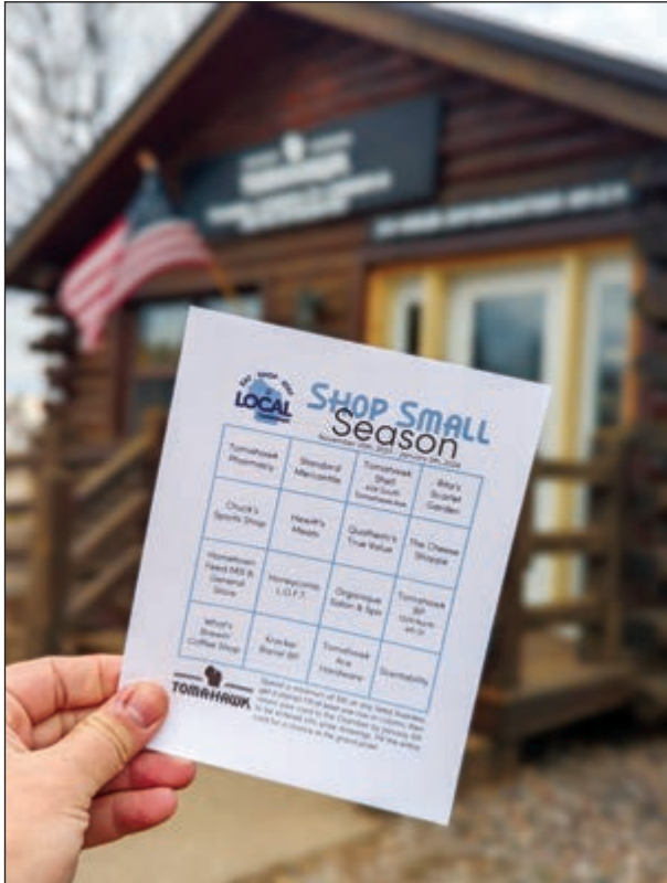
Following the success of its Shop Small Season card (pictured), the Tomahawk Regional Chamber of Commerce will launch cheese and Bloody Mary cards.