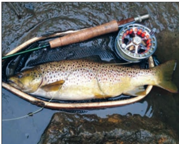
Early catch and release season for inland trout opens on Saturday, Jan. 6.

Anyone wishing to participate in the season will need a 2023-2024 fishing license and an inland trout stamp, which are good until March 31, and