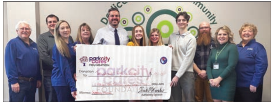
Pictured are representatives from THS, Hatchet Innovations and the Park City Cares Foundation.

Dave Long of Wild Rivers told the council that he anticipates the group's investment in the project to be up to $200,000.00.