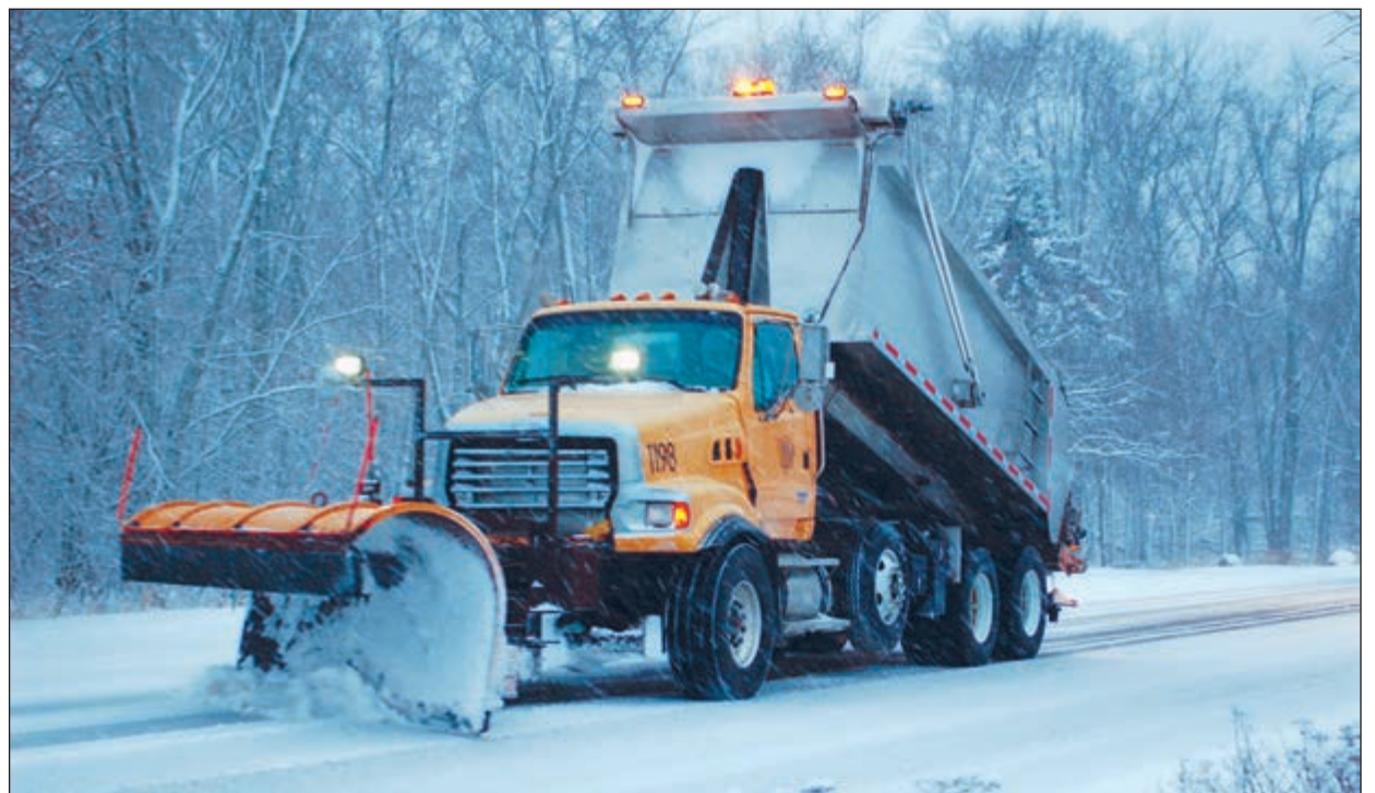
A Waupaca County Highway plow on County Trunk X coming into New London on Monday morning. Traffic was slow and roads were slippery.