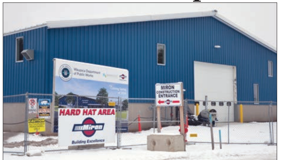
Construction is underway at the city of Waupaca's new Public Works facility.

"The council has had a big part in this, approving the budget and being efficient