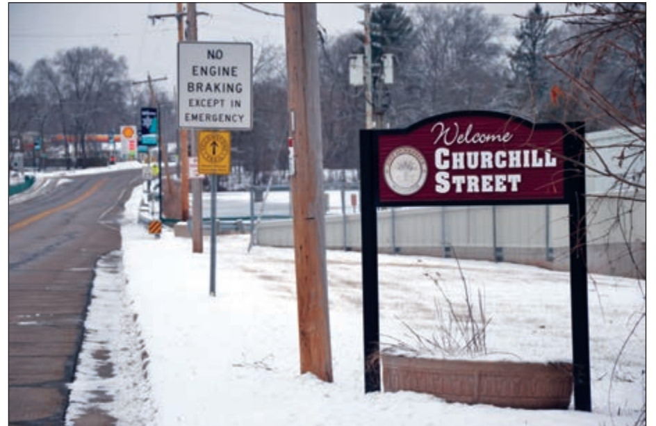
A recent survey and study of the Churchill Street corridor indicated people were interested in the health and beauty of Cary Pond, better walking and biking routes, truck traffic and creating a neighborhood-friendly mix of businesses.

Some of the traffic is from major employers in the corridor: ThedaCare is a few blocks off Churchill, as is the entrance for the school complex (Waupaca Middle School and the Waupaca