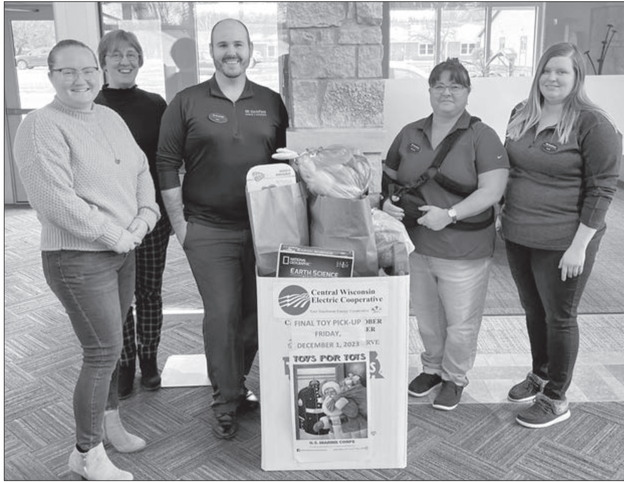
Employees Iola's Bank First branch show toys the bank recently collected for Central Wisconsin Electric Cooperative's Toys for Tots campaign.