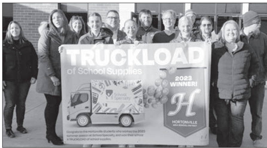
Hortonville High School students and staff received about a dozen pallets of school supplies from School Specialty through a summer employment promotion.