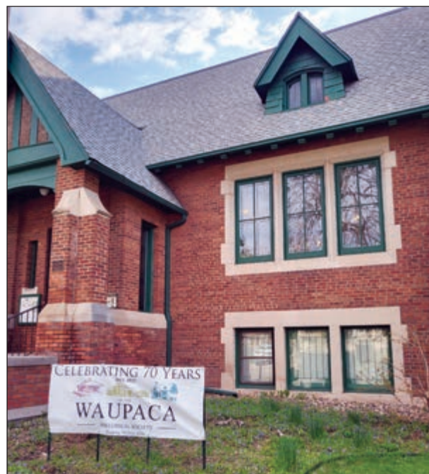
The Holly History and Genealogy Center on South Main Street has a new roof thanks to contributions to the Waupaca Area Historical Society's capital campaign. The society also made other upgrades in the building.