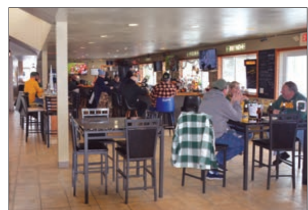
Courtside Sports Bar is now under new ownership and has been renamed Whiskey Junction. The interior got a big makeover, there is a new menu and outside activities are planned for warm weather.

Opposite the lounge space is a dining area that