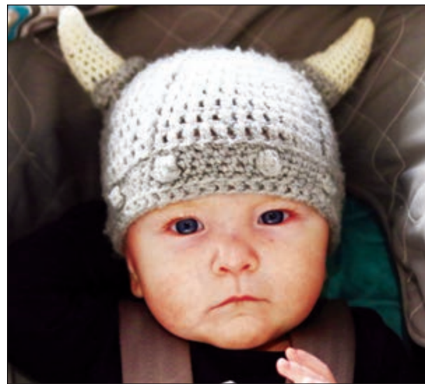
An infant wore his Viking helmet during the Iola Winter Carnival in 2020.