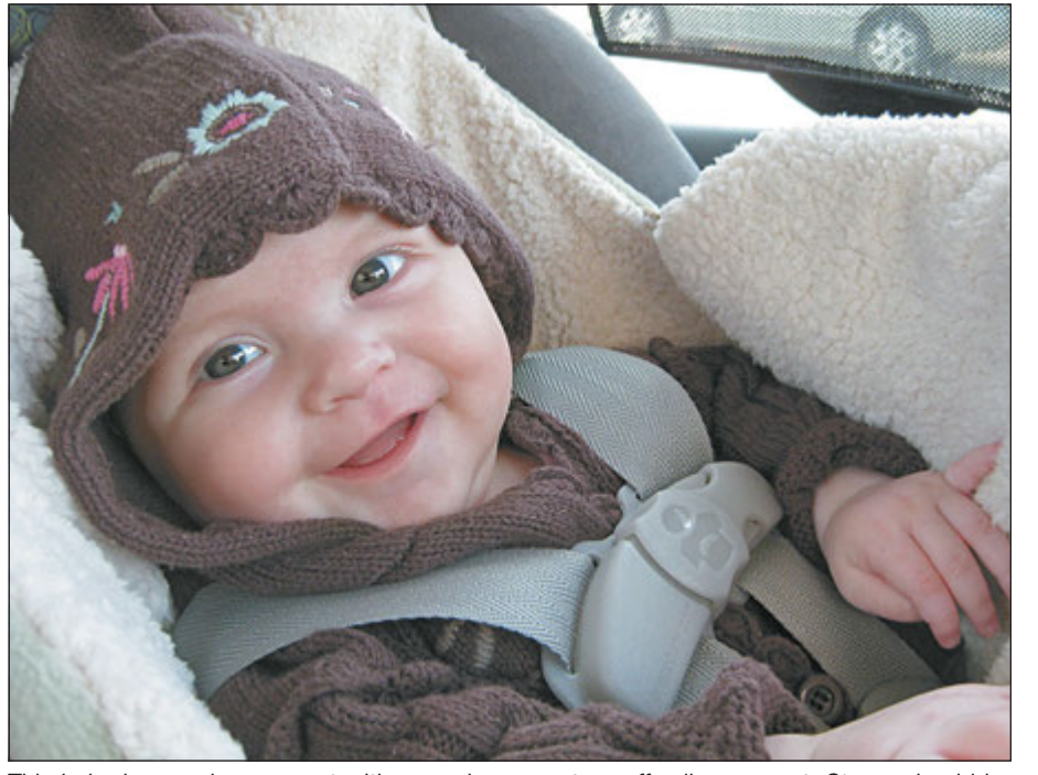
This baby is snug in a carseat with warm layers, not a puffy slippery coat. Straps should be adjusted tighter to hold baby securely in the seat. Stock photos.