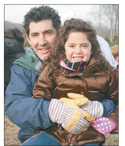
This kind of puffy coat is a no-go in a carseat or booster.

additional layer. For instance, if a parent is wearing a jacket, the child can wear a jacket and a hat. This ensures that the child stays warm without compromising their safety in the car seat. Aspirus Health recommends SKW's simple coat check to ensure the security of the car seat. After strapping the child into the car seat with the coat on, parents can remove the child without adjusting the straps, take off the coat, and place the child back in the seat. Dr. Oswald says, "If the straps still fit snugly, the layer is safe. But if the straps become significantly looser, the layer is too thick and poses a risk." By adopting alternative clothing options and following safety measures, parents can ensure their little ones are snugly secured, protected from both the cold weather and the unexpected dangers of puffy coats in car seats. For more information on passenger safety, visit aspirus.org/passenger-safety.