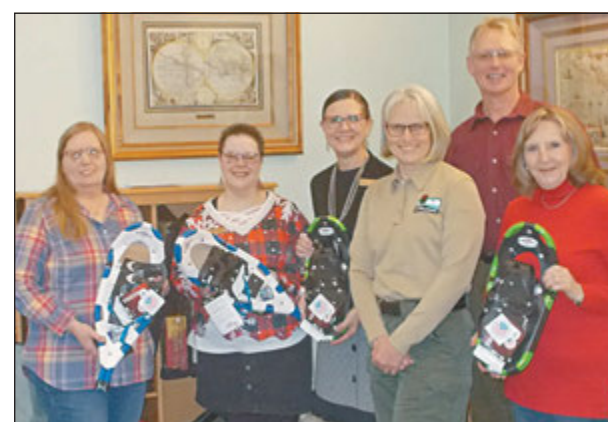
The FoCGSP also purchased and donated four pairs of snowshoes to

The program and passes aim to expand new visitors' access to the Wisconsin State Park system by providing families with a chance to visit any Wisconsin State Park or Forest for free and introduces people to the library system and to Wisconsin State Parks. Each vehicle pass is valid for one day of the patron's choosing. Along with the daily pass, the cardholder will receive an information kit of State Park materials and maps, stickers, accessibility information, and more.