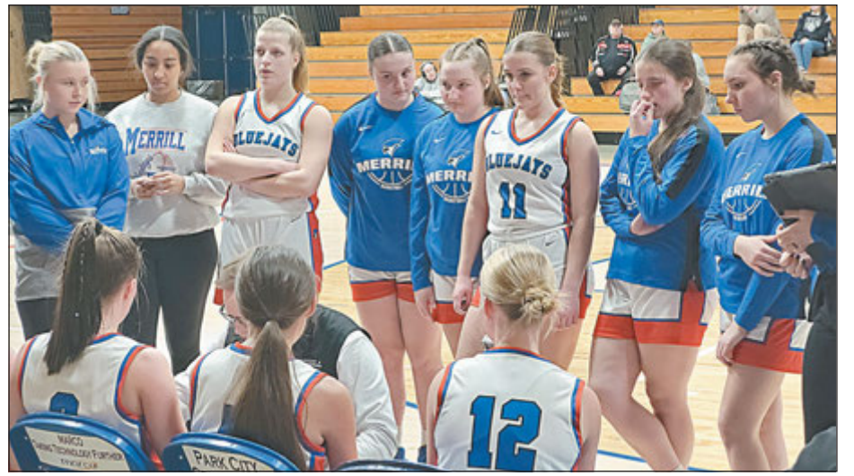
Merrill Girls huddle up during timeout to discuss strategy versus Medford in the first half.