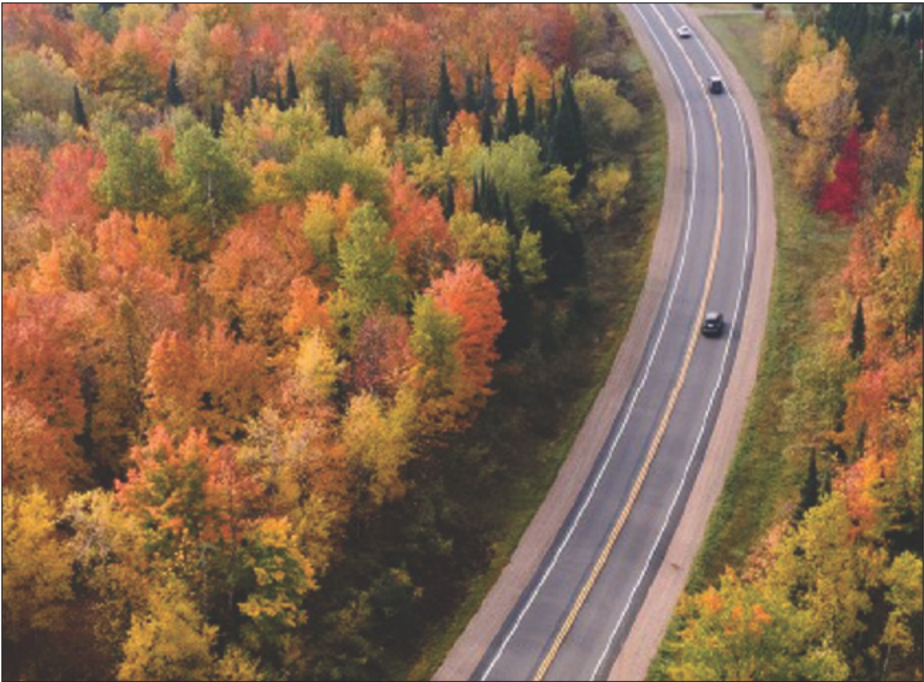
This stretch of WIS 17 in northern Wisconsin connects Rhinelander and Eagle River in Oneida and Vilas counties, and carries lots of hunters and holiday travelers this time of year.

Cruise, bus, and train traffic gains ground The number of Wisconsinites traveling by cruise, bus, and train over Thanksgiving is up nearly 11 percent over last year. AAA expects nearly 30,000 travelers to head