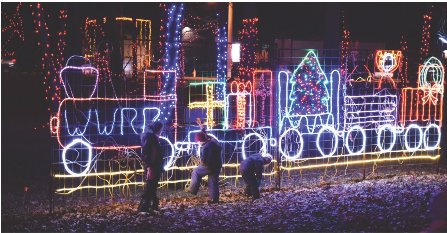
The train greets visitors near the entrance of the Rotary Winter Wonderland display, and is among the fan favorites each year.

Rotary Winter Wonderland serves as a way to collect food and money for 35 food pantries