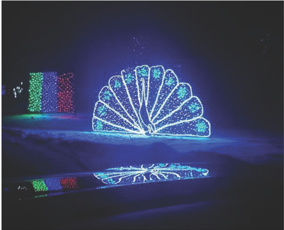
The reflection of "The Peacock" can be seen in the hood of a car at the 2017 Rotary Winter Wonderland display, which also features a drive-thru option.