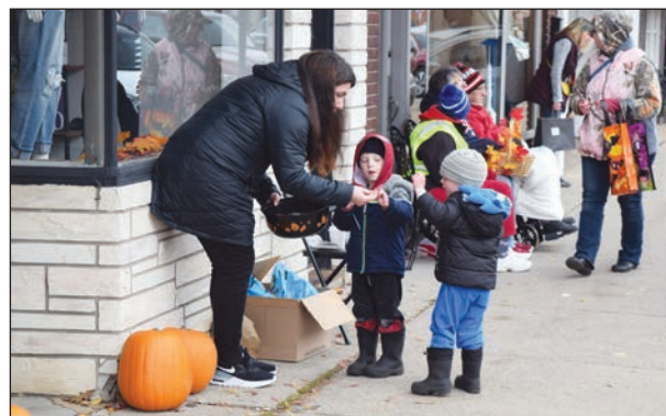
Tomahawk Main Street Inc. hosted its annual Fall Fest in downtown Tomahawk on Saturday, Oct. 28. The event featured family activities, trick-or-treating at downtown businesses, pumpkin decorating, a kids' Halloween costume raffle prize drawing, balloon twisting, Halloween games, cookie decorating and more.