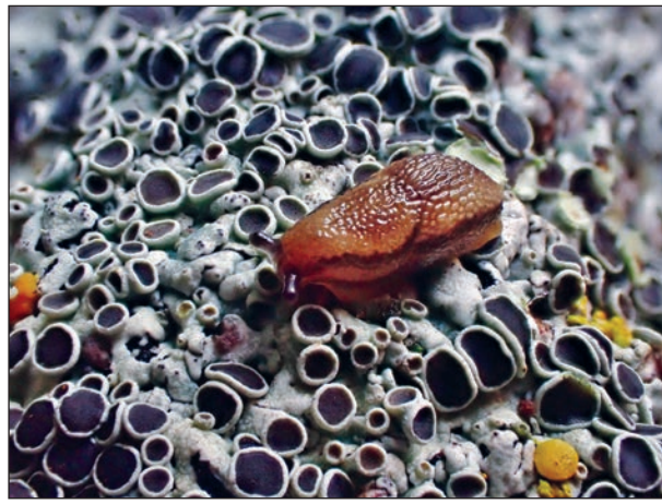
A dusky arion slug explores the wilds of a lichen covered stick. Slugs need to stay wet, and so are most active at night and in damp weather.

Why would a slug get rid of the beautiful, cozy, humidity-controlled, predator-resistant house that snails still possess? Shells require a lot of calcium to build, which is in short supply in our sandy soils. Shells also prevent their owner from squeezing into hiding places like soil tunnels and rotting logs, two habitats that contain enough