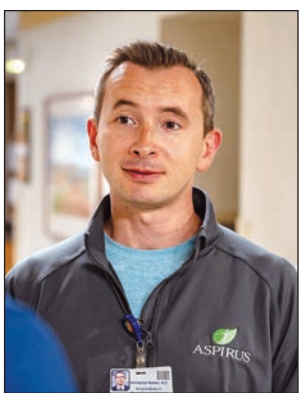
Manko Photo courtesy of Aspirus

Aspirus said the science behind SAD is rooted in the interplay between light ex-