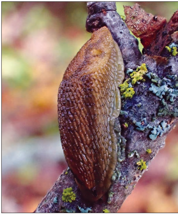
As this dusky arion slug rests on a lichen covered stick, noticed the undulating foot along the length of their body, as well as the mantle of different textured skin near their head. You can barely see a tiny dimple that is their closed pneumostome or breathing hole.

Suddenly, something wet and shining loomed ahead. As I watched, the slug extended their beige-colored form and undulated across the lichen field on their single, body-length foot. Their movement was surprisingly graceful. When I looked up the species, the name was lovely, too: dusky arion. Never mind that they are introduced from Europe and often become garden pests. I'll re-