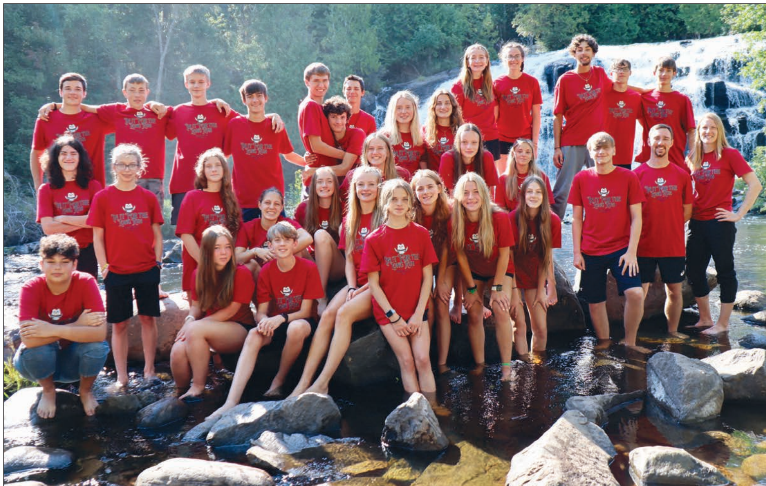
The 2023 Tomahawk Hatchet cross country team took part in the season-starting camp in Bond Falls, Mich.

On Saturday, Aug. 19, the Tomahawk Hatchet Cross Country team hosted its 22nd annual Alumni Scrimmage at the entrance to Bradley Park, where the 2023 Hatch-