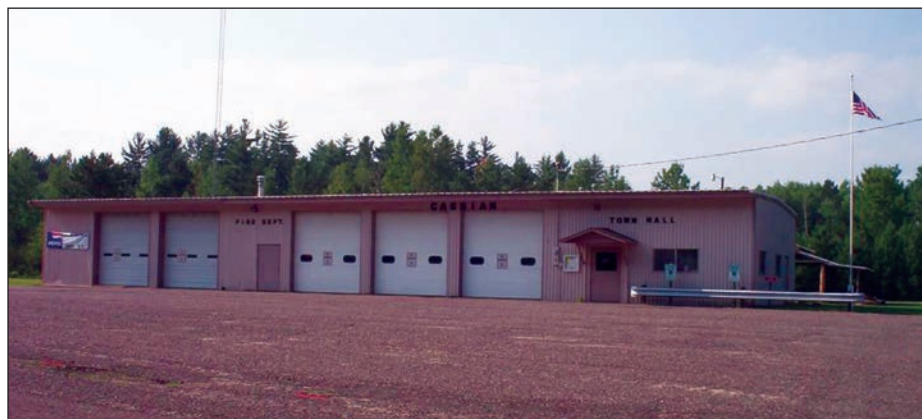
Cassian Town Hall and Fire Station.