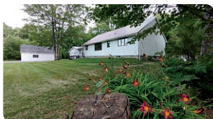
BRADLEY TWP HOME MLS # 202793 $285,000