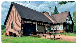
PINE LAKE HOME MLS # 203112 $265,000