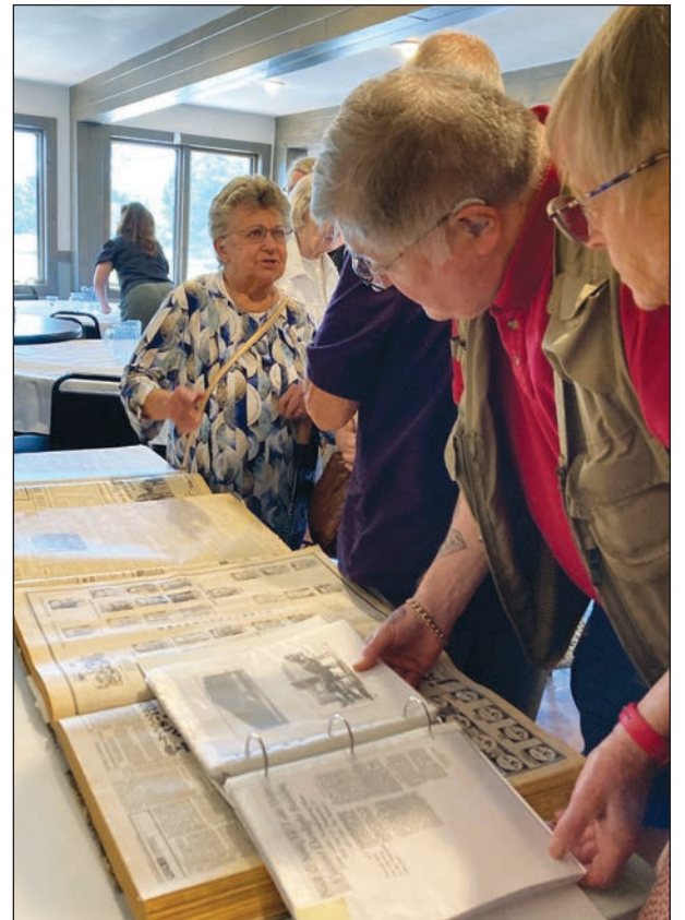
Bound volumes of the Tomahawk Leader were available to view.