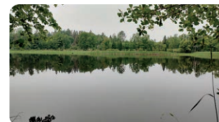
WISCONSIN RIVER LOT MLS # 202100 $69,000

Nobody in Wisconsin sells more real estate than RE/MAX