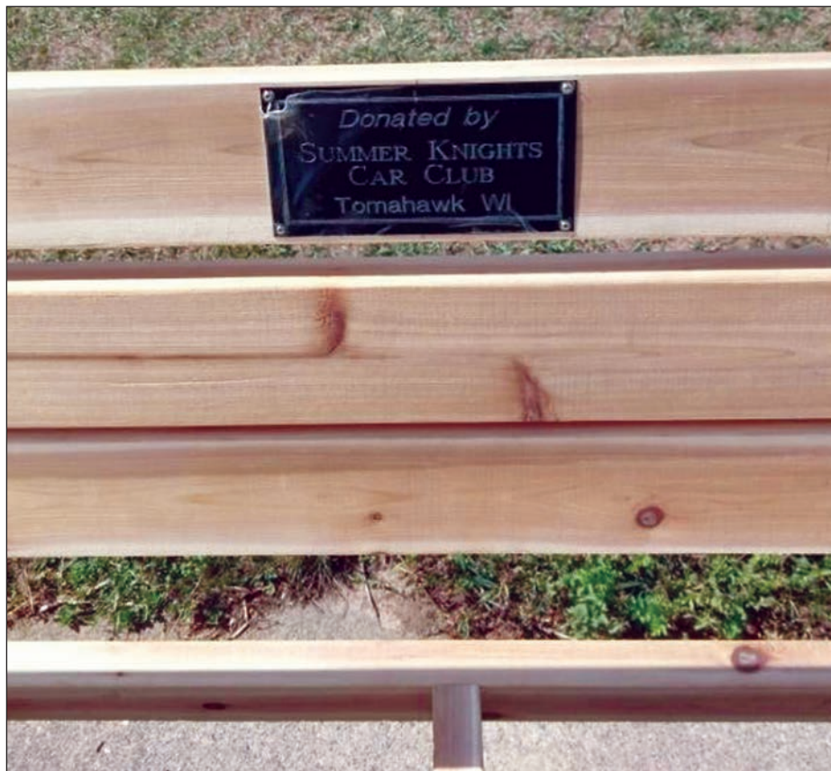
The Summer Knights Car Club recently sponsored a new bench placed in Veterans Memorial Park.