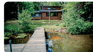
PICKEREL LAKE HOME MLS # 203290 $279,900