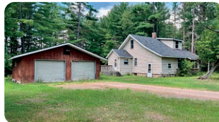
PINE LAKE HOME MLS # 203111 $135,000