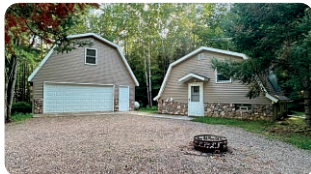
LANGLADE TWP HOME MLS # 203108 $149,000