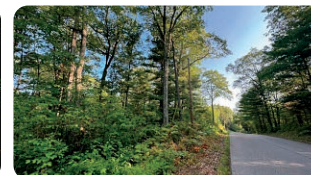
NEWBOLD TWP LOT MLS # 203276 $169,000