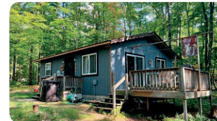
ARBOR VITAE HOME MLS # 203110 $162,000