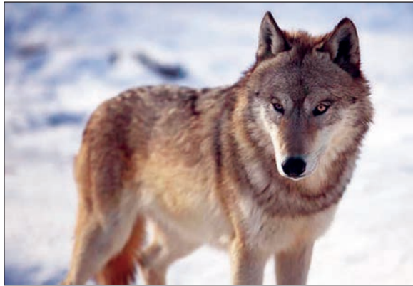
The Wisconsin Department of Natural Resources (DNR) is seeking public comment on proposed permanent wolf rules relating to gray wolf harvest regulations.

A virtual public hearing ( www.tinyurl.com/3ahpn7tn ) on the pro-