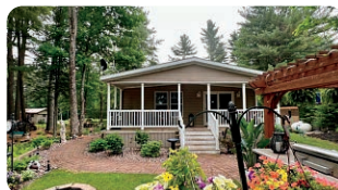
HIXON LAKE HOME MLS # 202127 $299,000