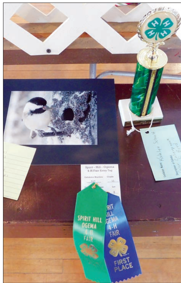
Katelyn Schult – Photography Best of Show, Bird Enlargement.