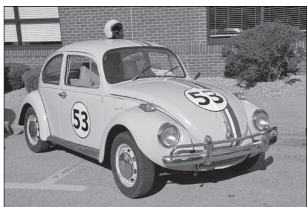
Herbie the Love Bug was one of a number of movie-themed vehicles at the Weyauwega Car Show on Main Street.

A black 1977 Pontiac Trans Am with a firebird on the hood came to th4 show.