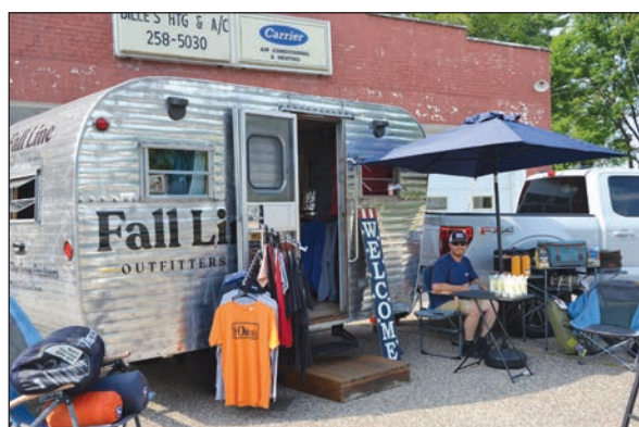
Fall Line Outfitters of Stevens Point sets up a mobile fly-fishing shop every Friday and Saturday on County Trunk QQ in King.

"This is kind of a test run. I feel like there is a market down here. We got to test the waters a little bit. It's going to take time for people to realize we're down here. We have a decent following on social media and we've gotten sales