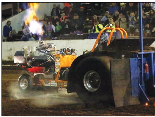
The roaring engines of truck and tractor pulls are among the summer attractions of the Waupaca County Fair.

On the Midway Stage, Too Hype Crew and Bella Cain will perform from 8 p.m. to midnight. Too Hype Crew is