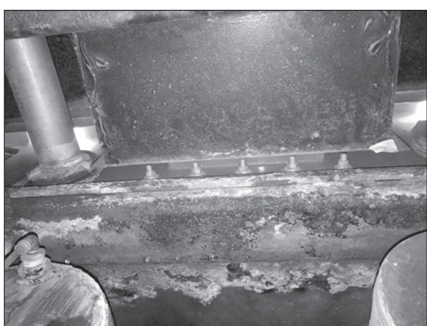
Corrosion on the undercarriage of the New London Fire Department’s existing tanker truck.

“There’s nowhere near the amount of rust on them,” he said. “The problem with the Midwest truck is that they did not undercoat anything and