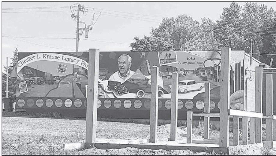
Construction has begun on the new bathroom facilities at Chester L. Krause Legacy Park in Iola. The project will be paid for with a $50,000 Vibrant Spaces grant from Wisconsin Economic Development Corp.