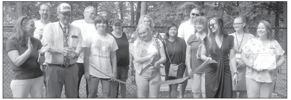
A ribbon-cutting ceremony was held at Bucholtz Bark Park in Clintonville Wednesday, Aug. 2.

Total cost for the items replacing the plow truck would be $257,000.