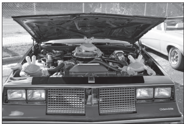
With some vehicles the most interesting thing was under the hood. Some vehicles had their hoods open to show off the immaculate engine work.

It was the same car that Burt Reynolds drive in “Smokey and the Bandit.”