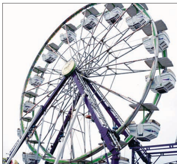
Midway rides are a highlight of the Waupaca County Fair.

Grandstand entertainment begins at 6:30 p.m. with the Waupaca County Championship Truck and Tractor Pull.