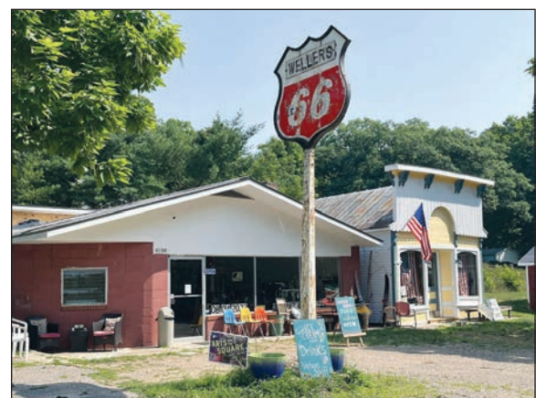
The Weller's Store on Main Street in historic Rural, south of Waupaca.

If convicted, they could each serve up to 25 years in prison.