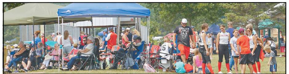
With five fields of play, 42 teams, countless family and friends, and dozens of volunteers, the MARC played host to a lot of locals and visitors from throughout Wisconsin and the UP at Sunday's Fastpitch Tournament.