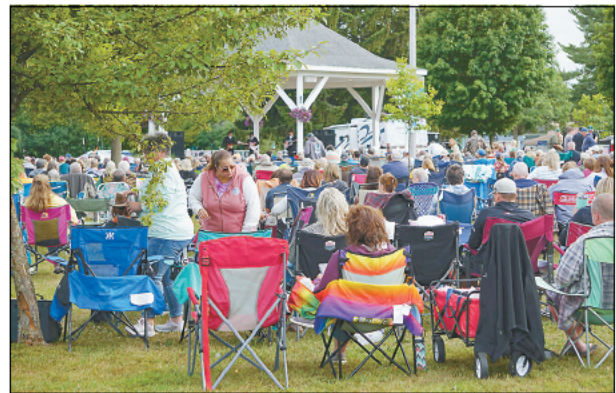
Another view of the crowd.