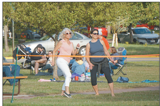
"Twist and shout... ooooo" Why not get up and dance?