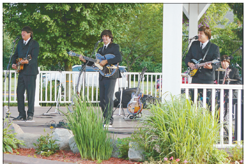
Beautiful night, beautiful flowers, beautiful music. It's Thorogood Thursday at Normal Park!