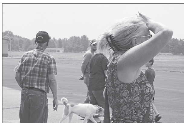
All eyes were on the sky at and around the Merrill airport on Sunday as planes dropped altitude to cross the finish line in the EAA AirVenture Cup Race.

An airplane flies over the Merrill Airport. This entry in the race was a traditional style aircraft.