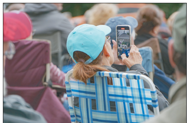
Lots of cell phones were out Thursday night snapping photos and taking videos of The BritTins.