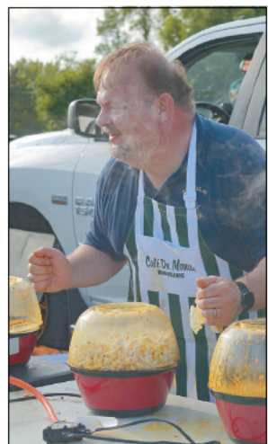
Dancing to the tunes, popping popcorn, and celebrating his birthday, according to nearby sources. Won't he be surprised to see his photo in the paper?