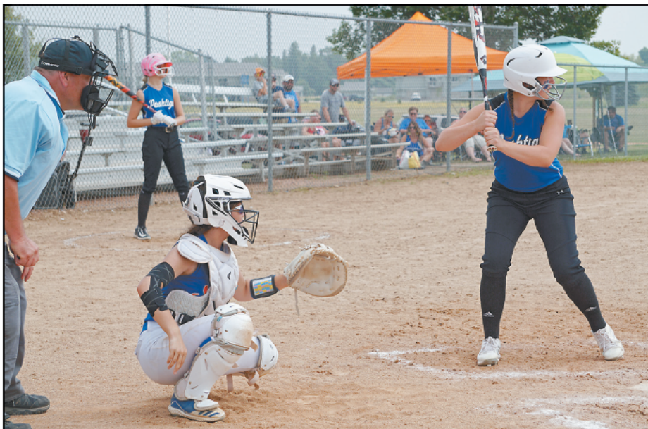
The girls from Peshtigo are up to bat. Merrill's 14U catcher is focused and ready, maintaining eye contact with the pitcher in one of the games at the Fastpitch Softball Tournament at the MARC last weekend.