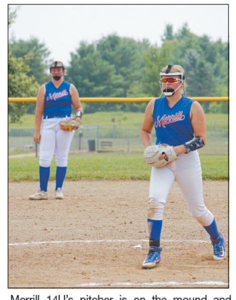
Merrill 14U's pitcher is on the mound and ready for action against Peshtigo.