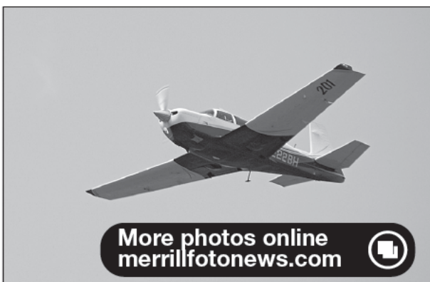
More photos online merrillfotonews.com

Approximately 70 unique aircraft in 29 race classes raced a route of more than 400 nautical miles to make a low pass over Merrill where their finish time was clocked.