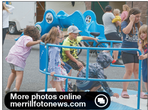
Kids at play enjoying friends and music.