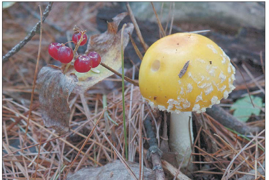
This photo, though not a contest entry, is a colorful example of the kind of image that would make a great entry in the Plant category.

images may be viewed on the Friends of Council Grounds State Park Facebook page, at the Park contact station, and at the T.B. Scott Free Library in Merrill. The public will vote on their favorite single image on the Friends of Council Grounds State Park Facebook page or by emailing their vote for their favorite image to cgphotos@hotmail.com . Only one vote per person. Duplicate