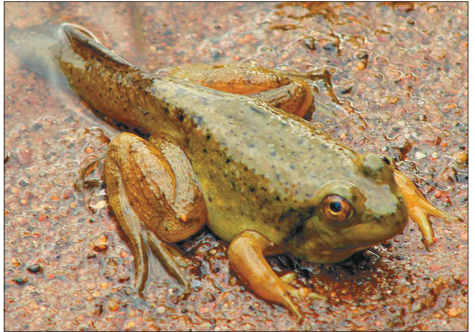
This photo of a developing tadpole was entered into the Wildlife category in a previous year’s Friends of Council Grounds photography contest.

The three finalist photos in each category will then go to public voting to determine the final first-and second-place winners in each category. Public voting will take place from Aug. 15 through Aug. 31, 2023. Finalist