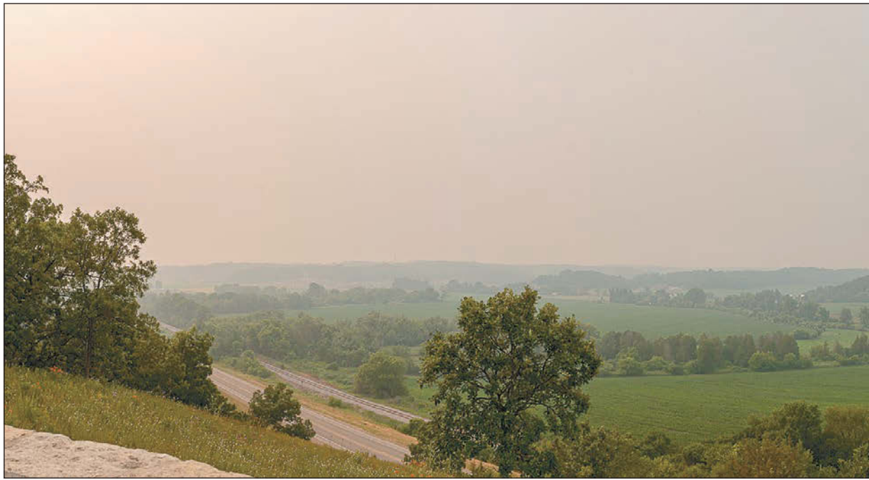
Gray skies filled with smoke coming down from Canadian wildfires have been a common occurrence this summer in Wisconsin and many other states. Submitted photo.

"A lot of these fires that are burning are in areas where they either can't extinguish the fires because they're in such remote areas, or they just don't have the staff," said the Wisconsin DNR's Ron