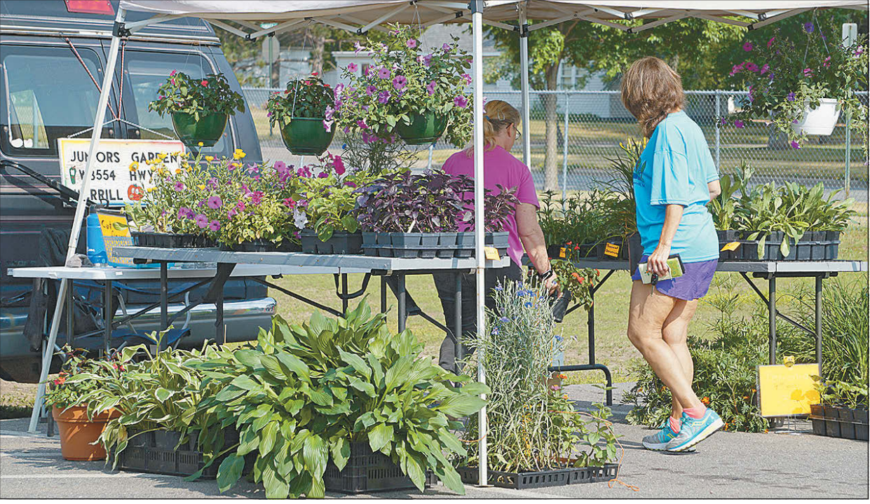
Perennials, flowering annuals, herbs, and other live plants are available from this vendor. Some vendors also offer fresh-cut flowers as they are in seasonal bloom.