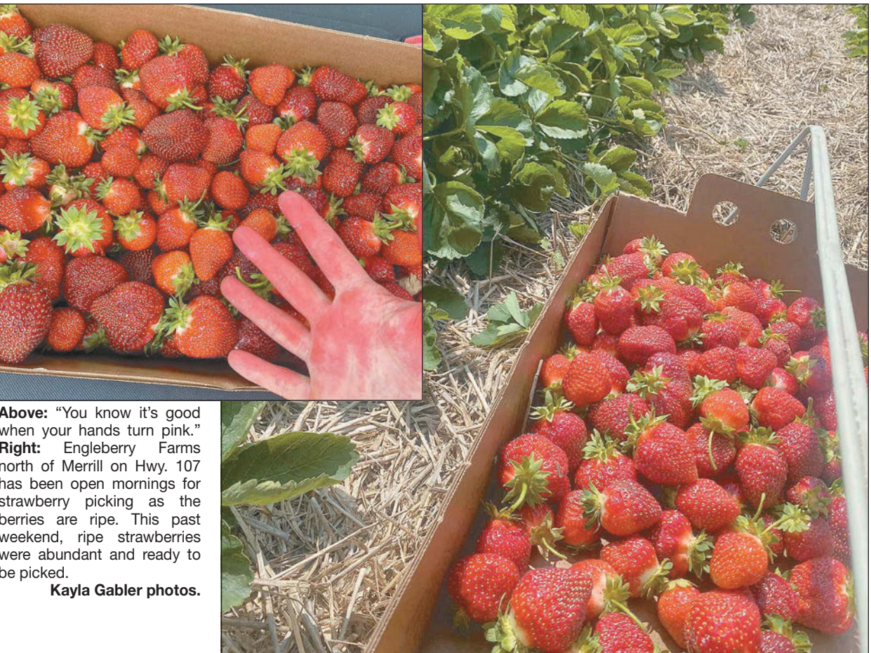
Above: "You know it's good when your hands turn pink." Right: Engleberry Farms north of Merrill on Hwy. 107 has been open mornings for strawberry picking as the berries are ripe. This past weekend, ripe strawberries were abundant and ready to be picked.