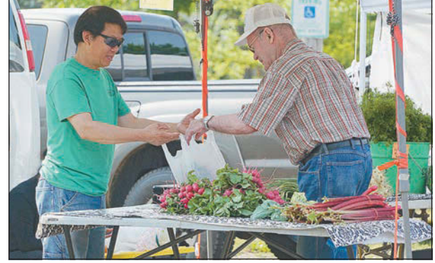
Left: Area farmers offer their produce for sale on Wednesday and Saturday mornings during the summer at Normal Park. Smiles are free. Right: From radishes to rhubarb, fresh fruits and vegetables are in abundance at the Merrill Farmer's Market at Normal Park on Wednesday and Saturday mornings, along with handcrafted items, baked goods, berries in season, and much more.