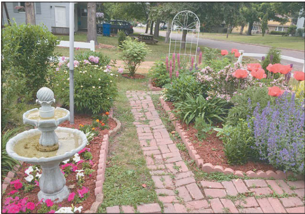
Curated objects, such as this fountain, enhance the flowers and foliage in the Osswald garden.

MERRILL Foto News Your Community Your News Your Paper