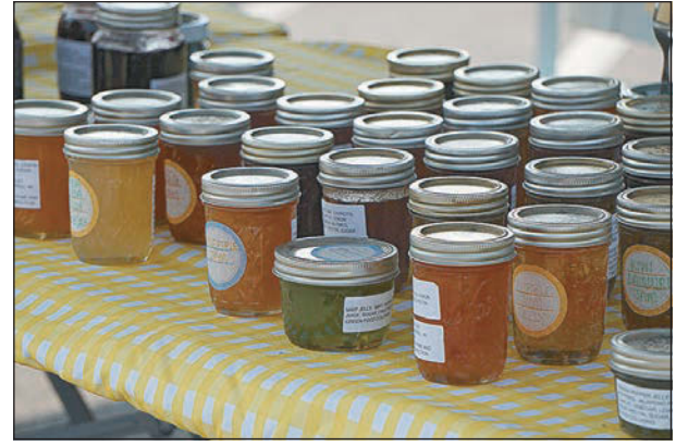
Left: You might be very surprised to discover what you can purchase from local vendors at Merrill's Farmer's Market ... like handcrafted jewelry for instance. Right: Several vendors offer locally canned jellies and jams for sale.