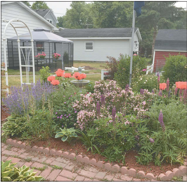
A walkway between cultivated flower beds makes for a serene place to walk among the blooms.