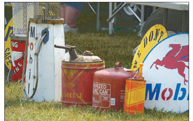
If you're into vintage hotrods, chances are you might also be into vintage gas cans, signage, and gas pumps as displayed at one vendor's booth.