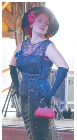
Right: A contestant in the pinup contest strikes a pose.