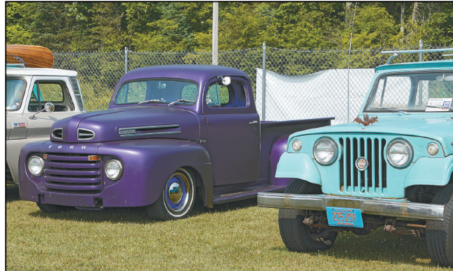
Vibrant colors really make some vehicles at the Northwoods Roundup pop.