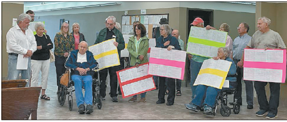
A group of about 20 people who called themselves the “People for Pine Crest” speak during a June 24 press conference they organized.

“And their recent claims that they’re not committed to a sale are even more disingenuous,” she said.