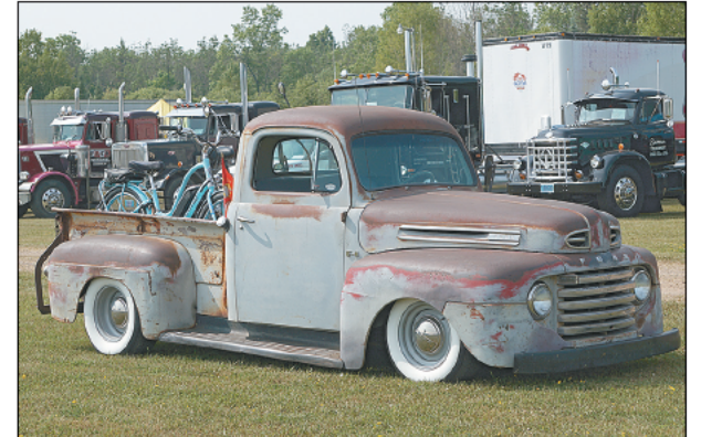
Whether you plan to travel on two wheels or four, this exhibitor is all set. And in the background, a lineup of folks who like to travel on 18 wheels show off their vintage semi trucks.