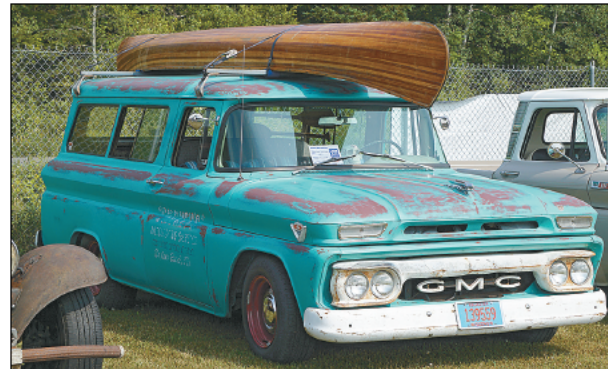
A vintage GMC sports a canoe at the Northwoods Roundup Vintage Weekend in Deerbrook.