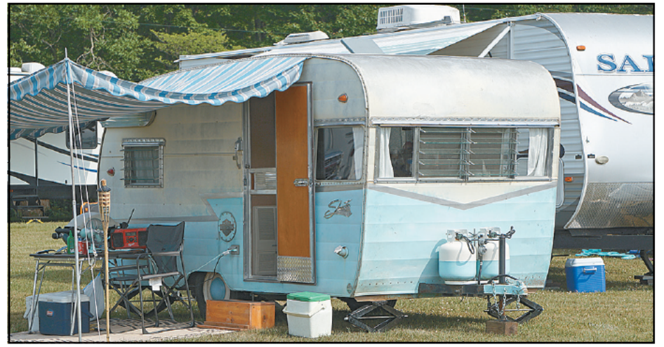
A vintage-themed event is the perfect place to camp in your vintage camper.

For more information or to reserve a campsite for the 2024 Northern Roundup Vintage Weekend, when the event will celebrate its 10-year anniversary, go to northernroundup.com.