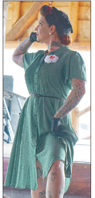
A contestant in the 2023 pinup contest brought her own props and then struck a pose for the judges.