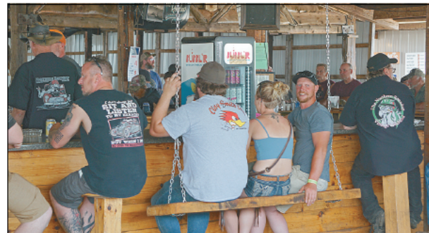
Some attendees sat on hanging swings at the bar, while others perched on rustic wooden barstools.