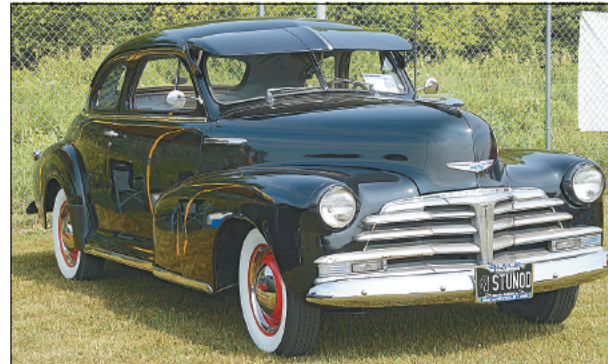
The shine on this vintage model gleams in the sunlight.