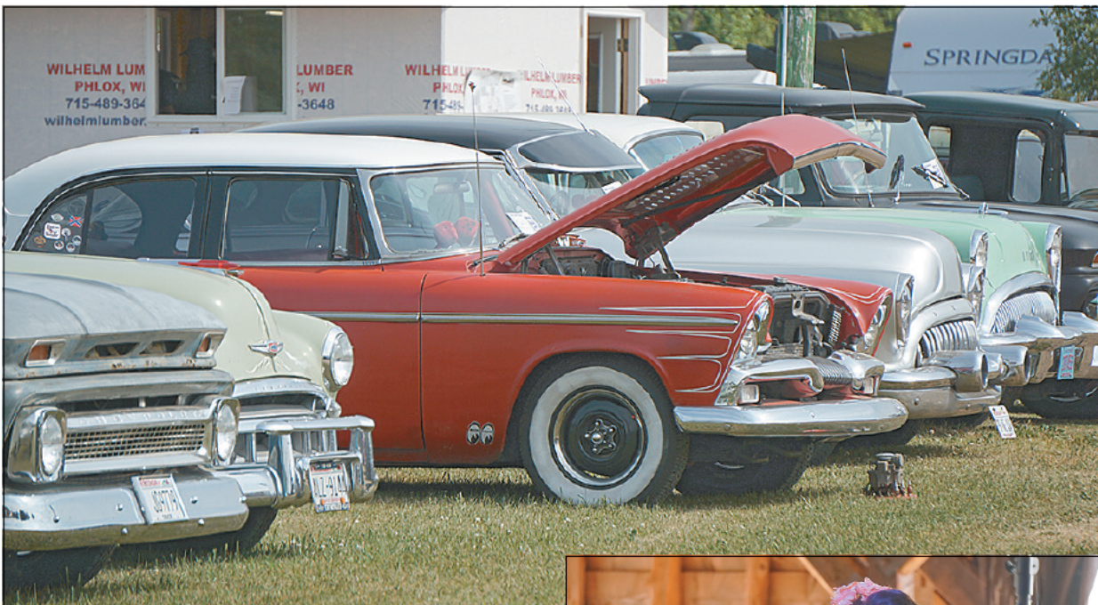
Above: This line of vintage automobiles is a tiny peek at the many vehicles that were on display at Northern Roundup last weekend. Right: White gloves, shoes, hairpiece, dress, pearls, and petticoats outfit this pinup contestant, but pinup girls also showcase their style and sass to gain points with the judges.

Roosters Six Customs Car Club hosts the event. “We started The Northern Roundup Vintage Weekend in 2015 as a way to raise money for local veterans’ charities and to bring a little bit of a different car show experience to the