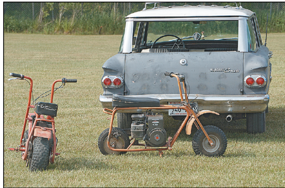
Vintage mini bikes were on parade at the Northwoods Roundup, in addition to automobiles and semi trucks