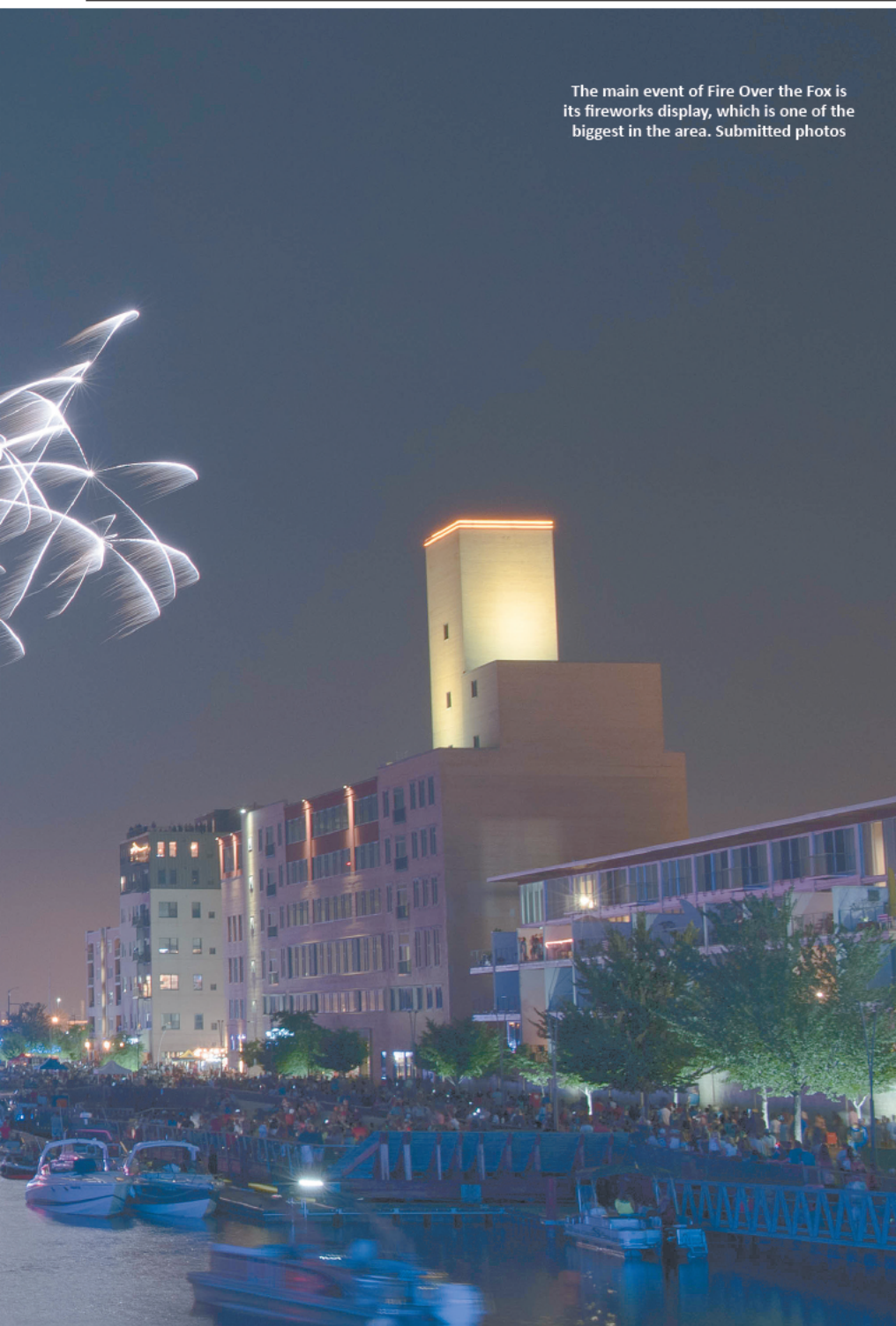
The main event of Fire Over the Fox is its fireworks display, which is one of the biggest in the area. Submitted photos

enjoy a performance from the Waterboard Warriors thanks to a sponsorship from Capital Credit Union. There will be inflatables, bounce houses, an inflatable agility course, henna tattoos and face painting!”