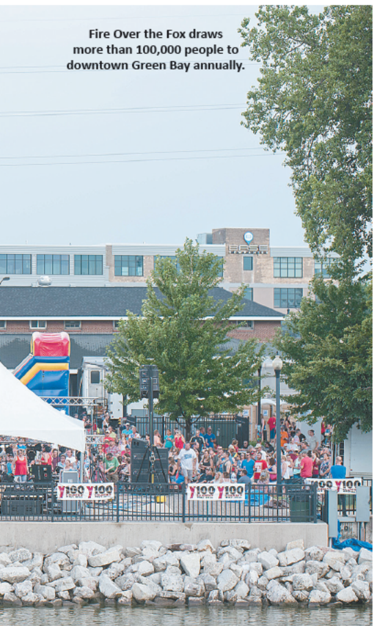
Fire Over the Fox draws more than 100,000 people to downtown Green Bay annually.

More information about the event, including a schedule of performances for each stage, can be found at downtowngreenbay.com , or on the back page of City Pages. CP