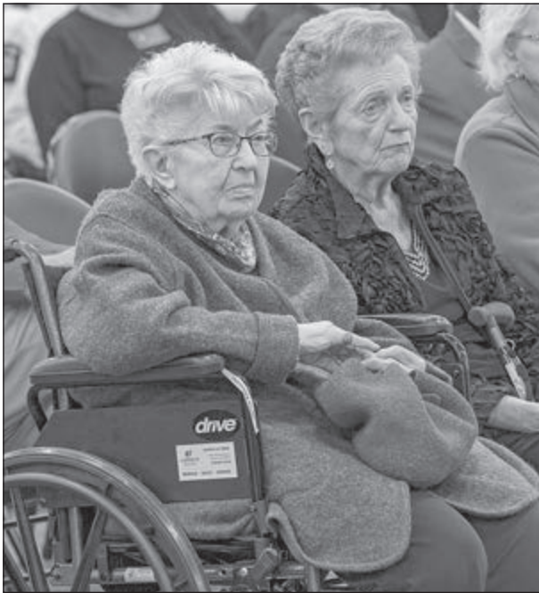
Guests listen during the Loyalty Day program at the Merrill Expo Center.