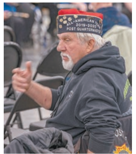
Many veterans and special guests were in attendance at Merrill's Loyalty Day celebration.