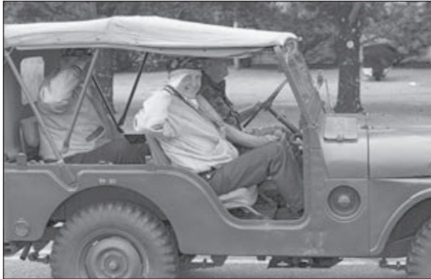
Area veterans travel military style in the Loyalty Day parade.

At 1:00 p.m., a program began that included opening ceremonies by the