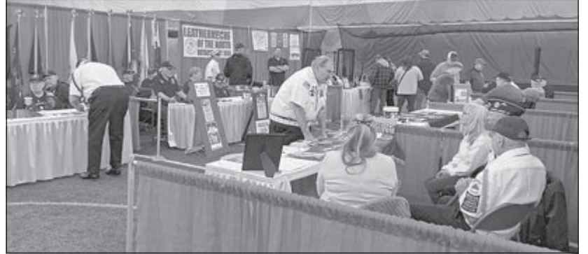
Hundreds of veterans and their families attended a Veterans Benefit Expo Friday at the Hodag Dome in Rhineland.

"To provide the resources to veterans and to bring representatives