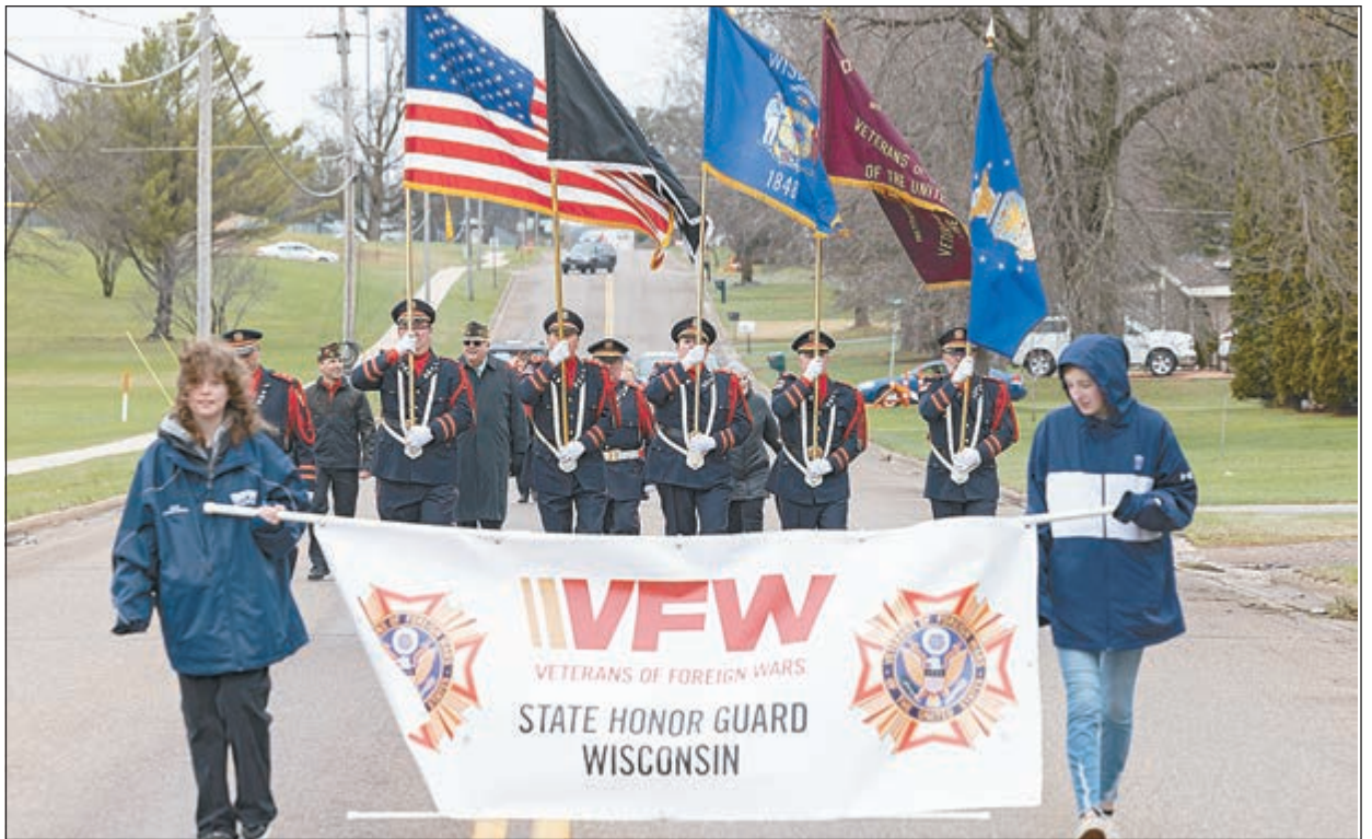
The VFW State Honor Guard of Wisconsin was among those marching in the parade and carrying flags in a heartwarming display of patriotism on a very cold April morning.