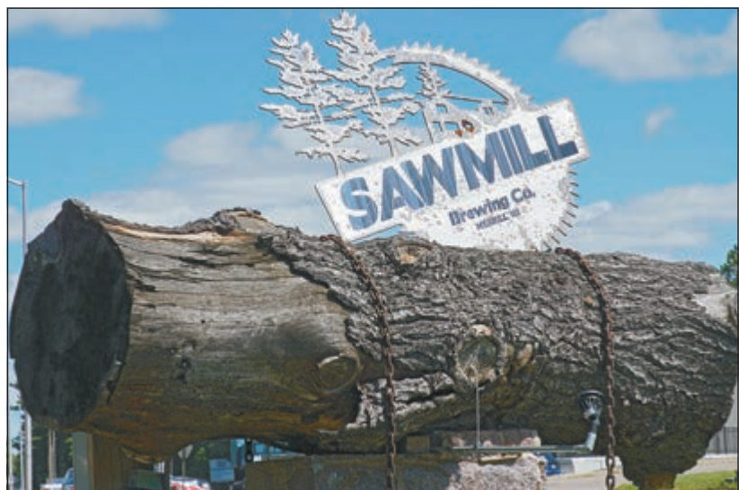
Sawmill Brewing Company.