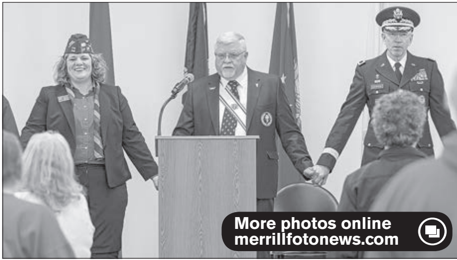
More photos online merrillfotonews.com