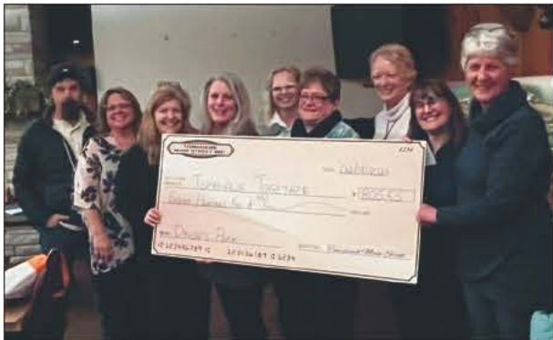
Tomahawk Main Street Inc. donated $805.00, raised during its Chili Cook-Off, to Tomahawk Together.