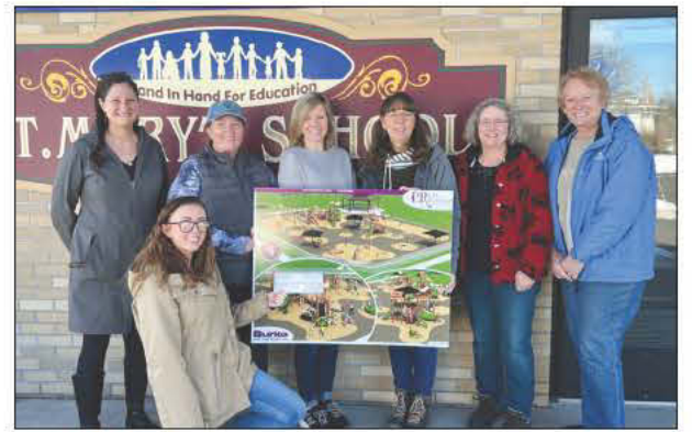
A pair of fundraising dances sponsored by St. Mary's Catholic Church raised a total of $2,676.77 for Our Dream Park.