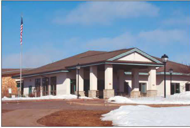
Pine Crest Nursing Home in Merrill.