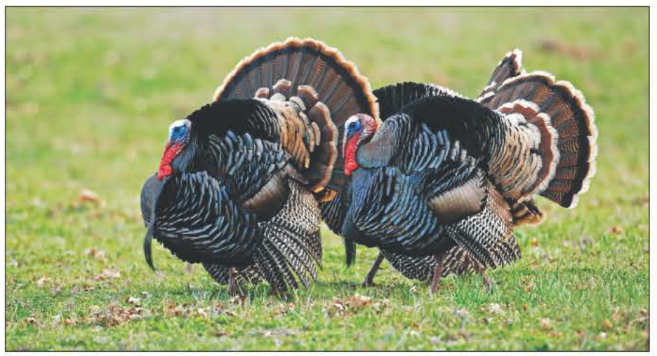
The state's 2023 youth turkey hunt is slated for Saturday, April 15 and Sunday, April 16.

Additionally, youth hunters must have completed