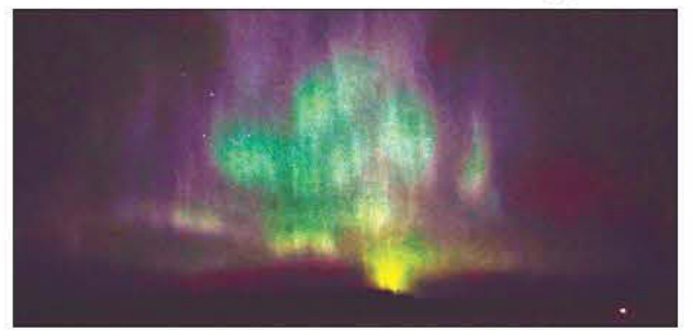
While the northern lights appeared only white to my eyes, the light-gathering powers of a camera lens can pick up on the greens, reds and purples that are actually being emitted and show us just how vivid the lights truly are.