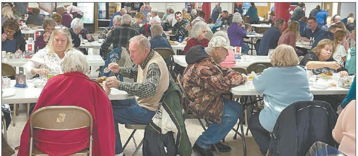
The St. Francis Xavier Catholic School cafeteria was the place to be last Friday, Feb. 17, for the first St. Francis Lenten fish fry of the 2023 season.