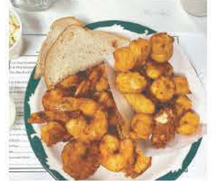
Lightly battered jumbo shrimp are also on the menu, and diners can substitute deep fried cheese curds in place of French fries or baked potato for an additional charge.