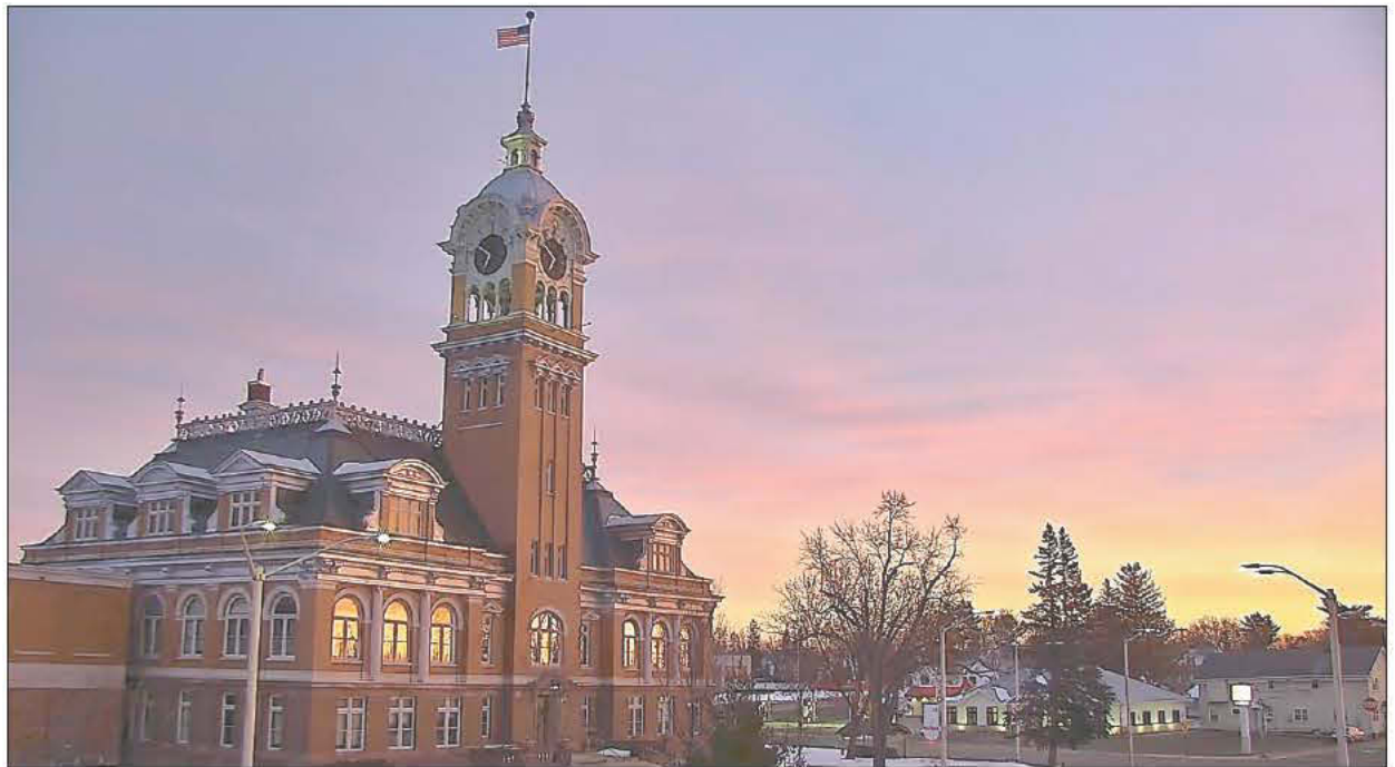
One of our loyal Foto News readers sent us this beautiful Valentine’s Day sunrise image captured from the WSAW Skycam here in Merrill. Did you know you can check out the weather in Merrill via the Skycam at any time? You can also see what the weather is doing in Marshfield, Plover, Wausau, Rib Mountain, and Stevens Point by peeking in at the Skycams. Take a look: https://www.wsaw.com/weather/cams/ . WSAW Merrill Skycam sponsored by Courtside Furniture.