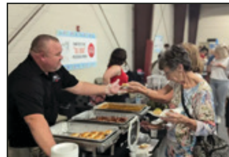
Funds raised at Taste of Long Beach go toward local business development through small business grants and also fund scholarships for local high school students.