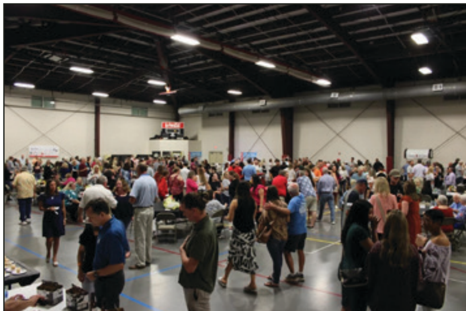
An estimated crowd of 600 people attended the 15th Annual Taste of Long Beach fundraiser, which is put on each year by the Long Beach Chamber of Commerce.