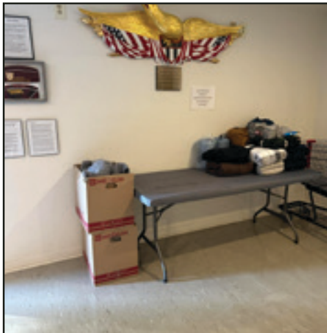
Special to Long Beach Breeze Tables for donations are set up in the VFW hall.

For more information, visit the Post on Facebook, "Eddy Blake Post 3937."