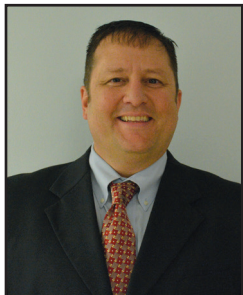
Special to Long Beach Breeze