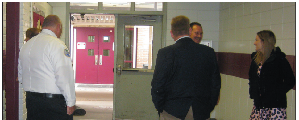
An interior view of doors and hallway

In March of this year, the Long Beach School District (LBSD)