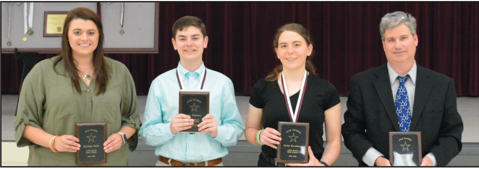
Special to Long Beach Breeze