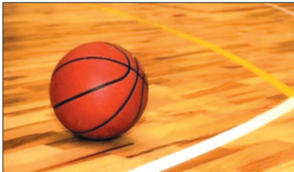
Special to Long Beach Breeze