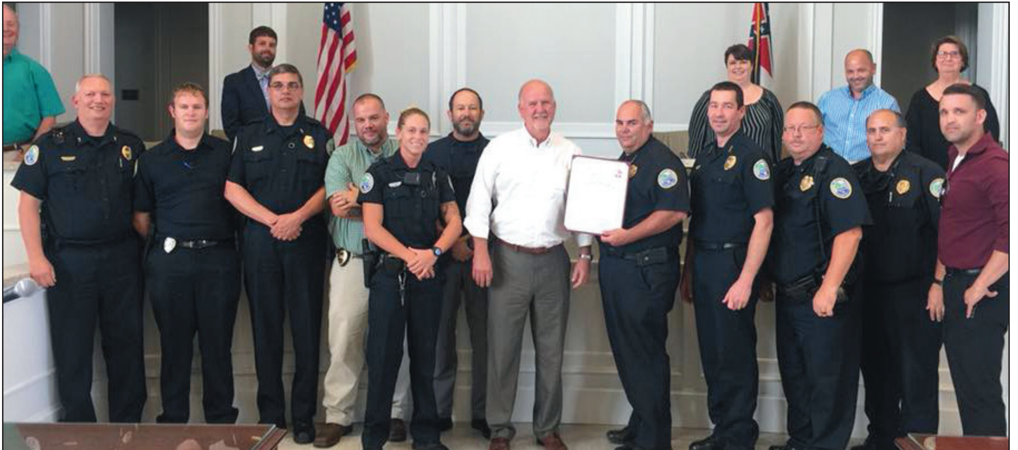
Special to Long Beach Breeze