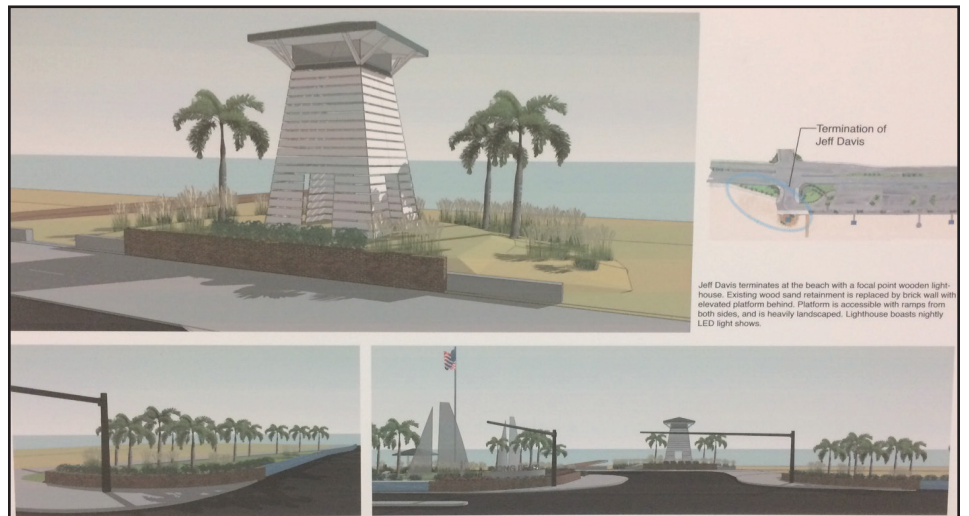
Artist rendition of Jeff Davis and Highway 90 intersection

The plan is to construct a landscape with features bold enough to draw attention to Jeff Davis Avenue and lead to the downtown area shops and businesses. In the planned upgrades, Jeff Davis terminates at the beach with a focal point wooden lighthouse. Existing wood and sand retainment is