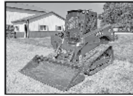
LC9143 19 John Deere 331G tracked skid steer