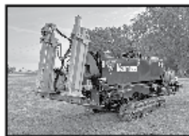
LC9060 '21 Vermeer D24x40 Nav Series III dir boring unit

ALLERTON ITEMS SELL NO RESERVE! THURSDAY, OCTOBER 17