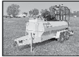
LC9069 '21 Finn T75T-09 hydroseeder