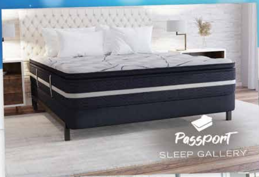
Passport SLEEP GALLERY

shoprentone.com RENT ONE HOME FURNISHINGS