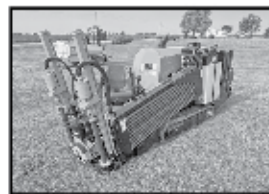
LC9070 '21 Vermeer D10x15 Nav Series III dir boring unit