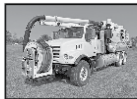
LC9068 '04 Sterling LT7500 sewer jetter truck